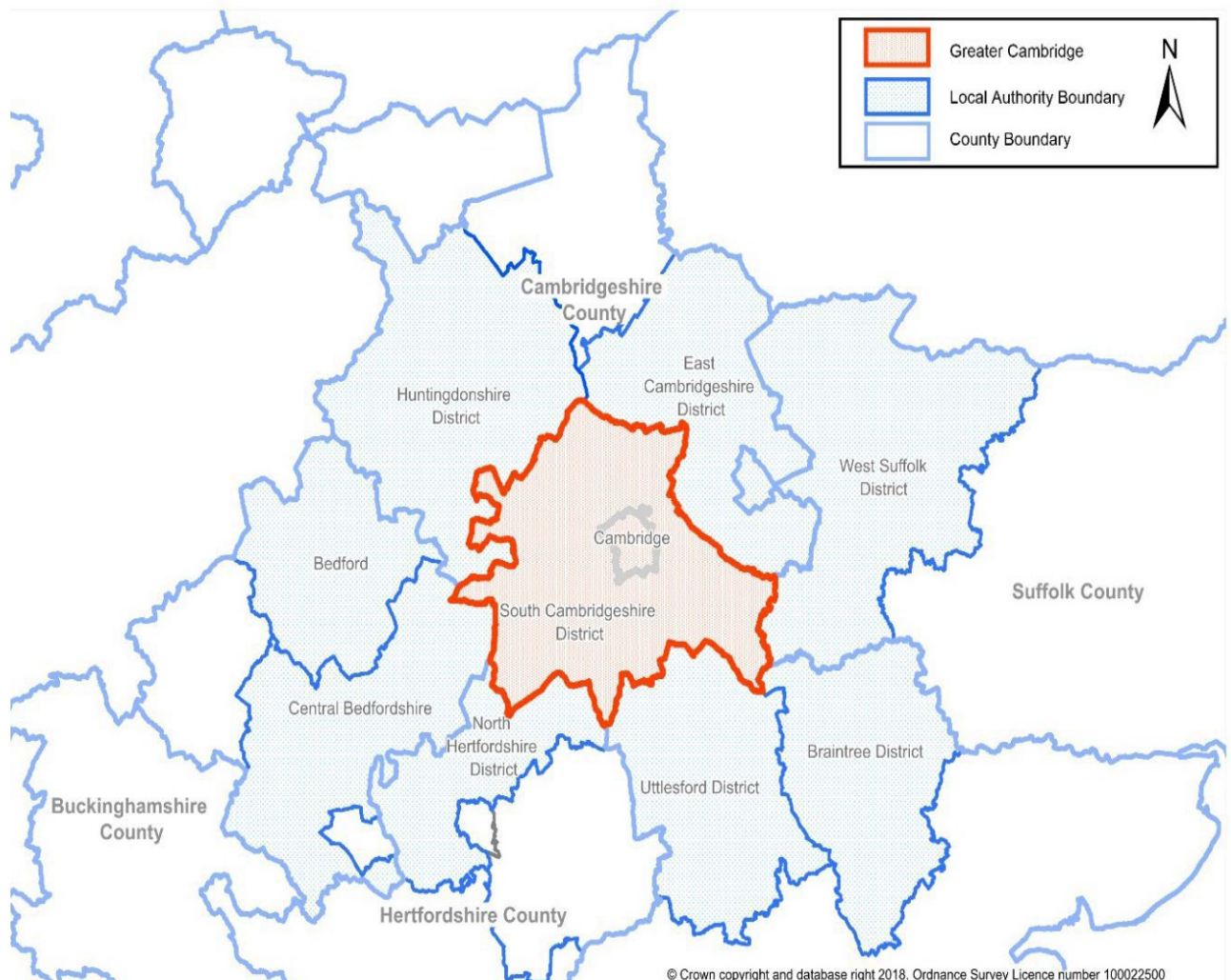
Figure 1: Strategic context – adjacent local authorities

4.2 Greater Cambridge is a two-tier area, with Cambridgeshire County Council providing many public services including education, highways and adult care. In addition, the Cambridgeshire and Peterborough mayoral Combined Authority has responsibilities for local transport policy among other roles.