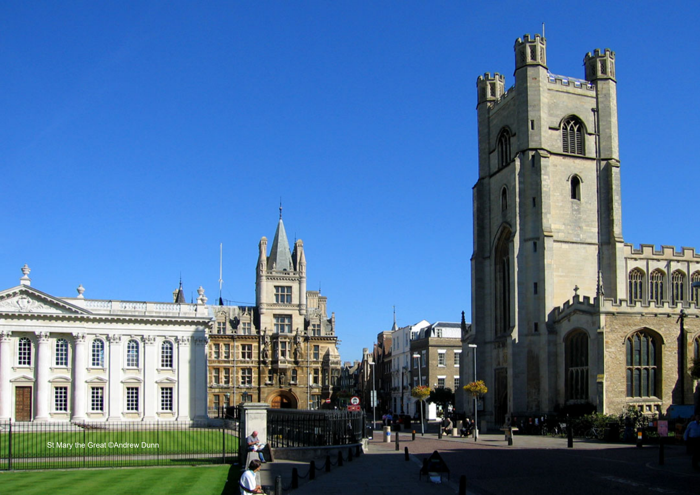
St Mary the Great