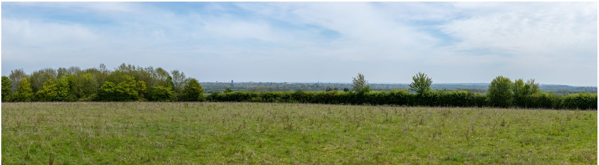
Image 24: View towards Cambridge from Red Meadow Hill (View Point H - Analysis of this view is included in Appendix A)