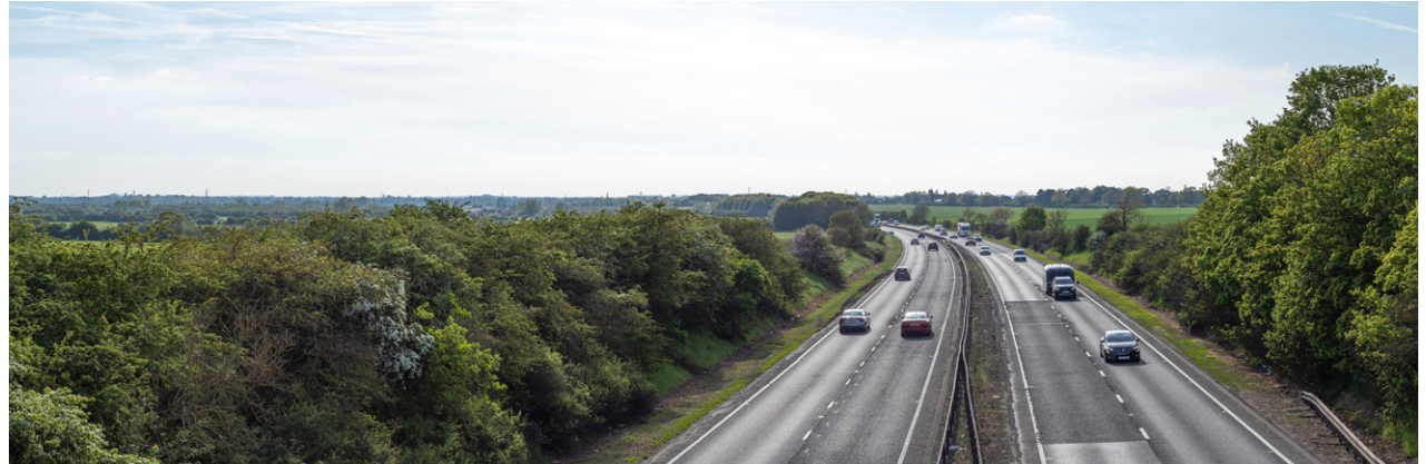
Image 29: View towards Cambridge from Little Wilbraham Road over A14