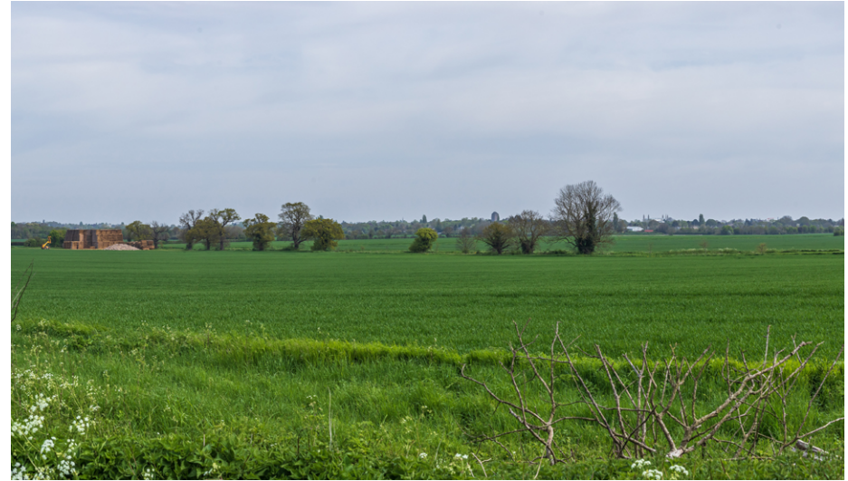
Image 27: View towards Cambridge from Coton Road looking across Granchester Meadows.