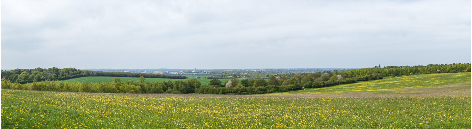
Image 23: View towards Cambridge from Little Trees Hill, Magog Down (View Point F - Analysis of this view is included in Appendix A)