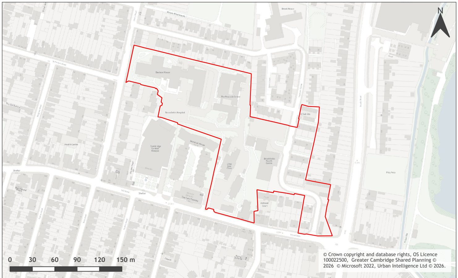
A map of 315-349 Mill Road and Brookfields (Policy 27 - R21)