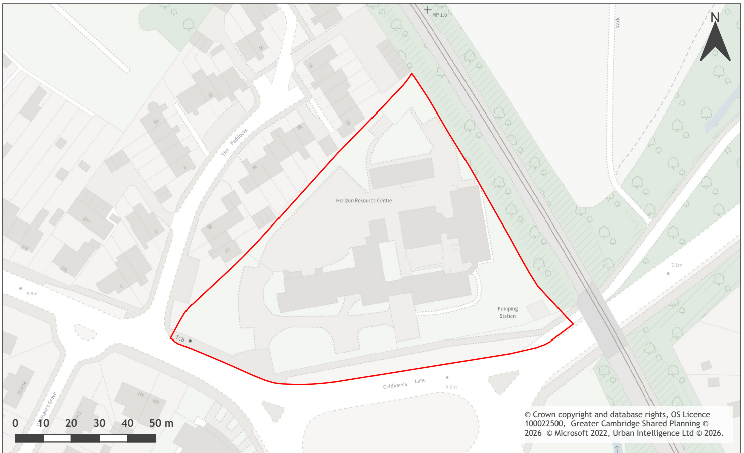
A map of Horizons Resource Centre, 285 Coldham's Lane (Policy 27 - R11)