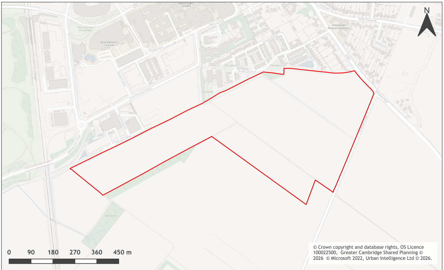
A map of Land at Granham's Road, Cambridge