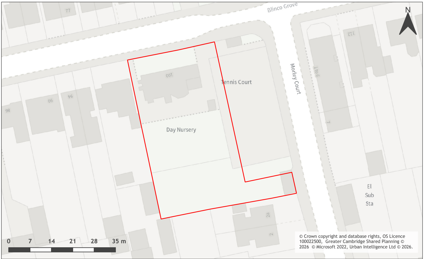
A map of Land west of Baldock Way, Cambridge