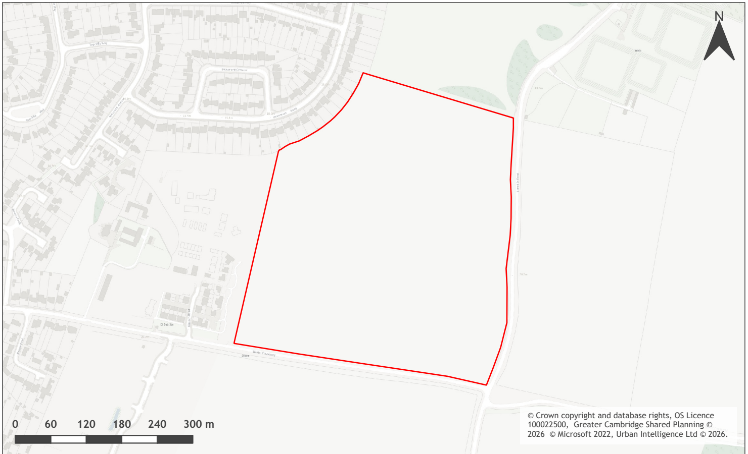
A map of North of Wort's Causeway and West of Limekiln Road, Cherry Hinton, Cambridge. CB1 8PU