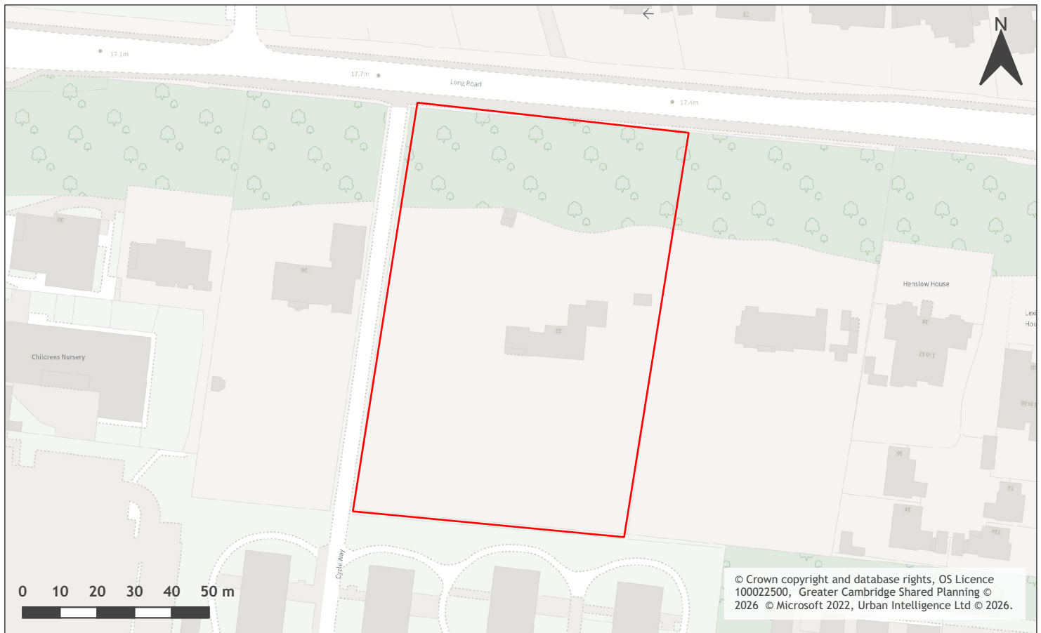
A map of 22 Long Road, Cambridge