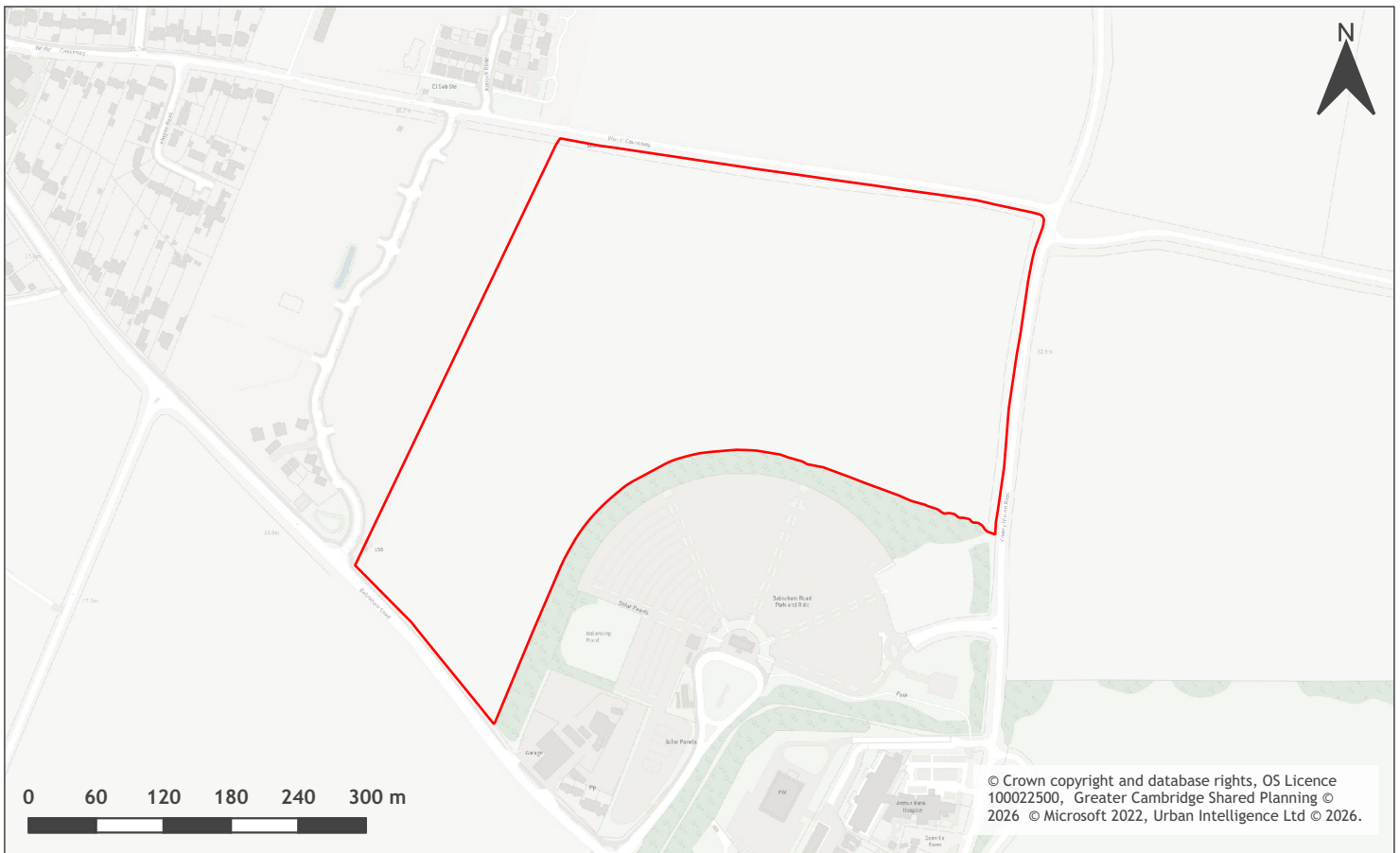
A map of Land south of Worts Causeway, Cambridge