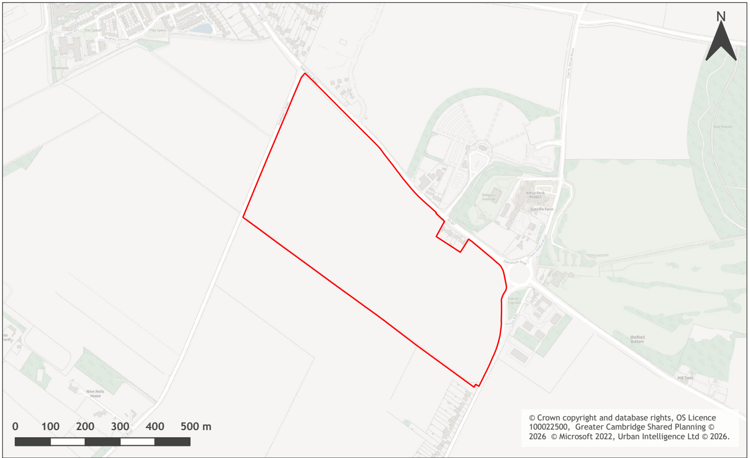
A map of Land south of Babraham Road, Shelford Bottom