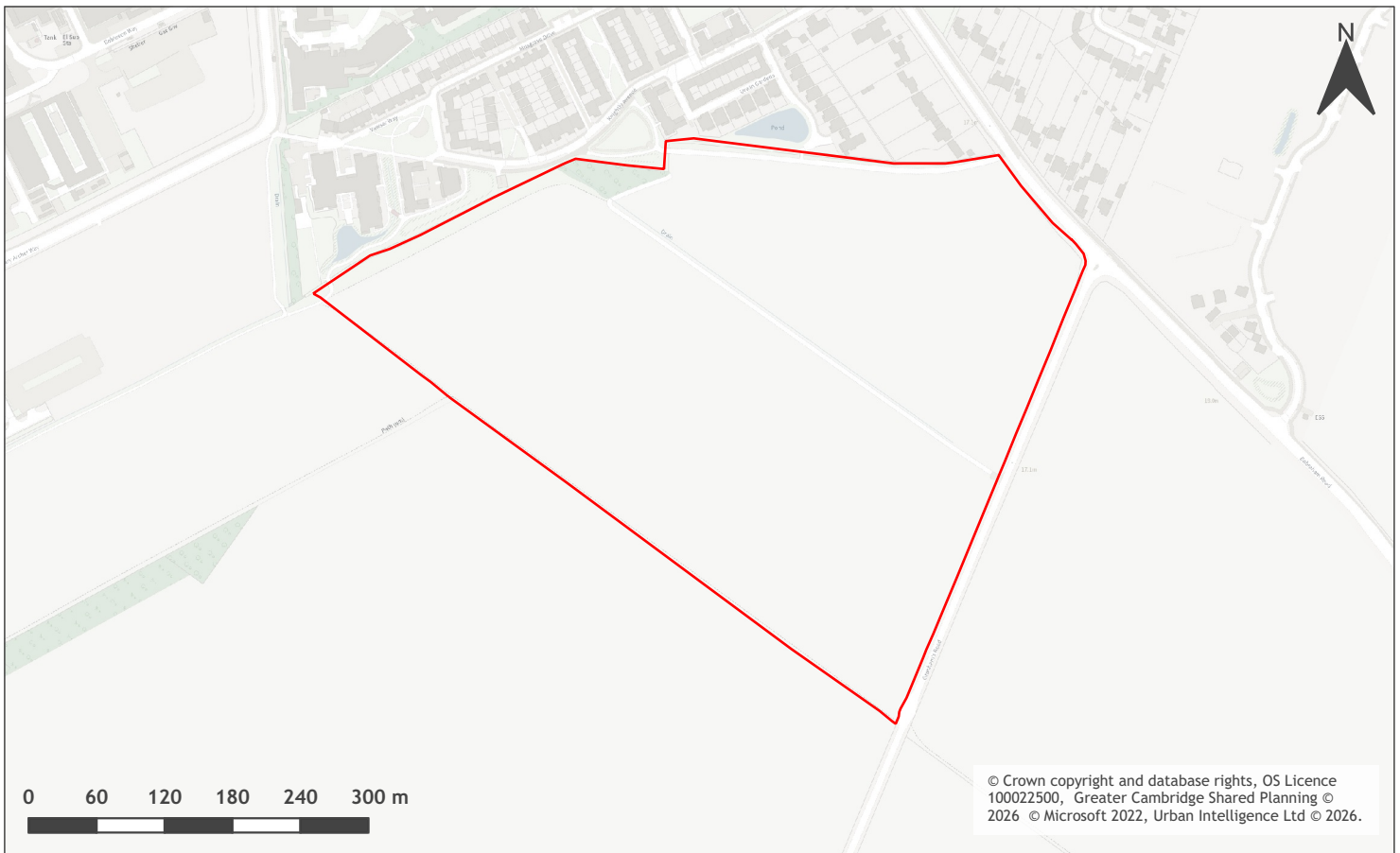
A map of Cambridge Biomedical Campus Extension (North of Granham's Road)