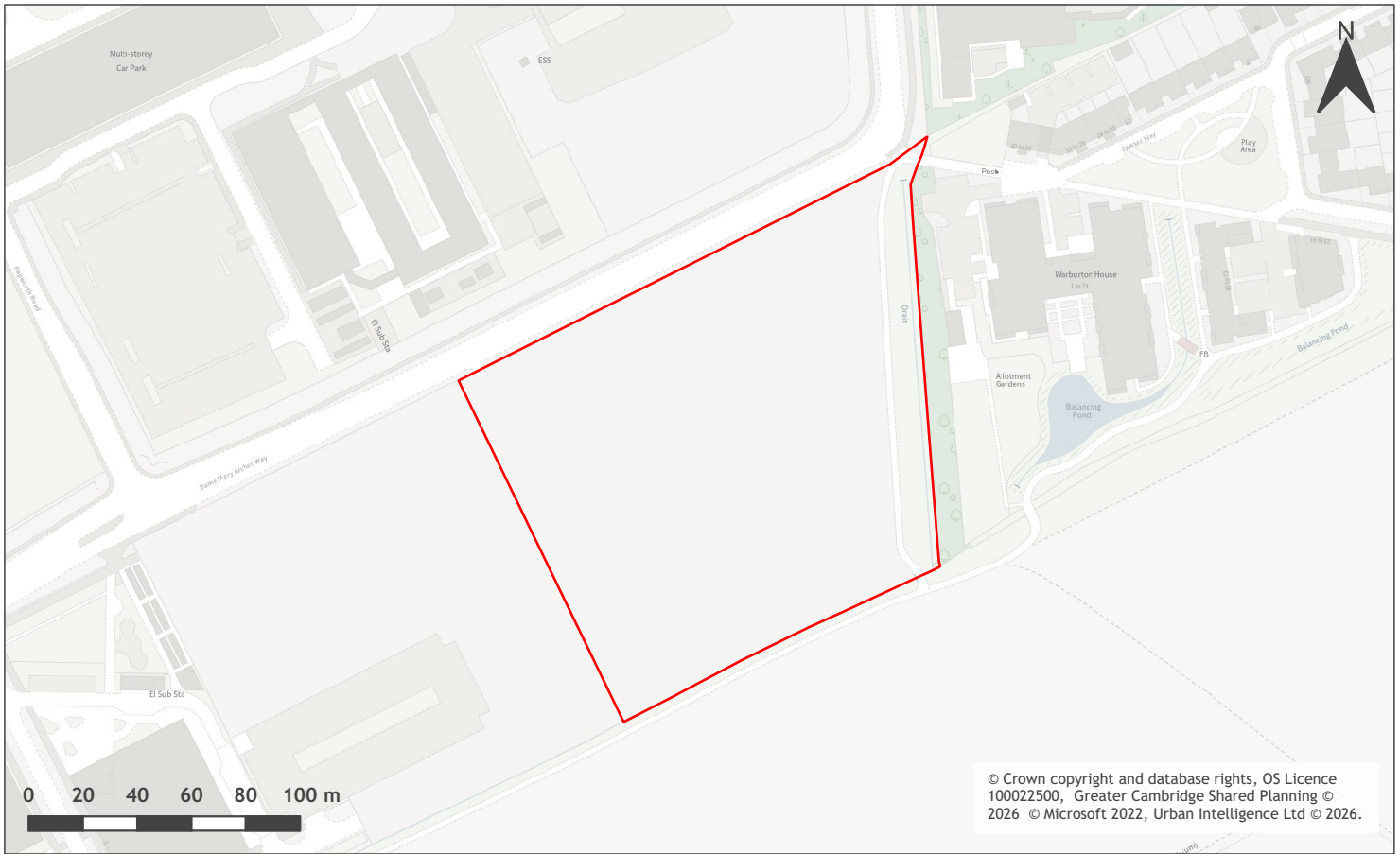
A map of Addenbrookes Hospital Extension, Cambridge