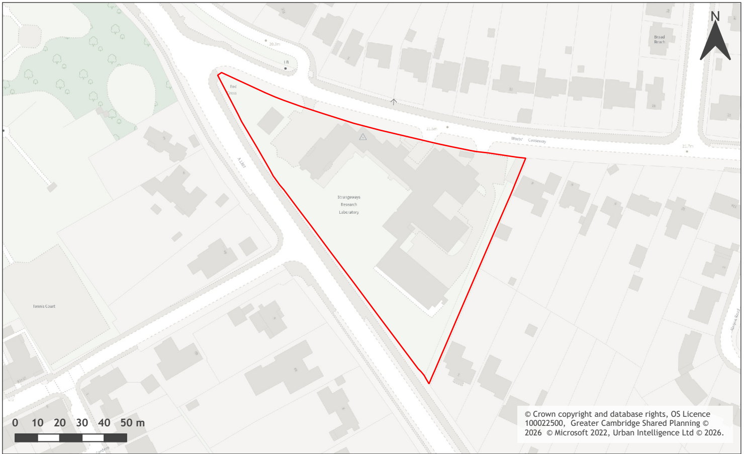
A map of Strangeways Research Laboratory 2 Worts' Causeway Cambridge