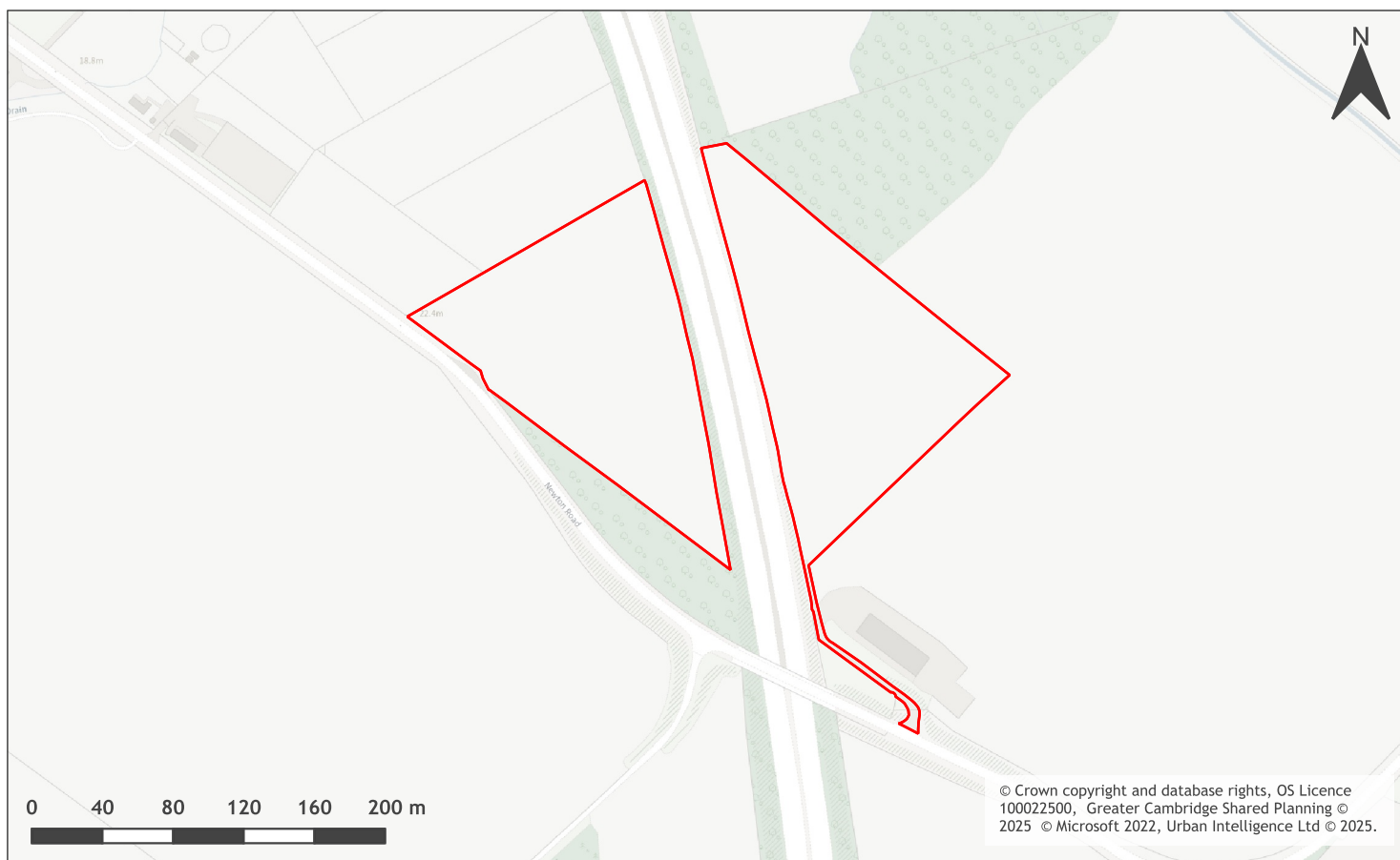
A map of Land adj. to M11, Whittlesford