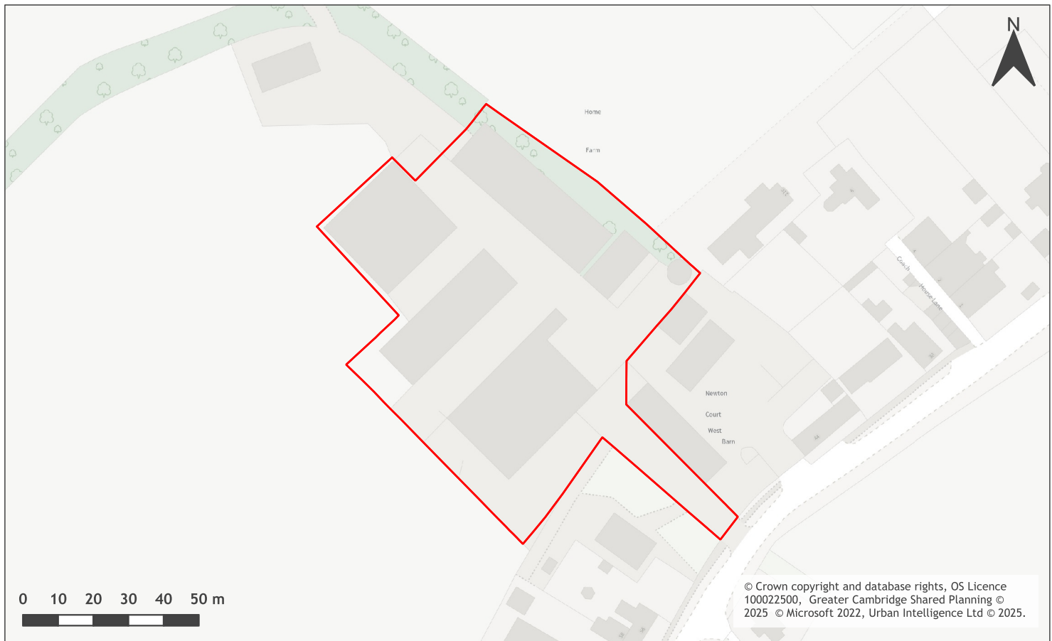
A map of Land at Home Farm, Newton