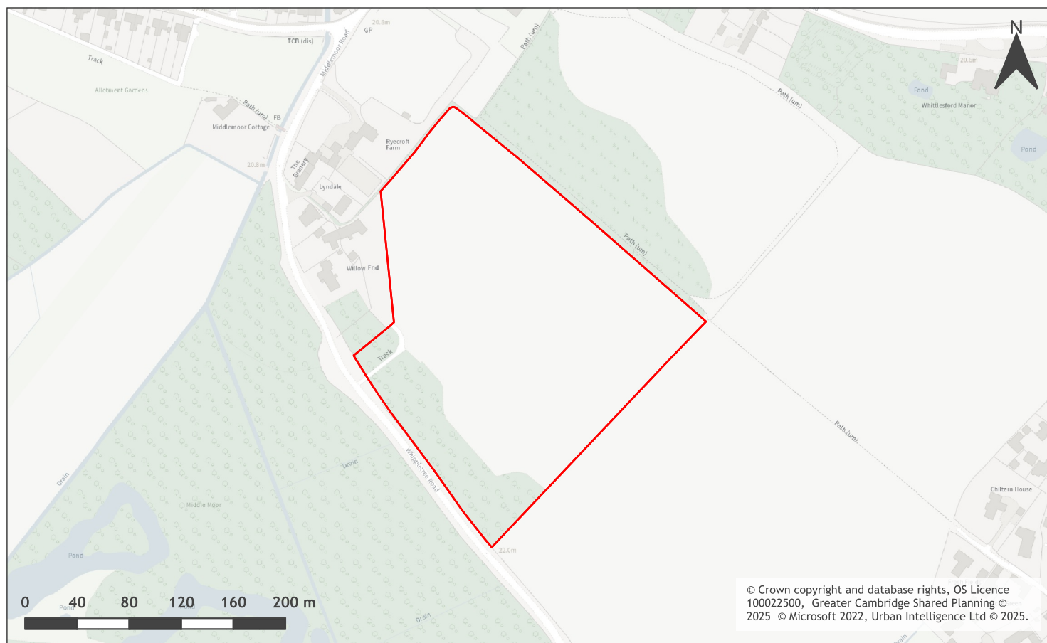
A map of Land to the north-west of Whippetree Road, Whittlesford