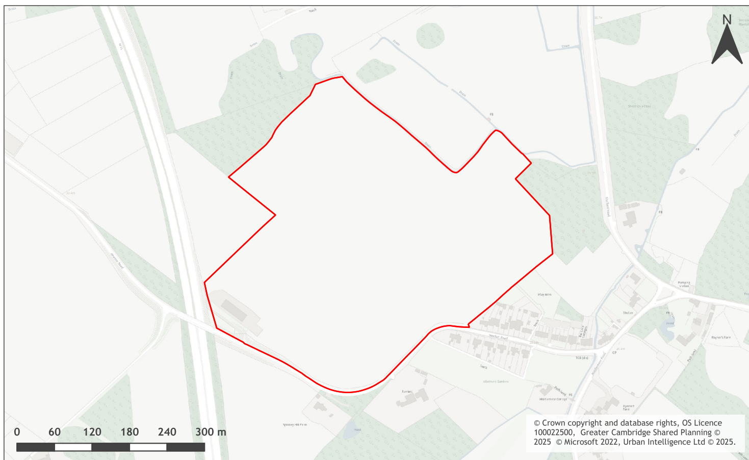
A map of Site on the north side of Newton Road, Whittlesford