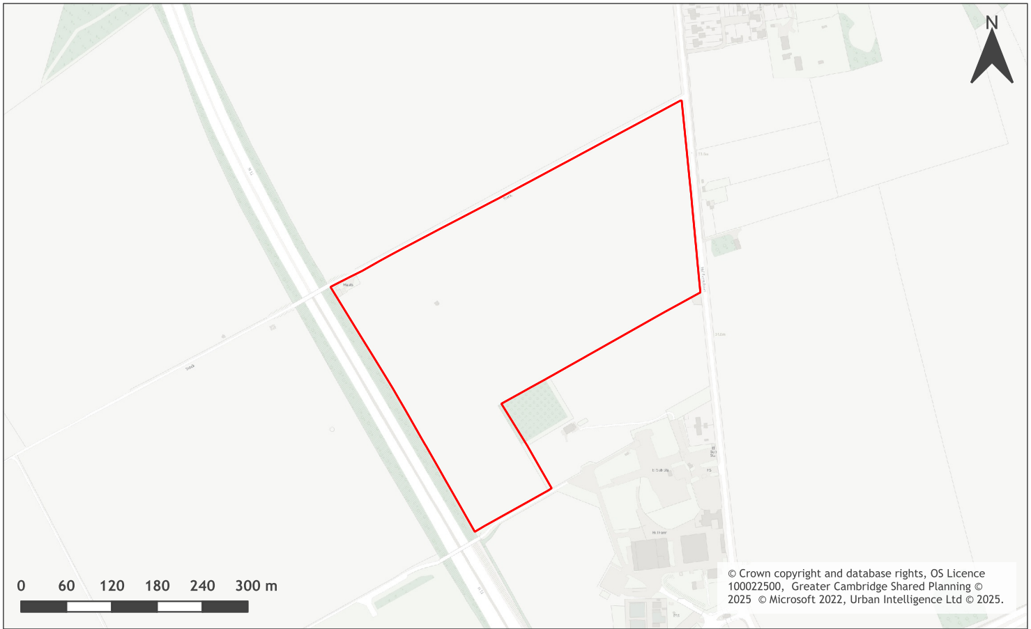
A map of Land east of M11, Hill Farm Road, Whittlesford