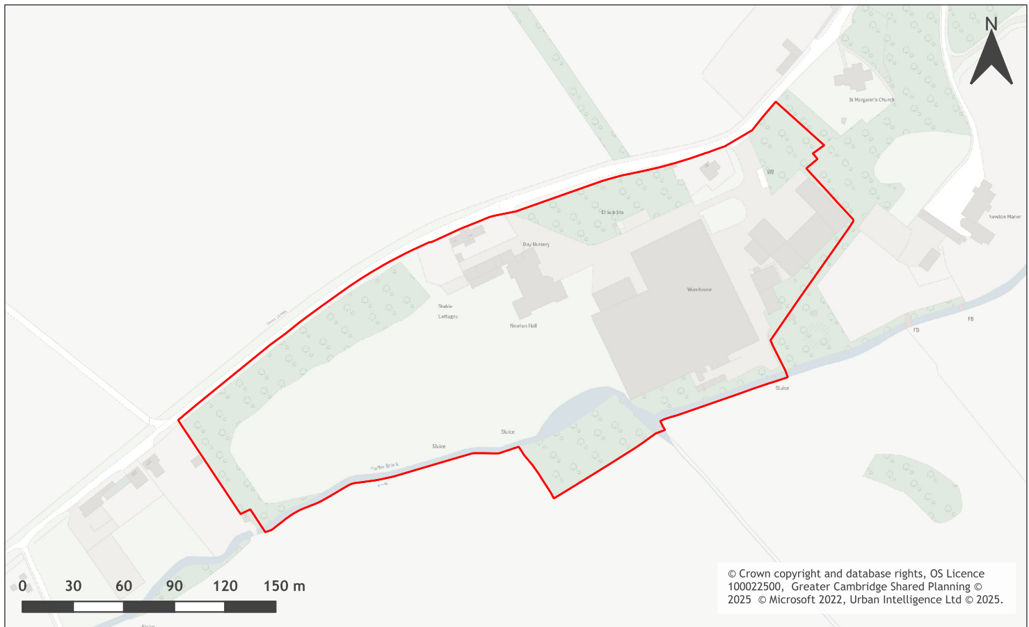
A map of Newton Hall Industrial Estate, Town Street, Newton