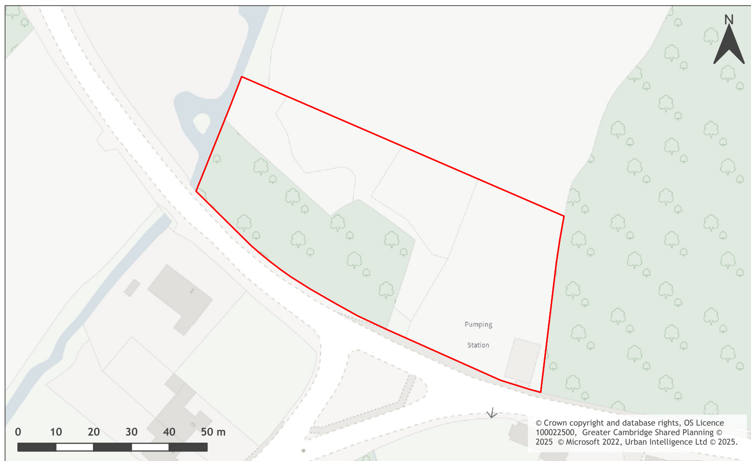
A map of Land to north of North Road, Whittlesford