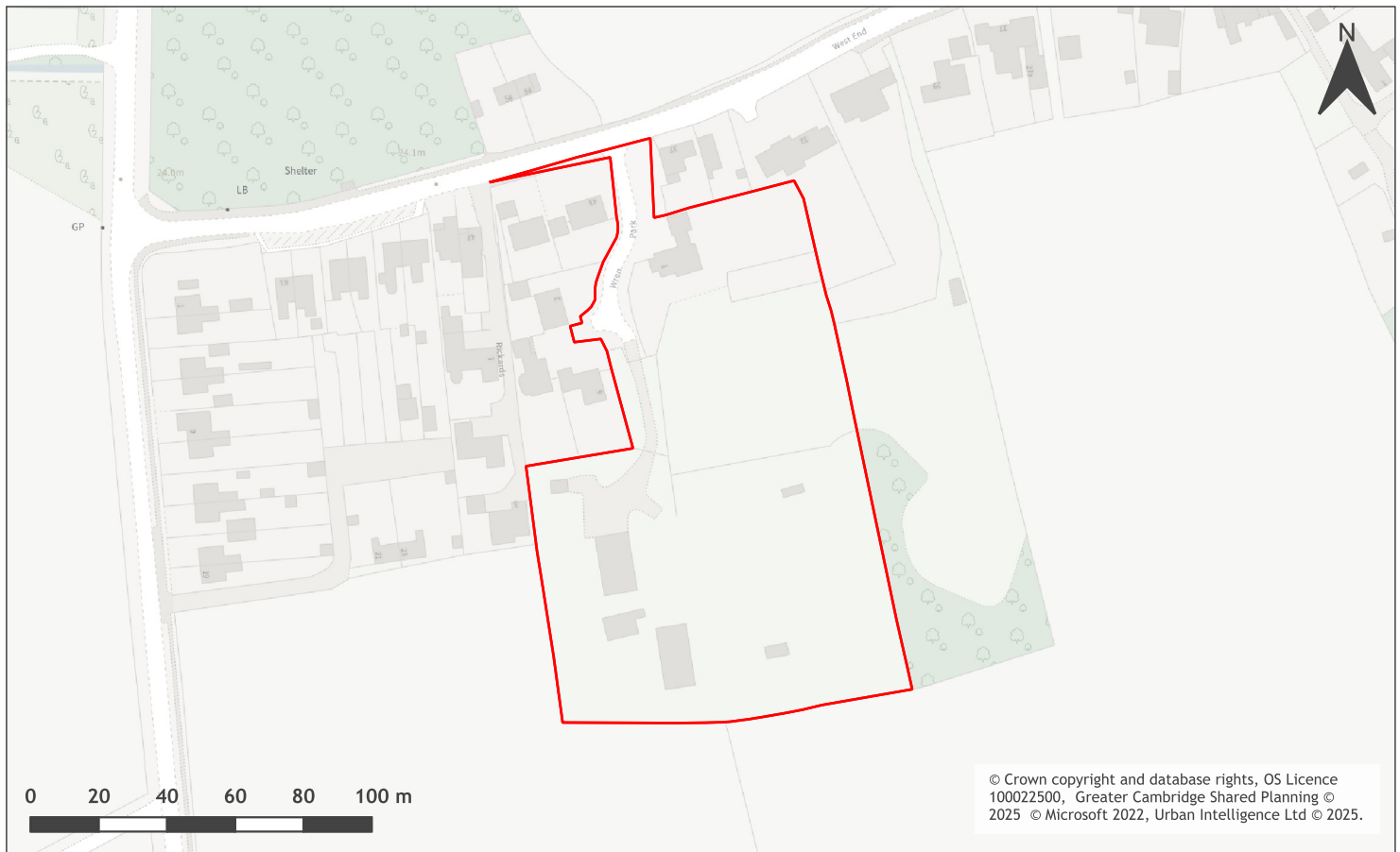
A map of Fosters Field, Hill Farm, Whittlesford