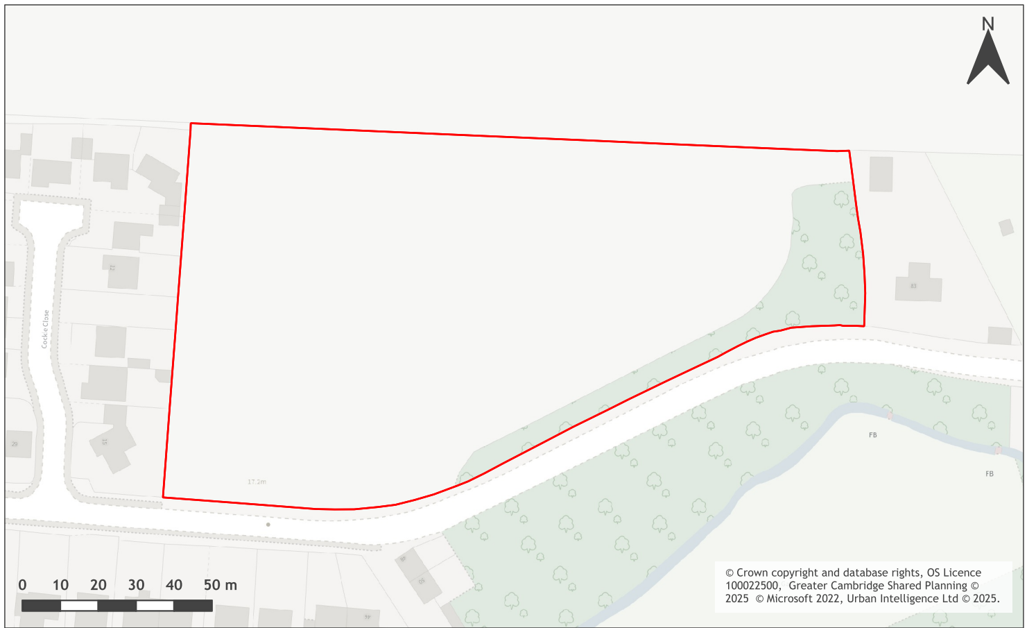
A map of Land to the north of Whittlesford Road, Newton