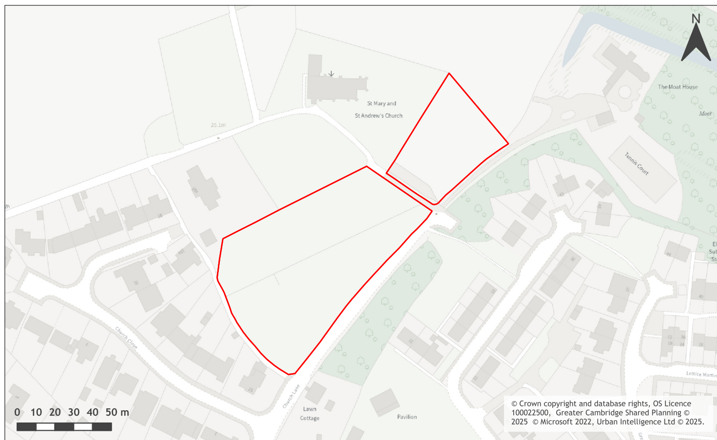
A map of Land at Whittlesford Walled Garden, Church Lane, Whittlesford