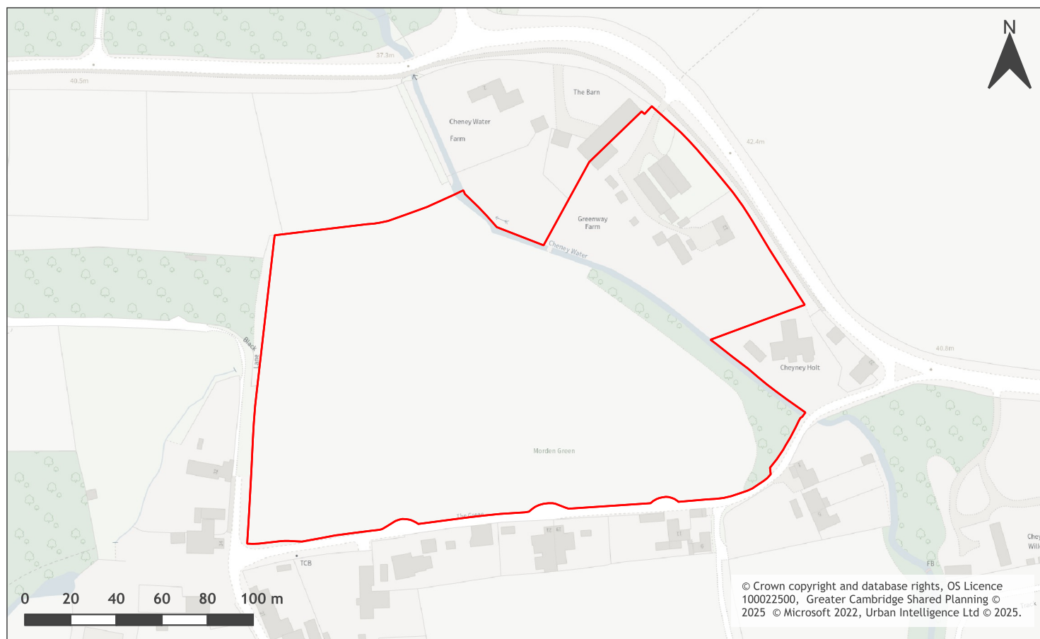
A map of Land at Greenway Farm, Litlington Road, Steeple Morden