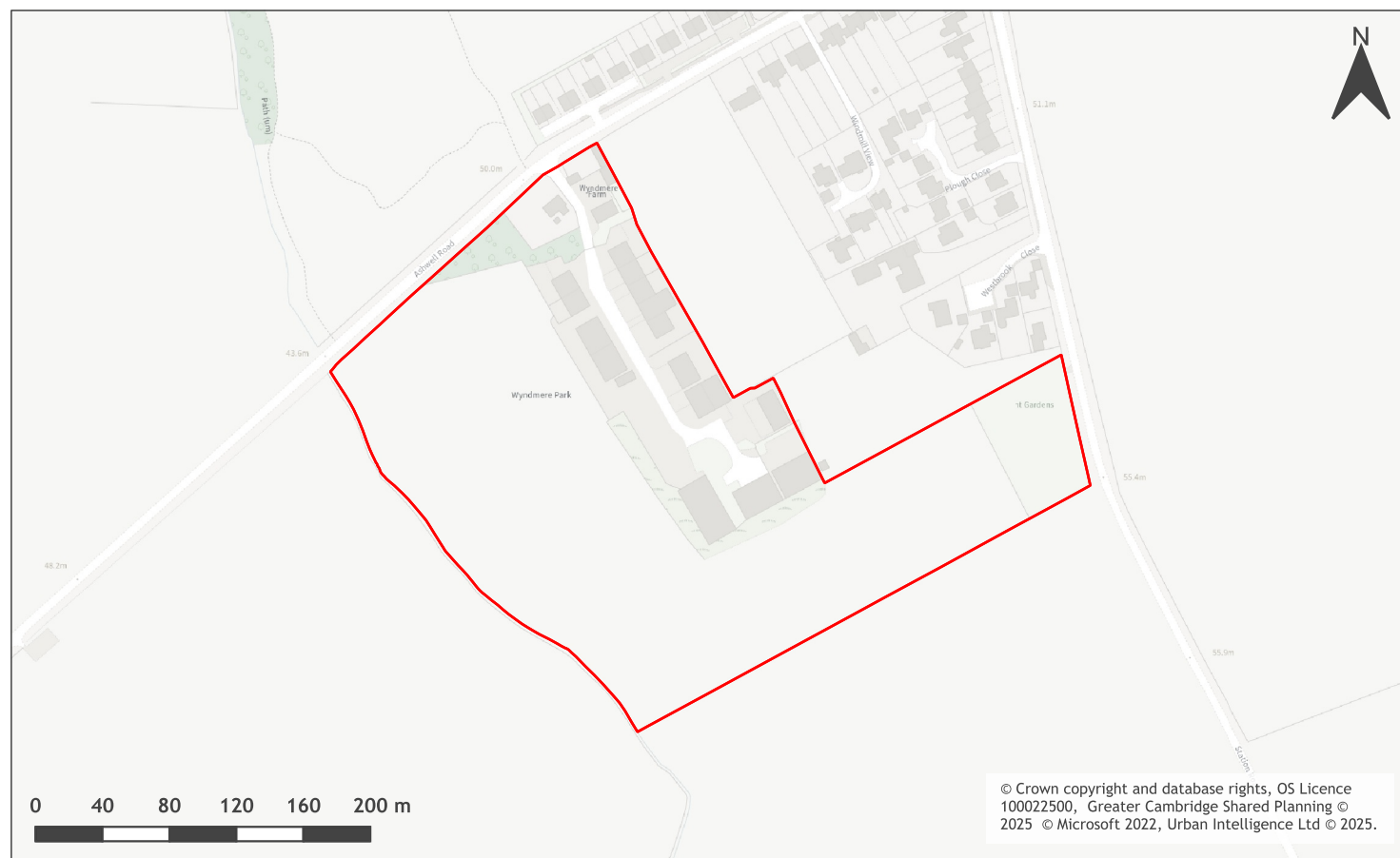
A map of Wyndmere Farm, Steeple Morden