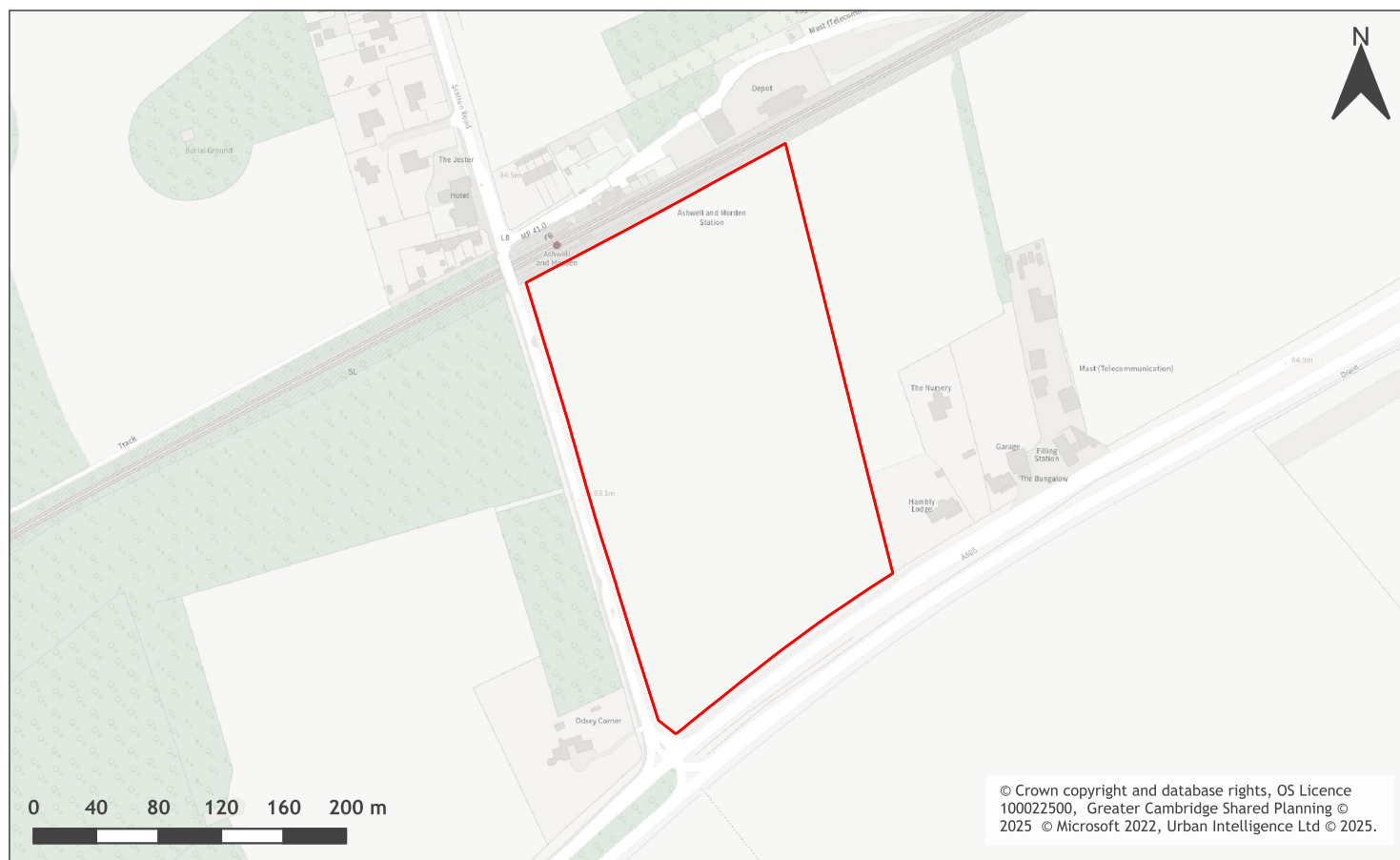
A map of Land to east of Station Road, Odsey