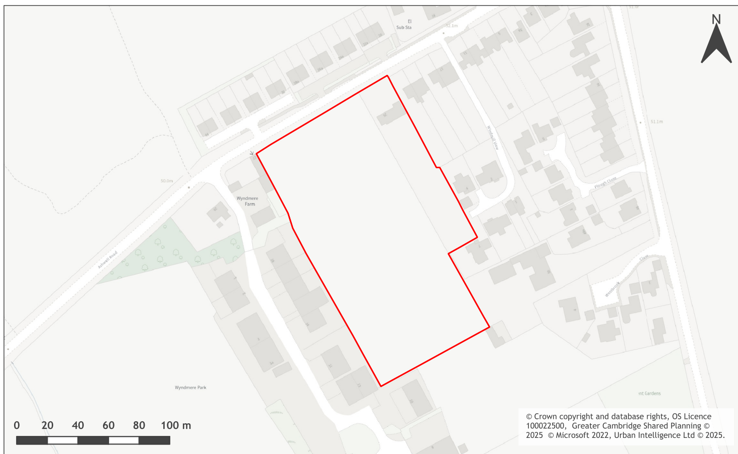
A map of Land and buildings at 25 Ashwell Road, Steeple Morden