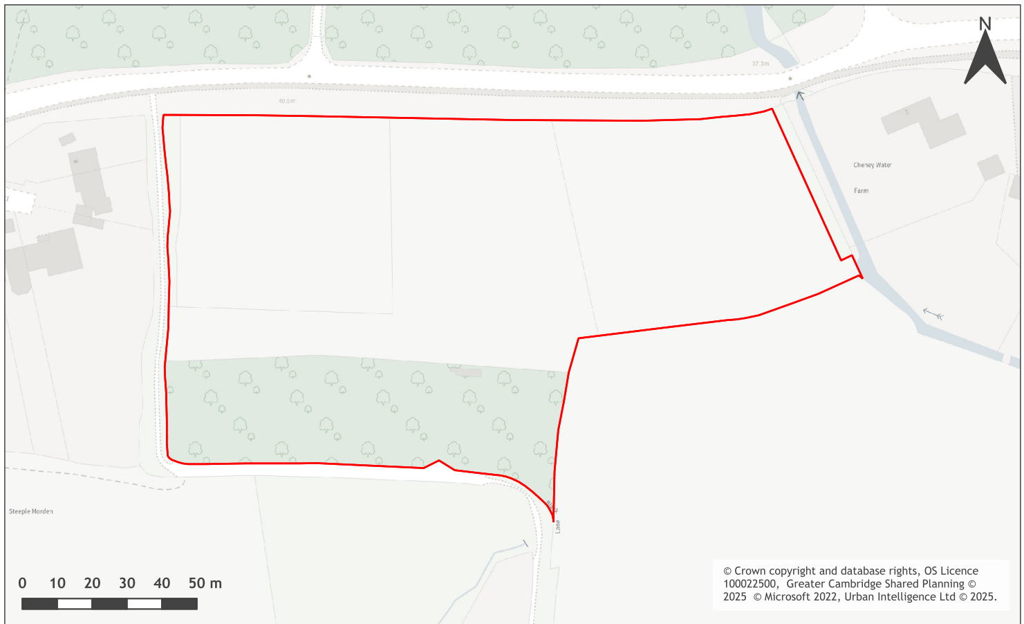
A map of Land south of Cheyney Street, Steeple Morden