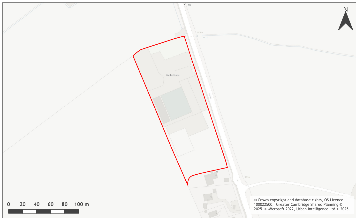
A map of Land to the south-west of Ermine Way, Arrington