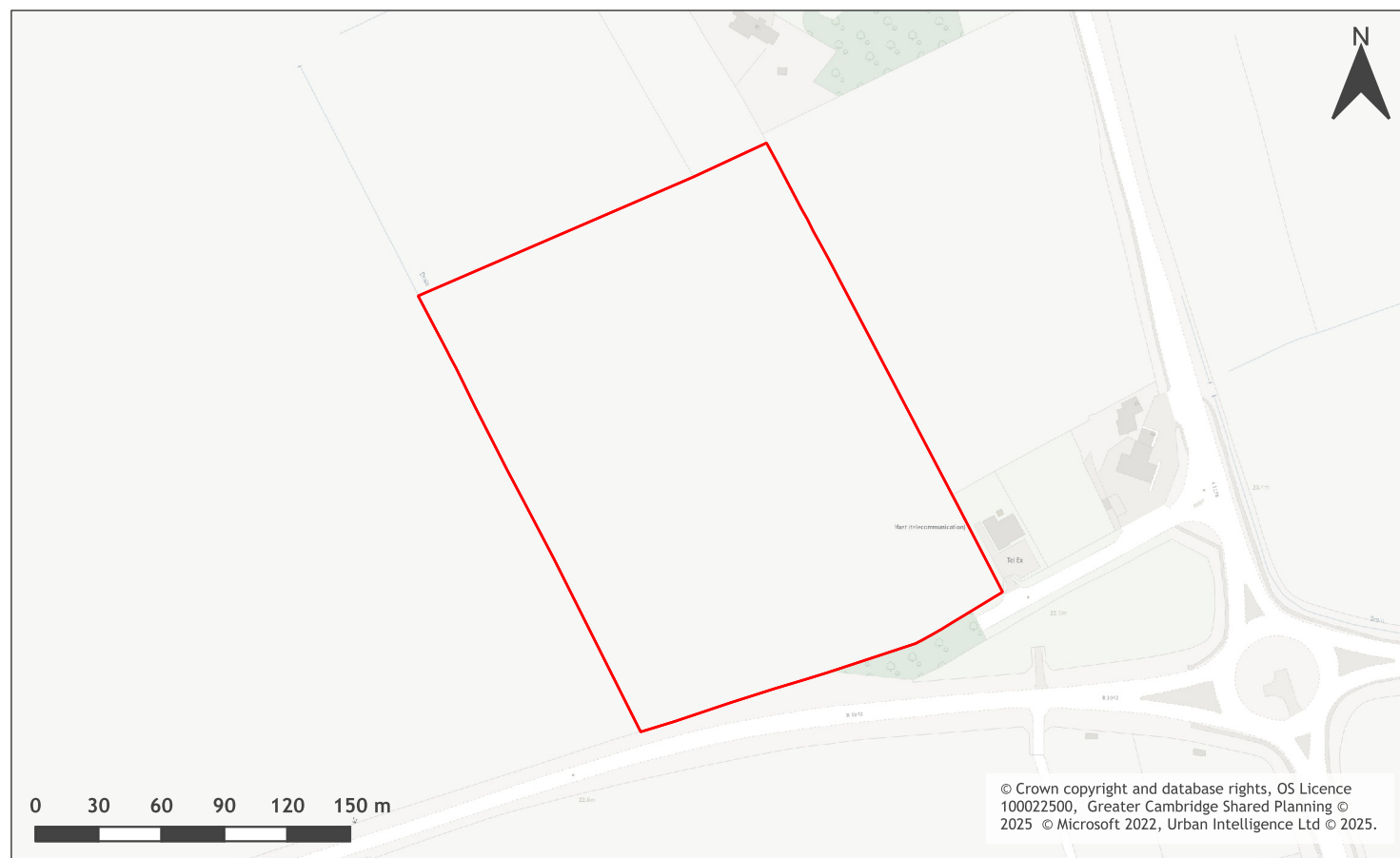
A map of Land south of Whitehall Farm, Arrington