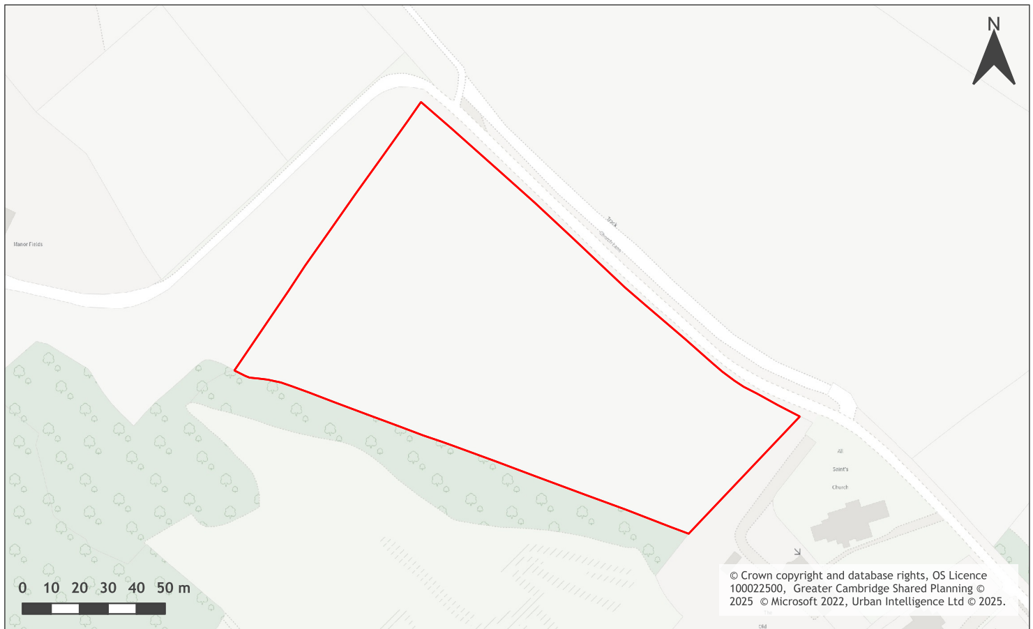
A map of Land west of Church Lane, Croydon