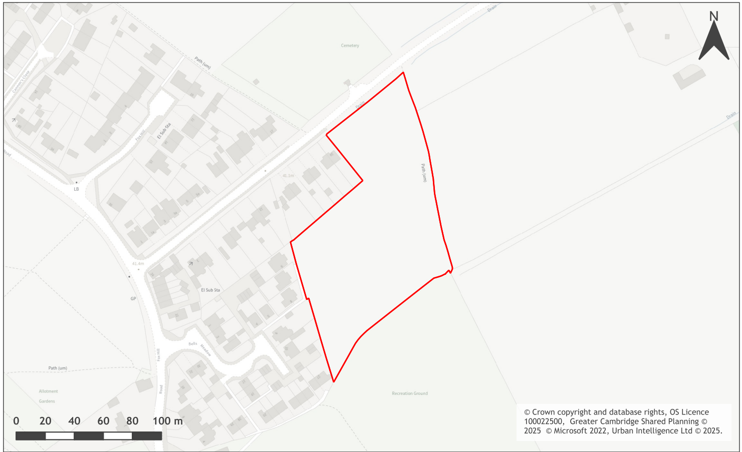
A map of Land south of New Road, Guilden Morden