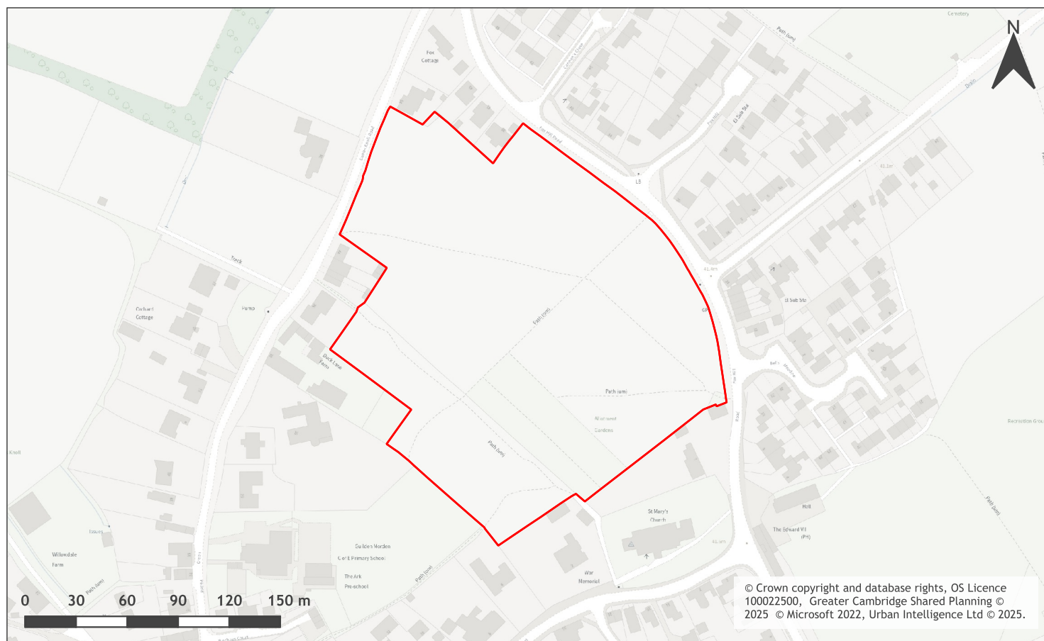
A map of Land off Dubbs Knoll Road, Guilden Morden