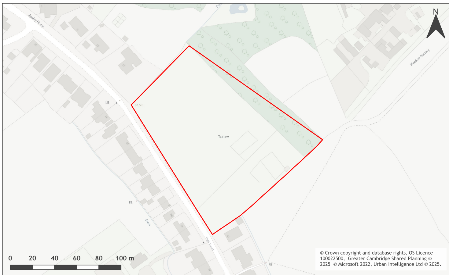
A map of Land off High Street, Tadlow