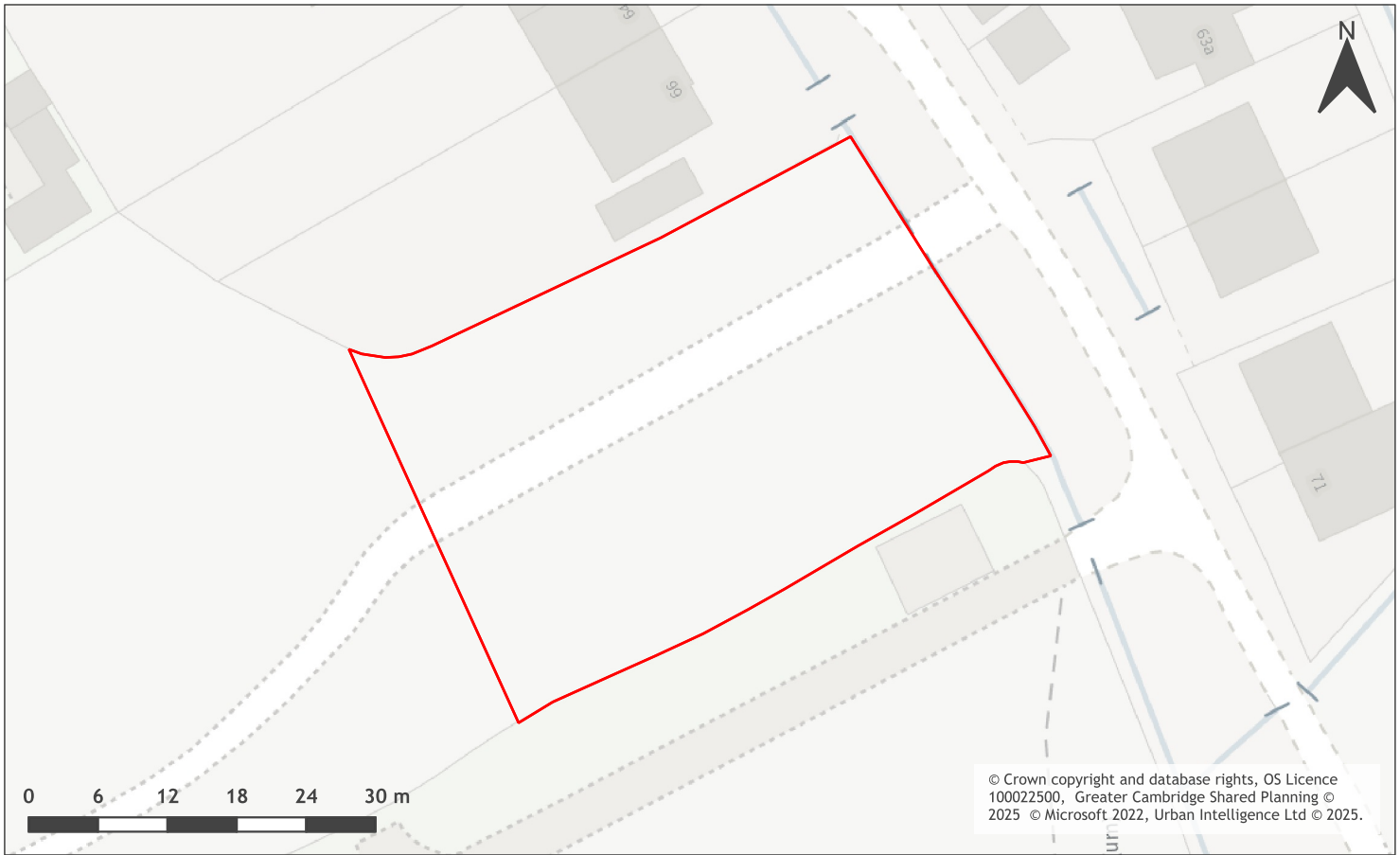
A map of Land at Sheep Walk, High Street, Tadlow