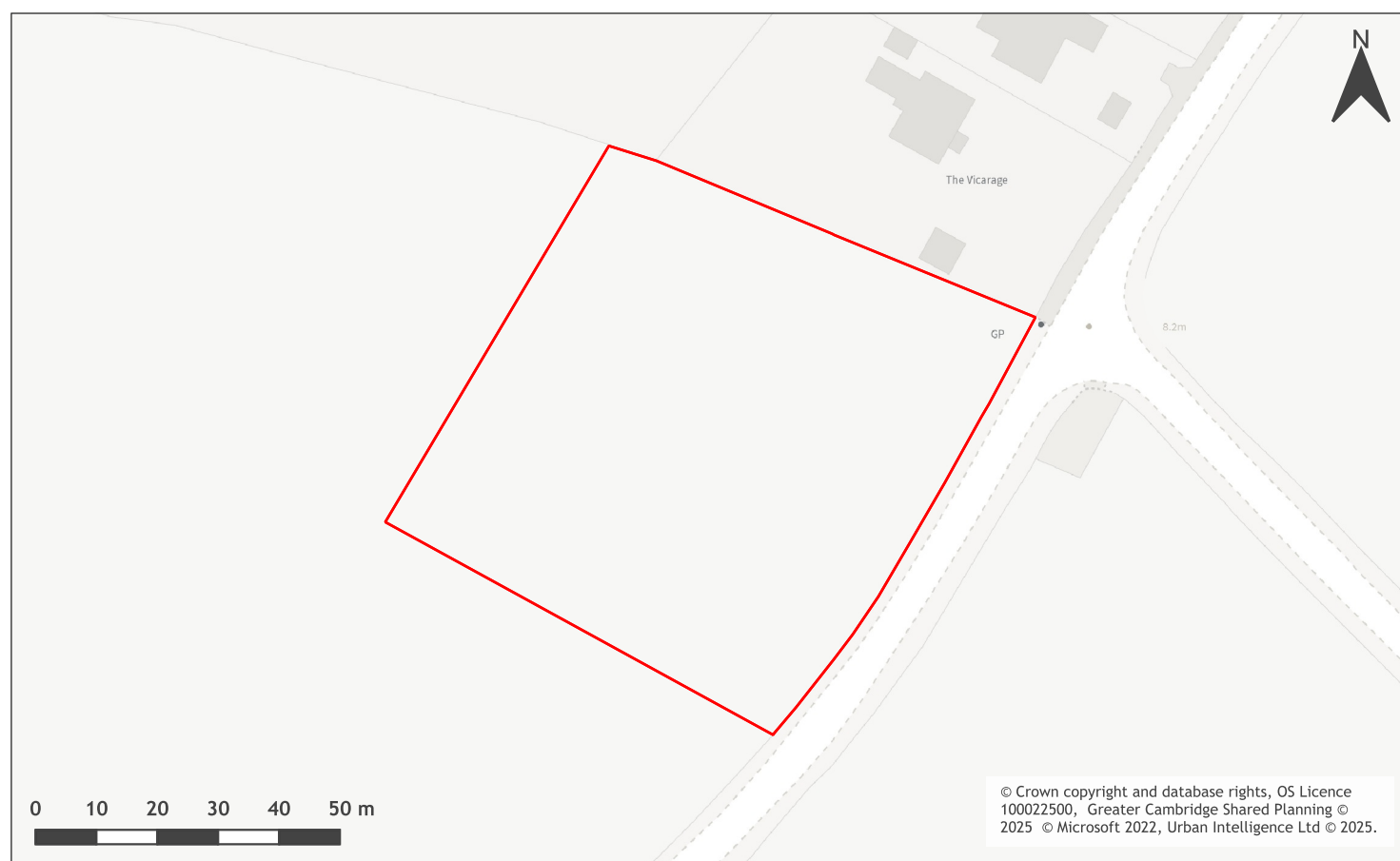
A map of Land west side of Honey Hill, Fen Drayton