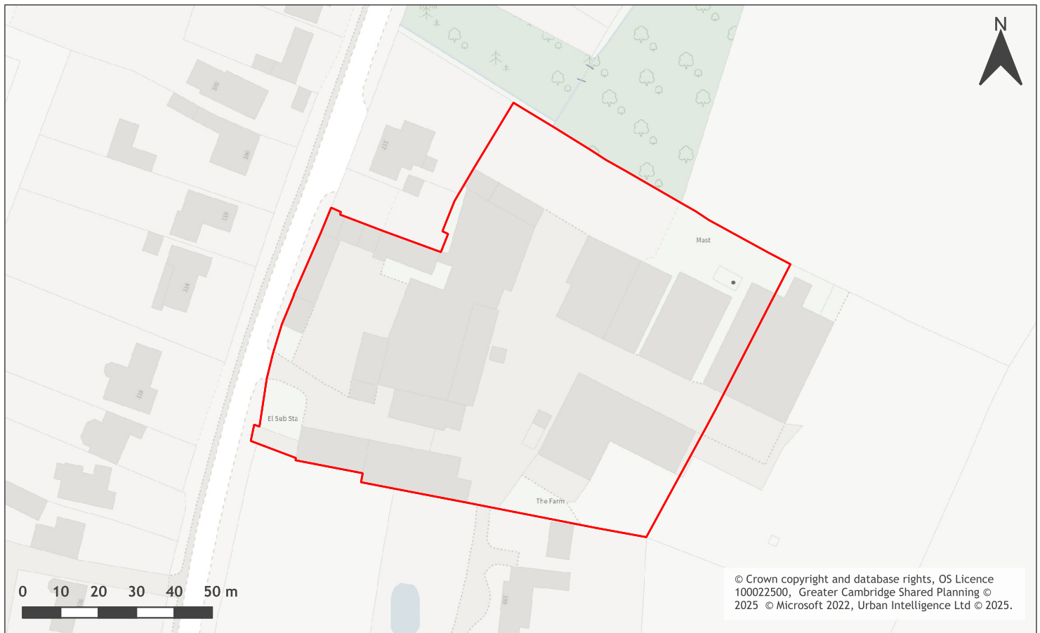
A map of 139 Boxworth End Farm, Swavesey