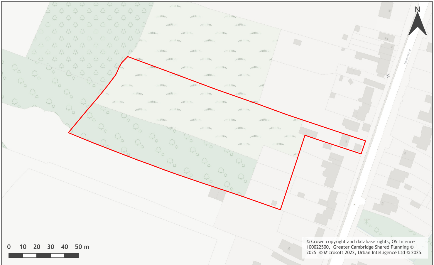
A map of Land at 86 Boxworth End, Swavesey