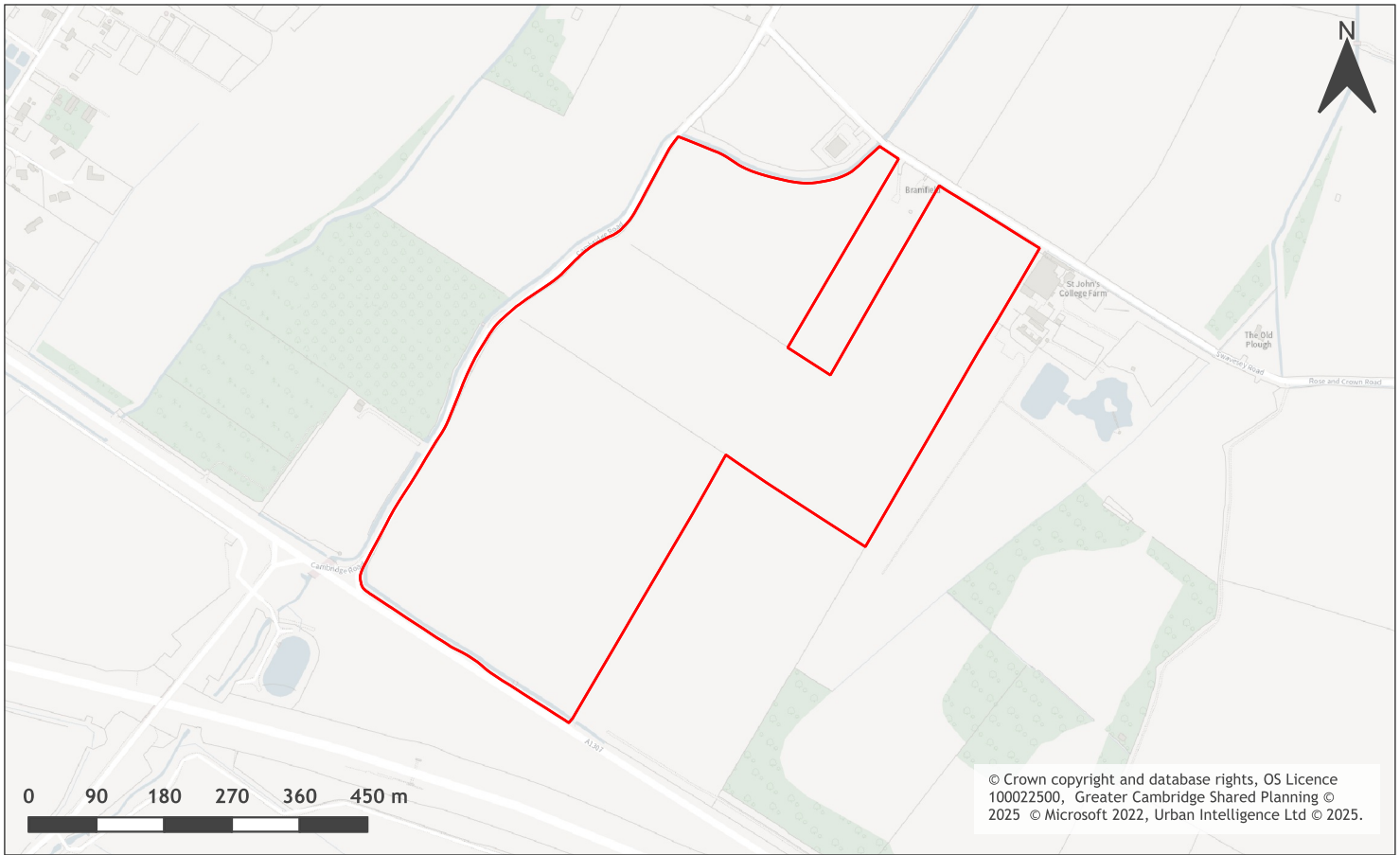
A map of Land east of Cambridge Road, Fen Drayton