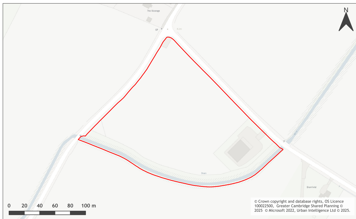
A map of Land at Swavesey Road, Fen Drayton