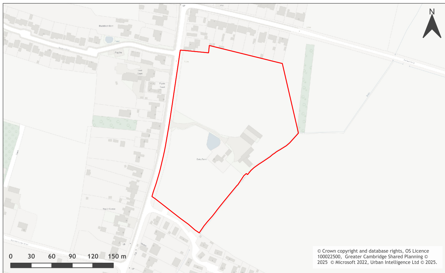
A map of Land at Dairy Farm (Site 1), Boxworth End, Swavesey