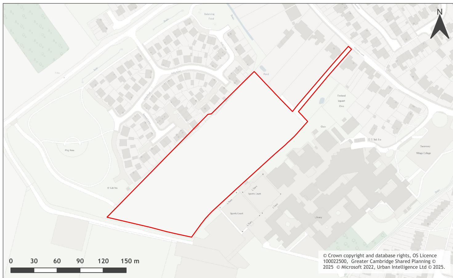
A map of Land south of Fen Drayton Road, north of Swavesey Village College, Swavesey