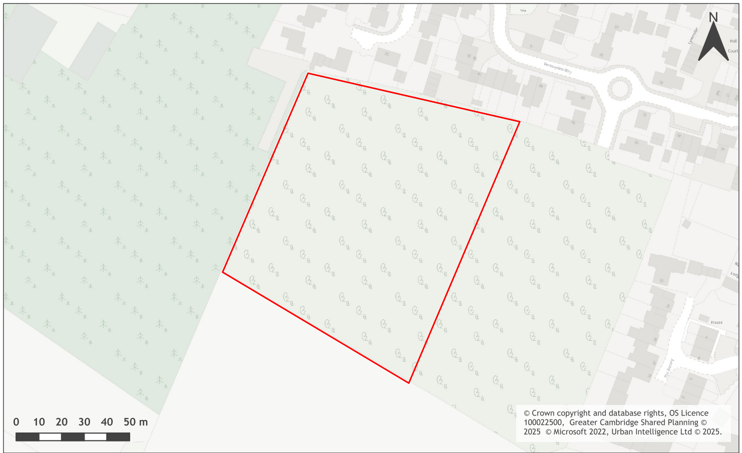
A map of Land south of Vermuyden Way, Fen Drayton