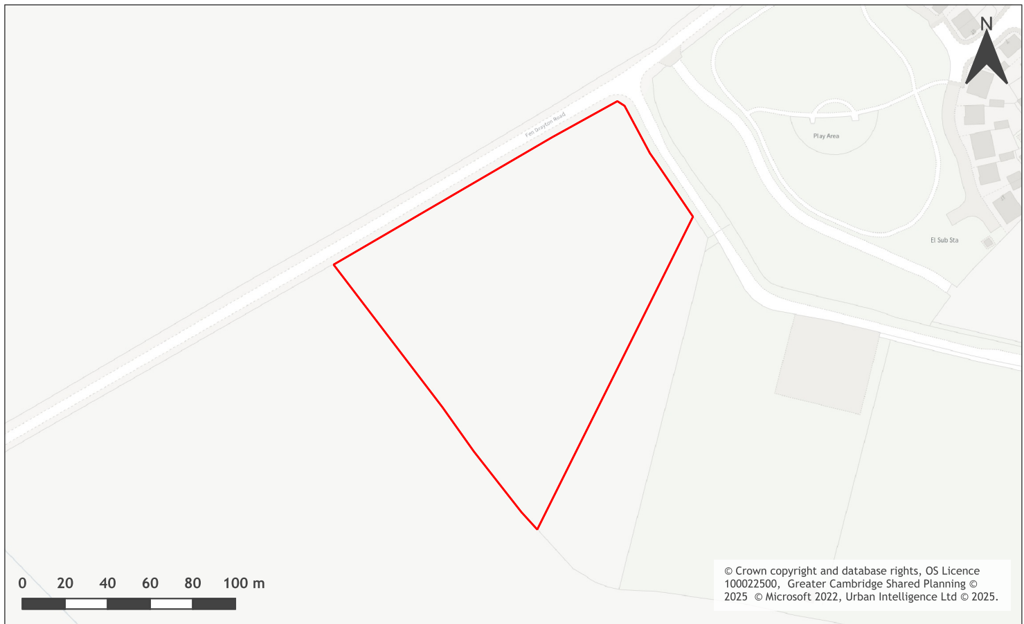
A map of Land on the south east side of Fen Drayton Road, Swavesey