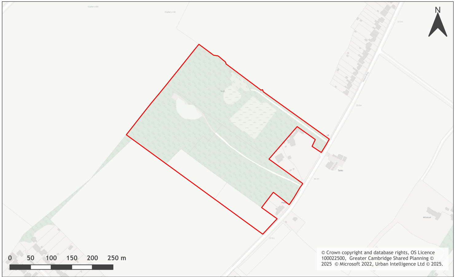
A map of Land at Whitefields, Hinton Way, Great Shelford