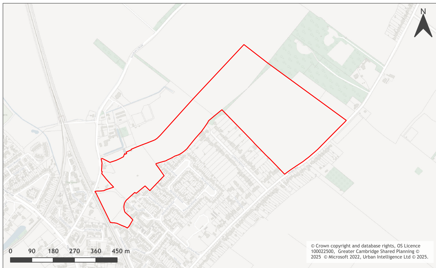
A map of Land south of Granhams Farm, Great Shelford