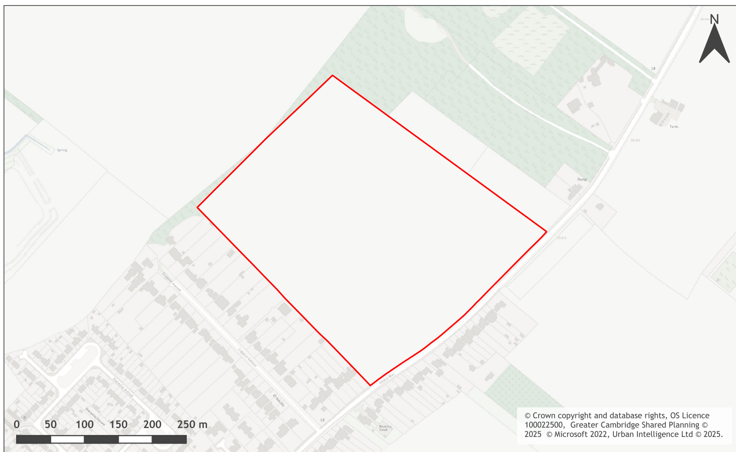
A map of Land west of Hinton Way, Great Shelford