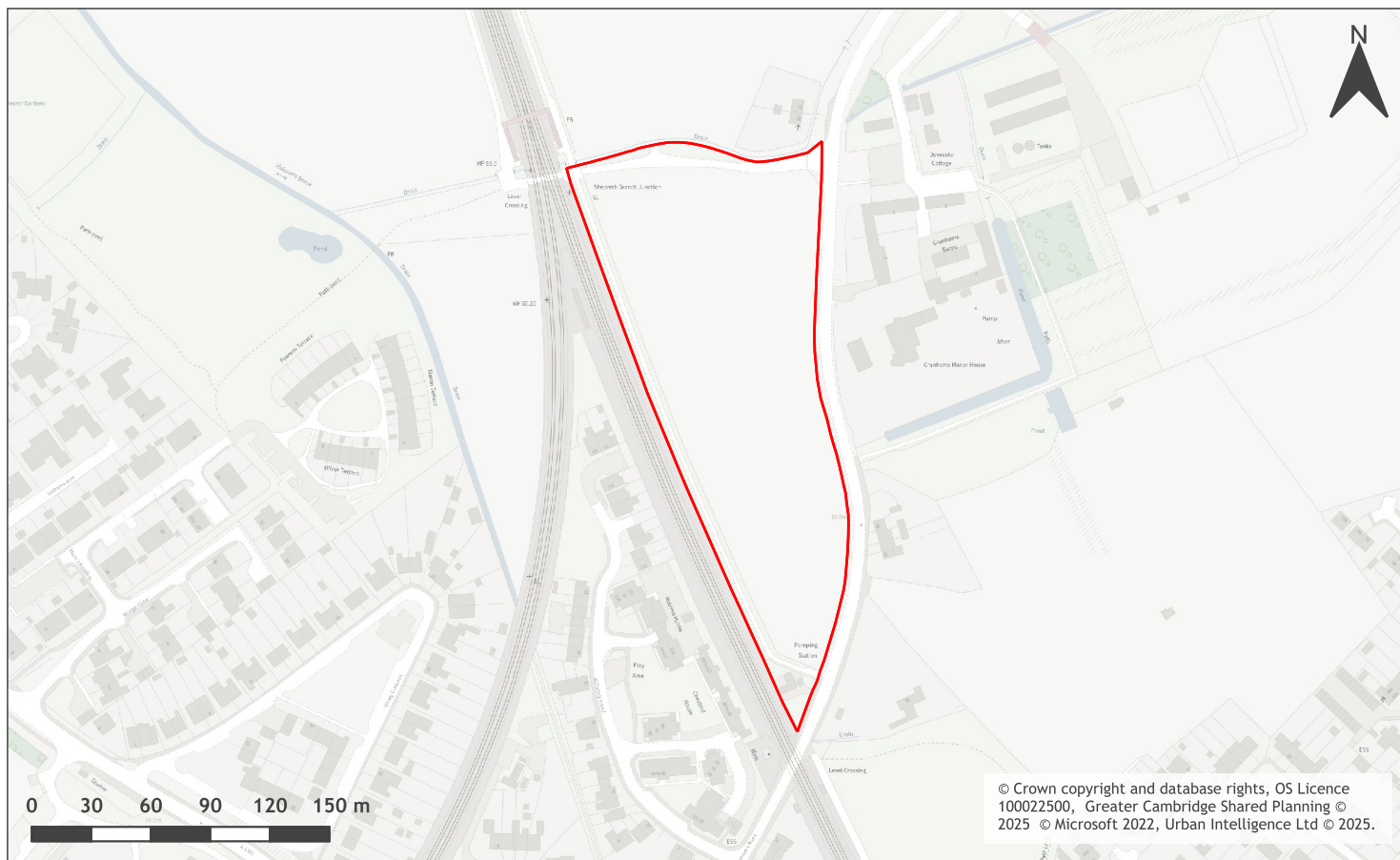
A map of Land west of Granhams Farm, Great Shelford