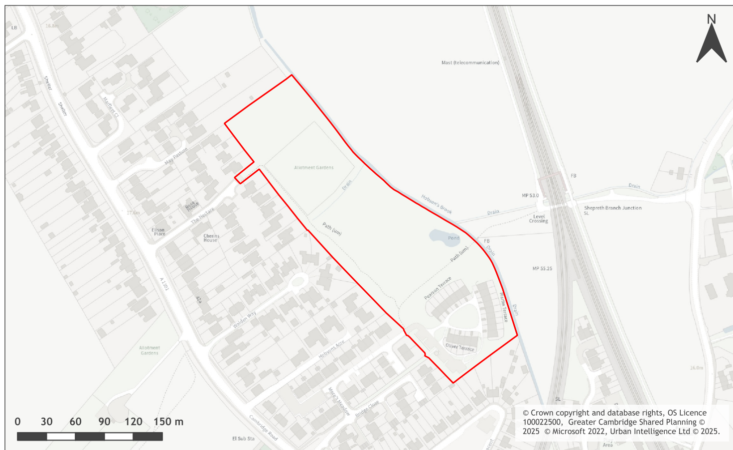
A map of Land Northeast of More's Meadow, Great Shelford