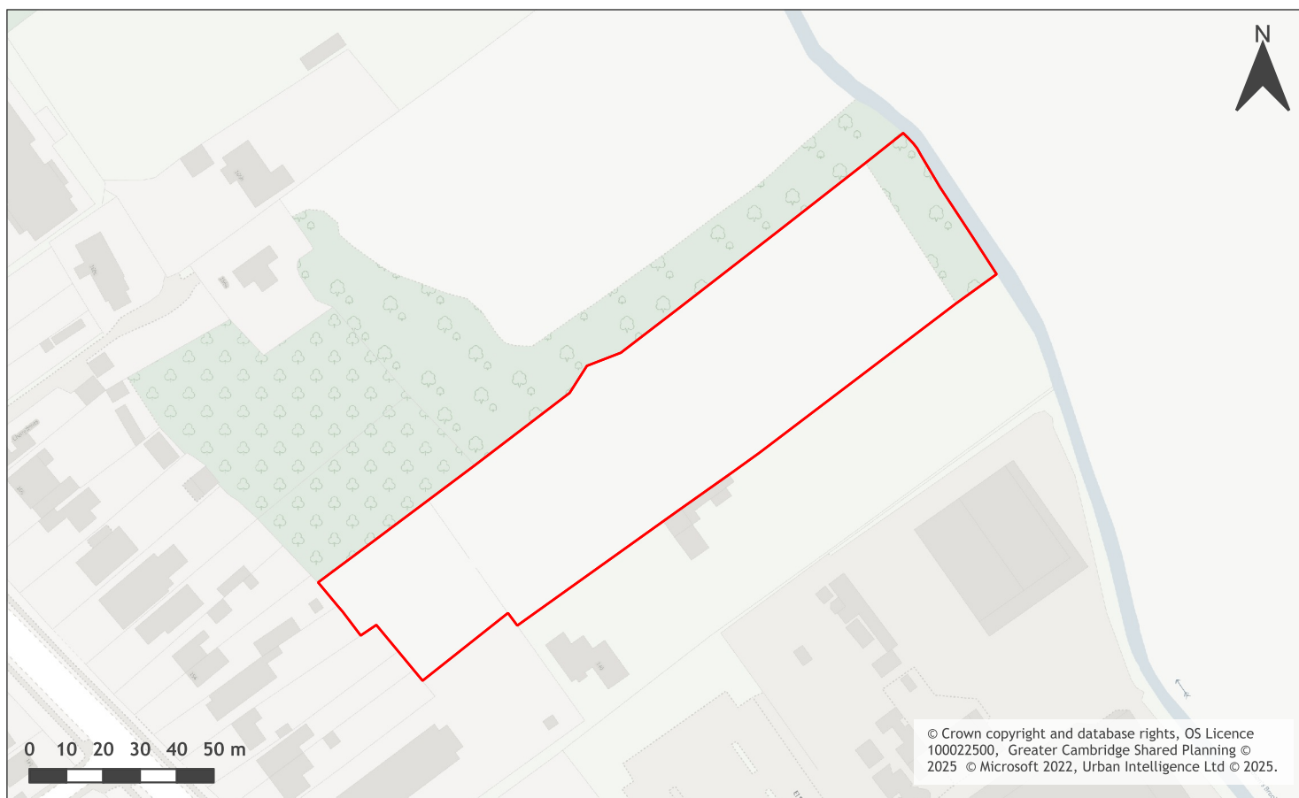
A map of 144 Cambridge Road, Great Shelford