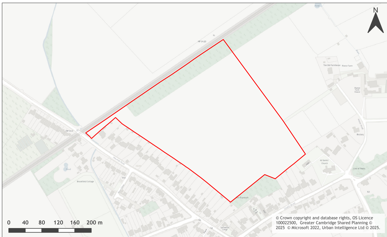
A map of Land north of Church Street, Little Shelford