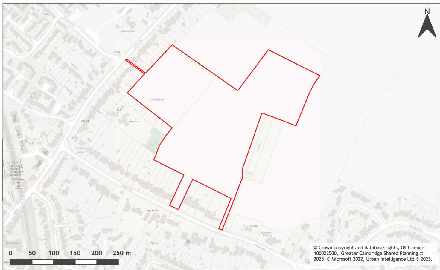
A map of Land between Hinton Way and Mingle Lane, Great Shelford CB22 5BG