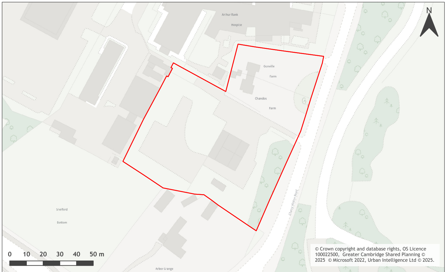
A map of Land at Chandos Farm, Cherry Hinton Road, Shelford Bottom