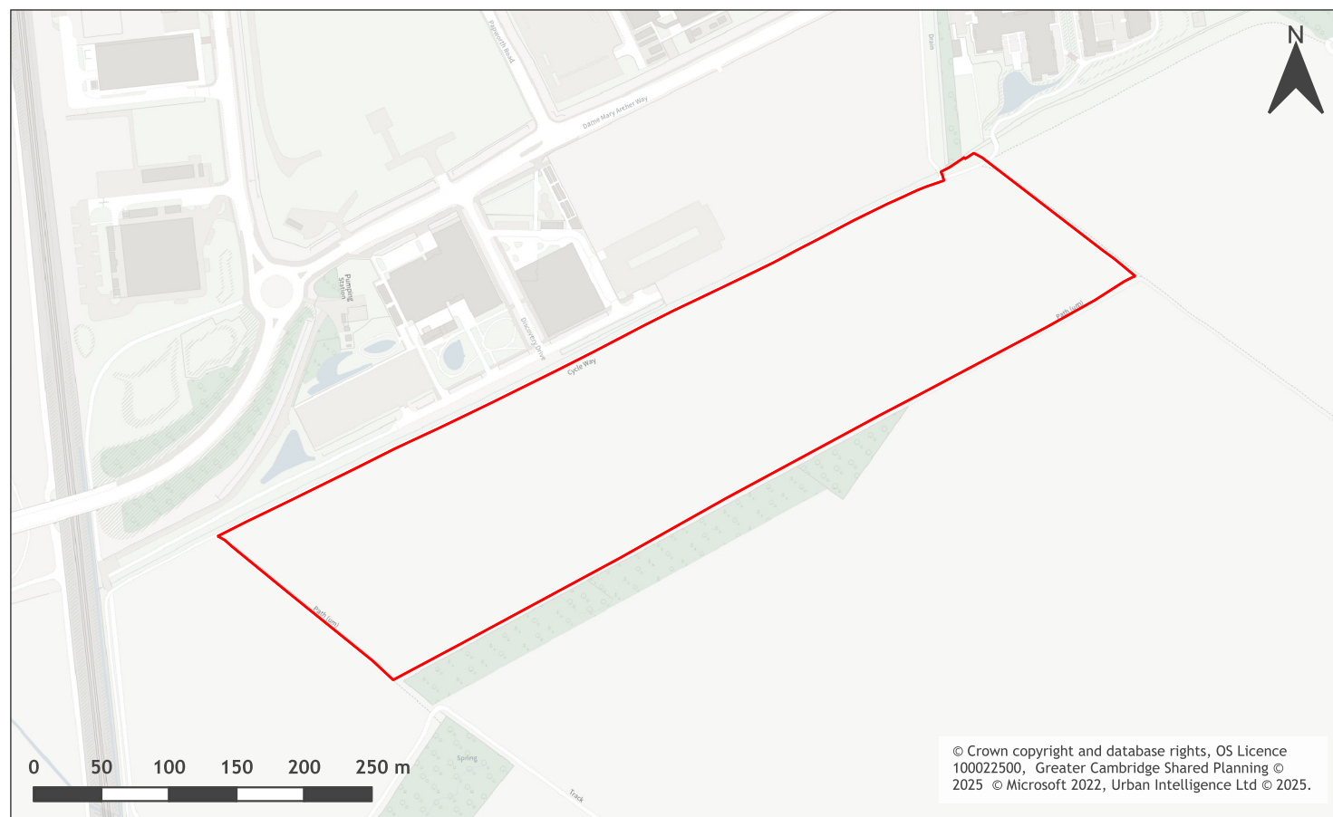
A map of Cambridge Biomedical Campus extension (Policy E/2)