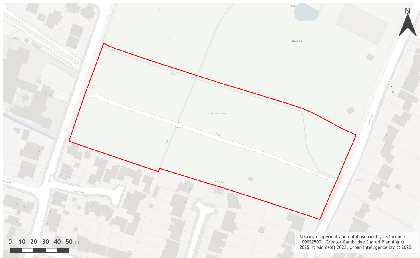
A map of Land to the east of Haverhill Road, Stapleford