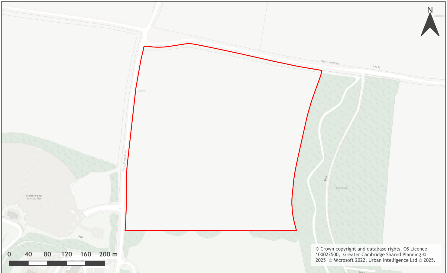
A map of Land east of Cherry Hinton Road and south of Worts Causeway, Cambridge