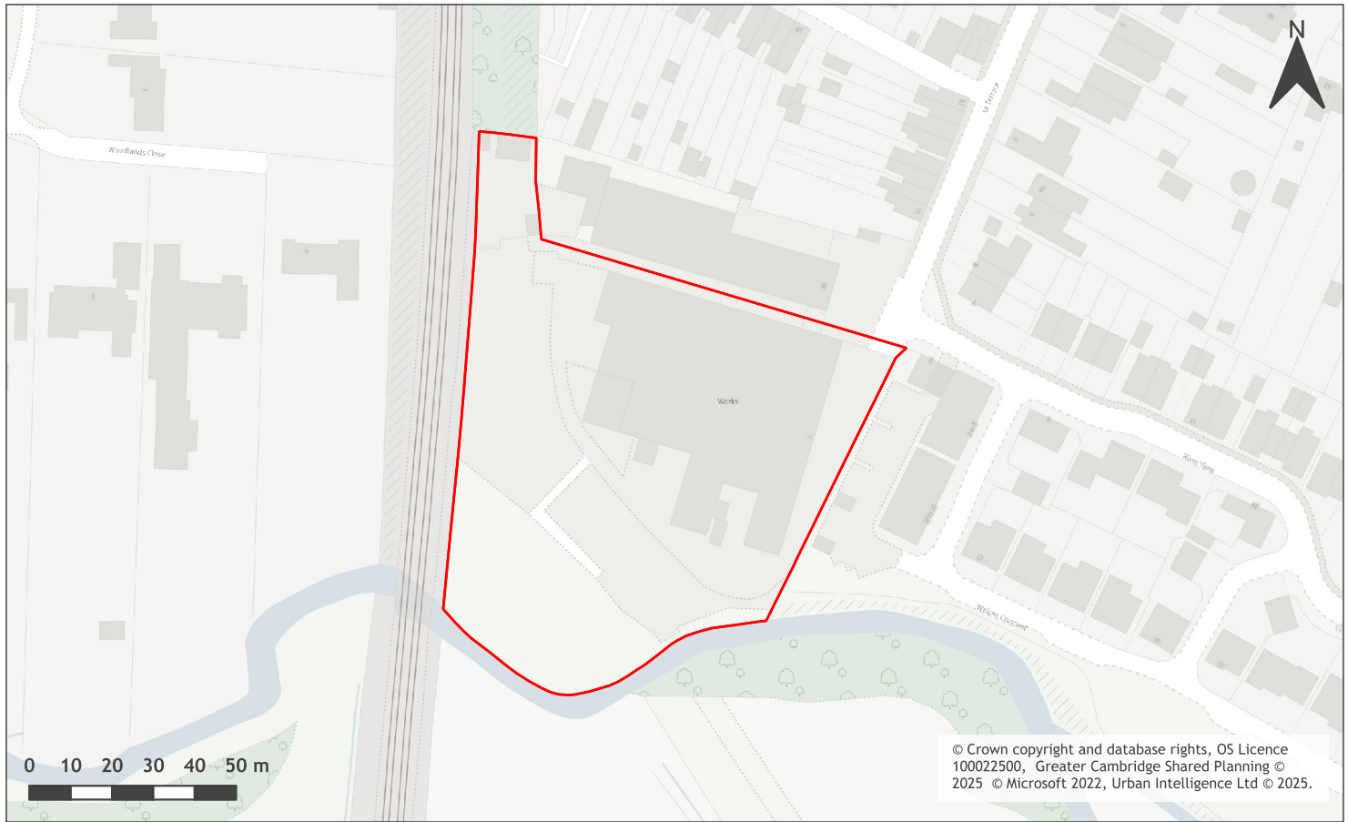
A map of Wedd Joinery, Granta Terrace, Stapleford