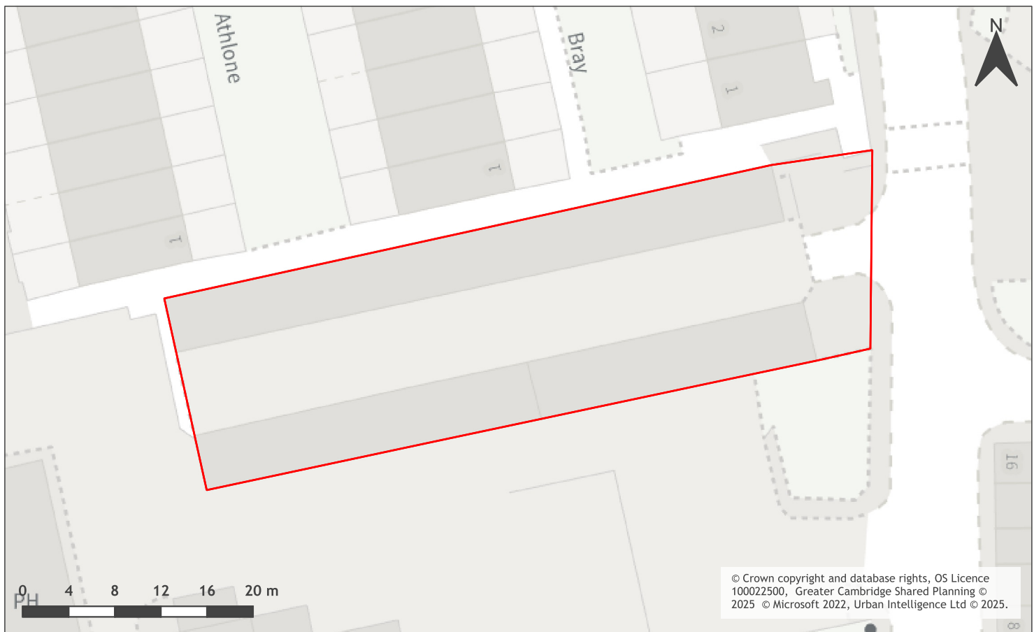
A map of Garages between 20 St. Matthews Street and the Blue Moon Public House, Cambridge