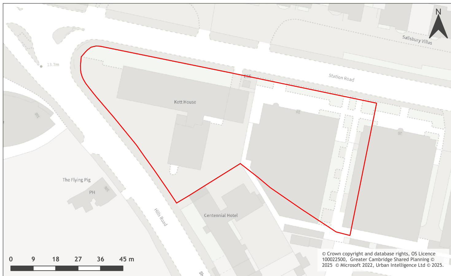
A map of Kett House and 10 Station Road, Cambridge