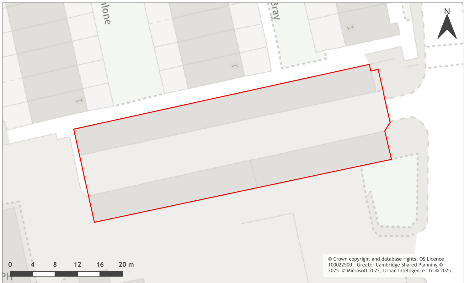
A map of Garages between 20 St. Matthews Street and Blue Moon Public House, Cambridge