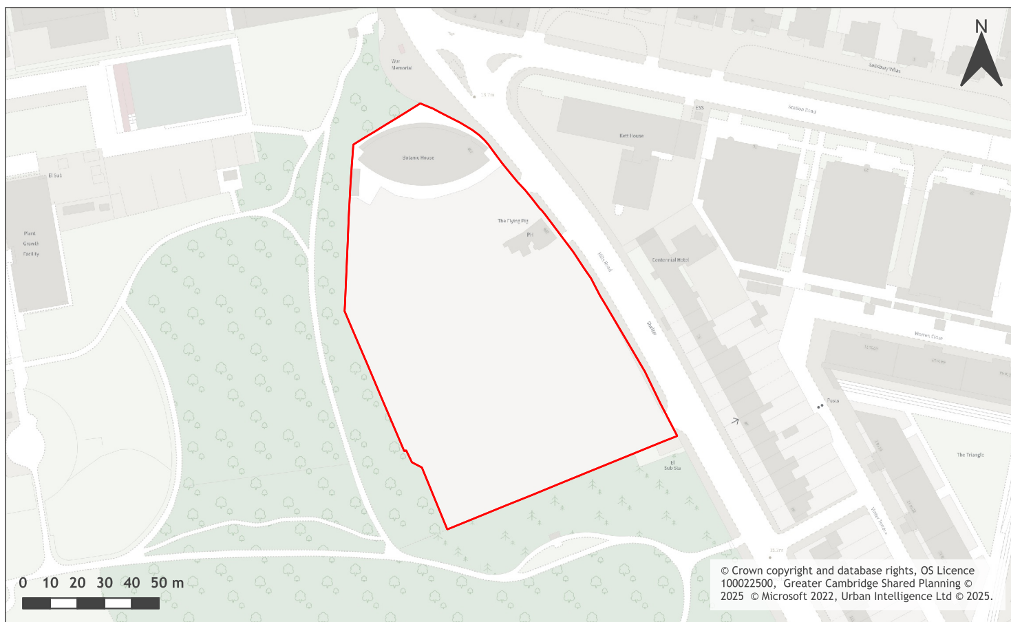
A map of 100-112 Hills Road, Cambridge