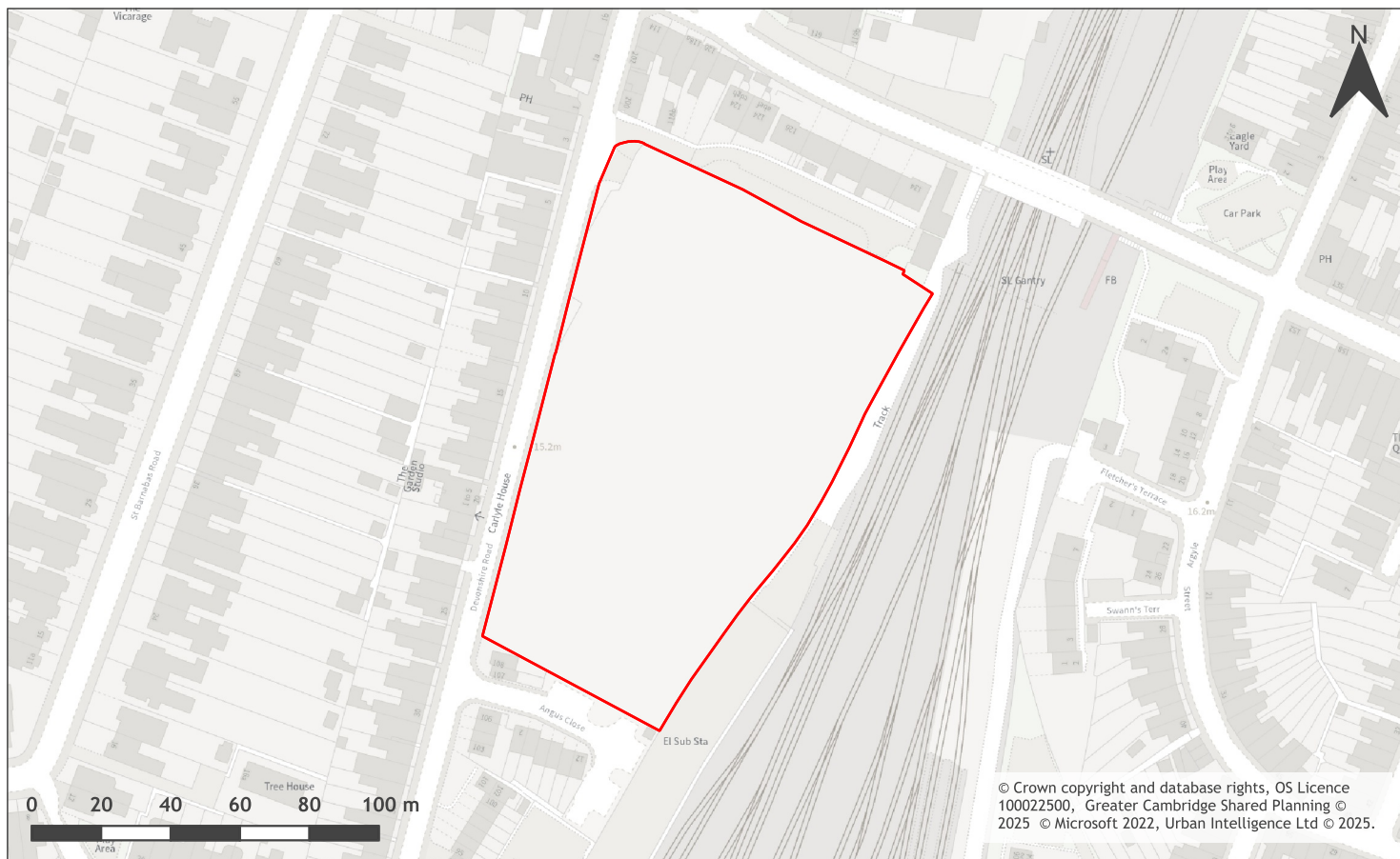
A map of Travis Perkins, Devonshire Road (Policy 27 - R9)