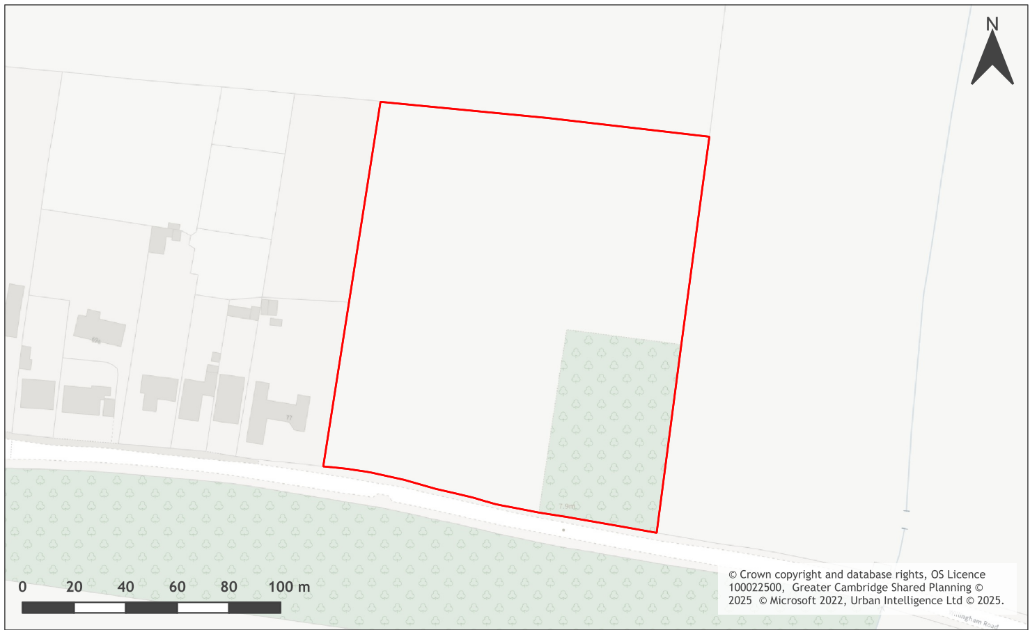
A map of Land on the north side of Willingham Road, Over