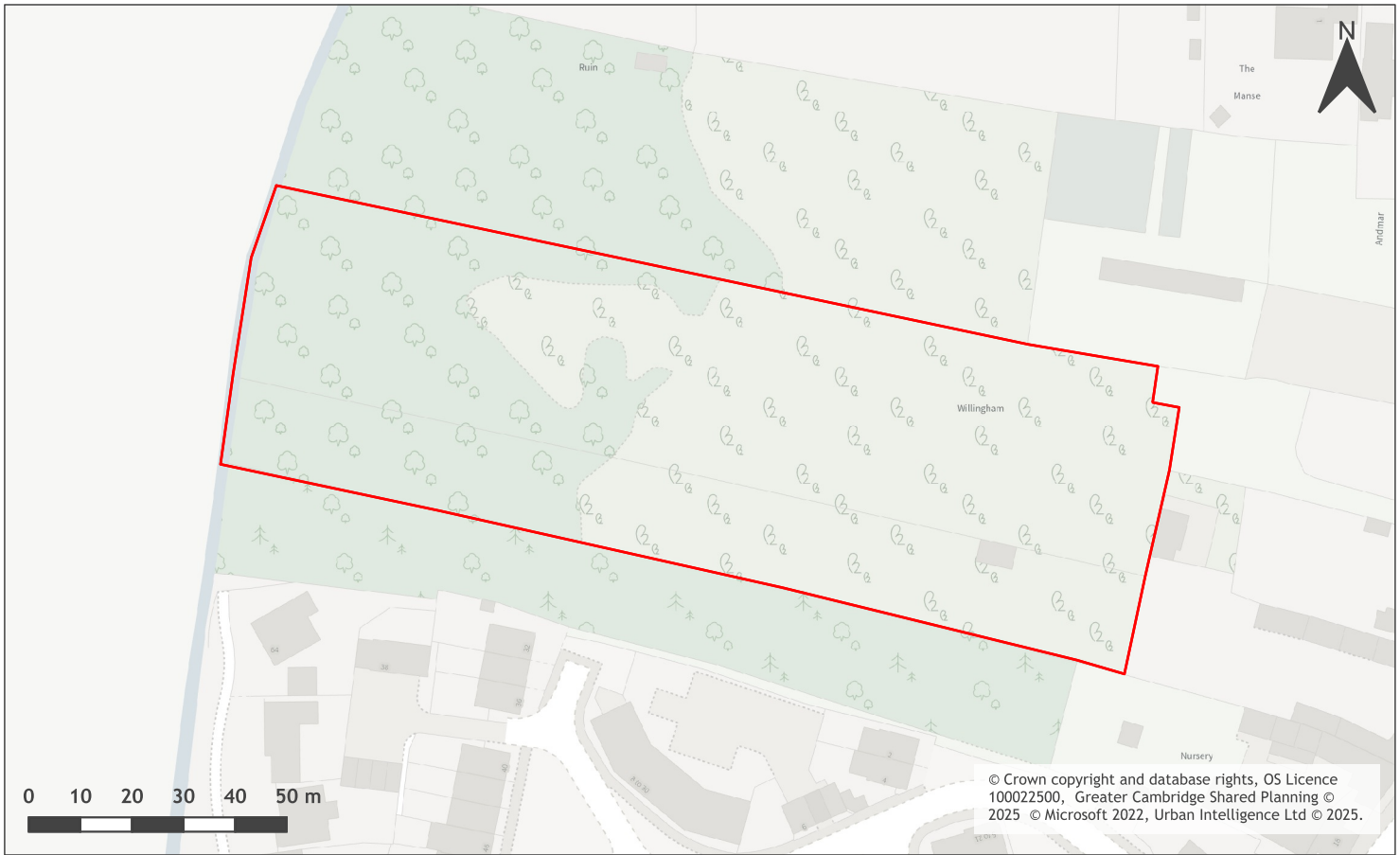
A map of Land to the West of High Street, Willingham