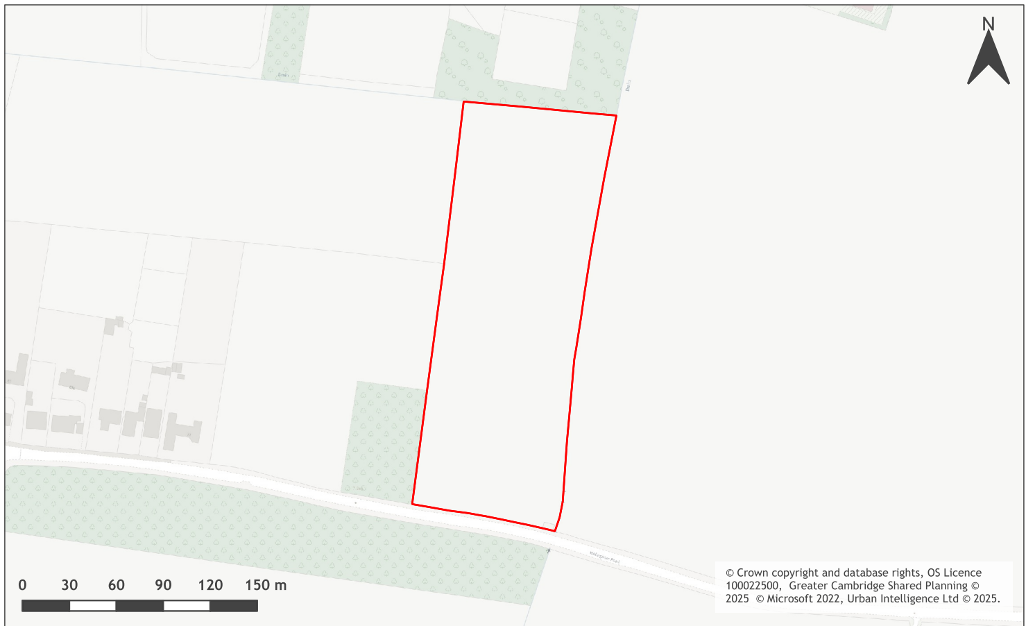
A map of Willingham Road, Over