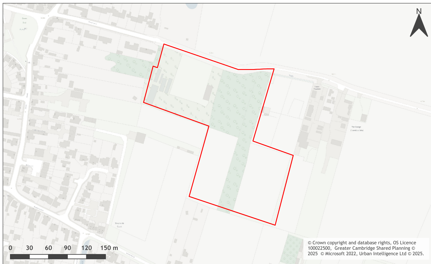
A map of Land south of Priest Lane, Willingham