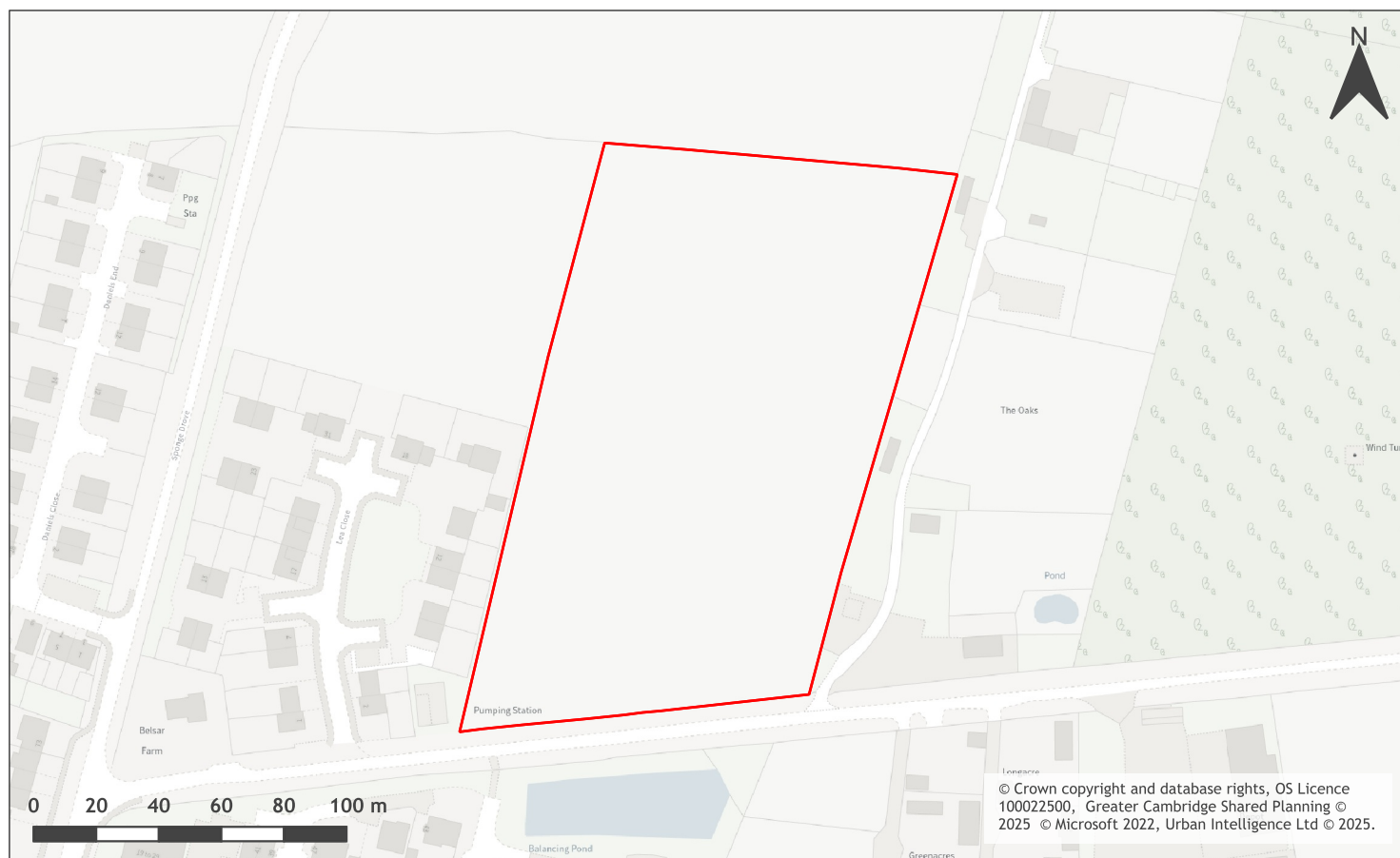
A map of Land to the north of Meadow Road, Willingham