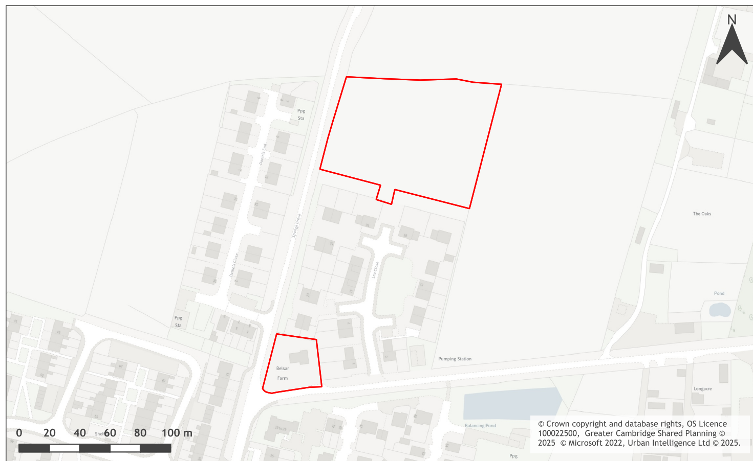
A map of Land at Belsar Farm, Sponge Drove, Willingham