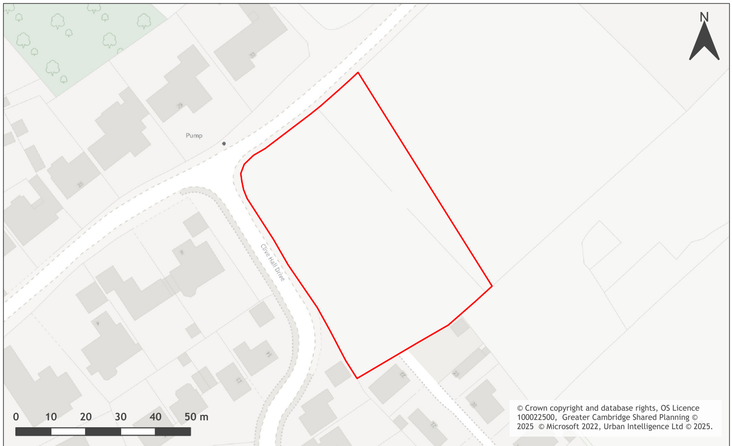
A map of Clive Hall Drive, Longstanton