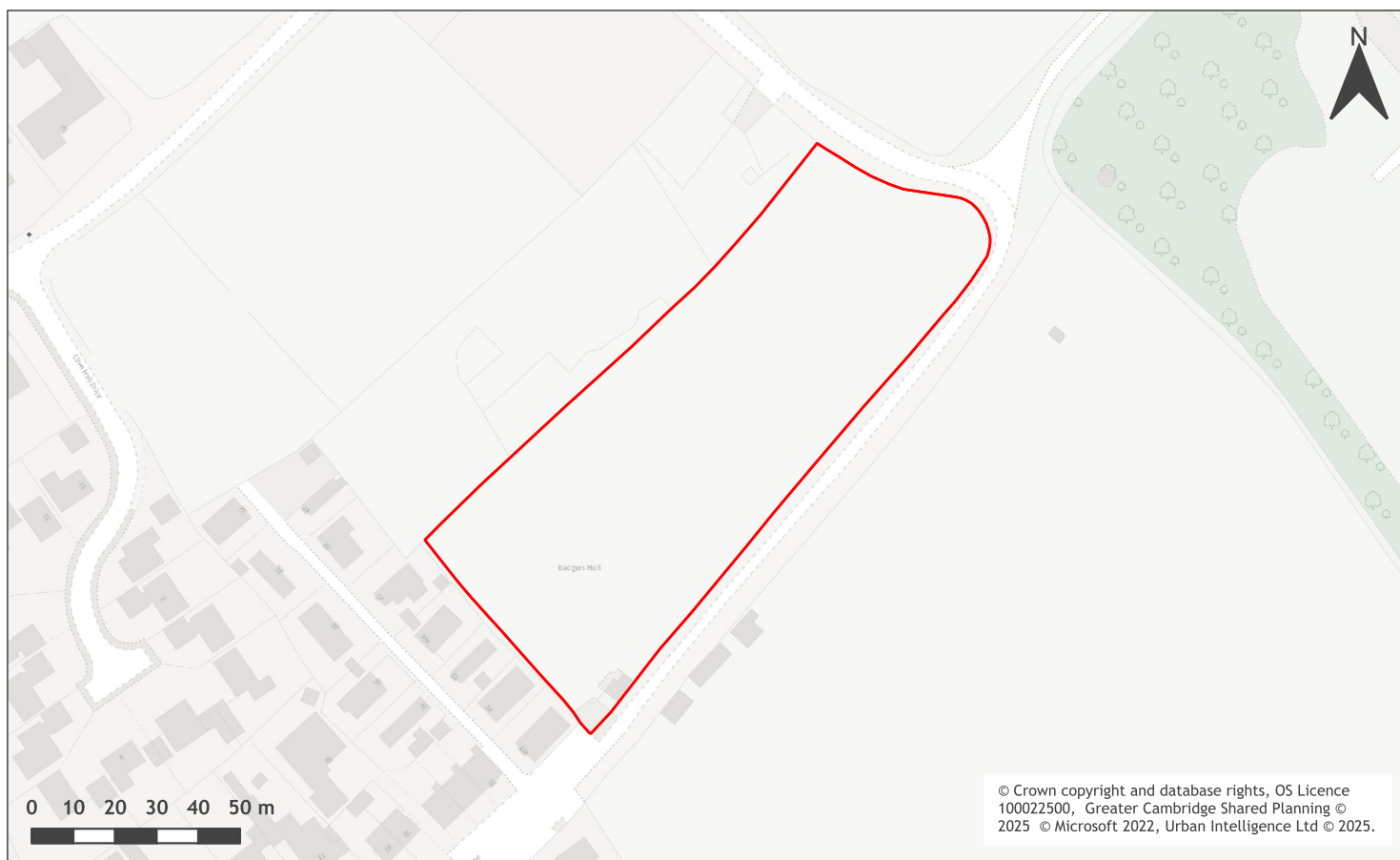
A map of St Michaels Lane, Longstanton