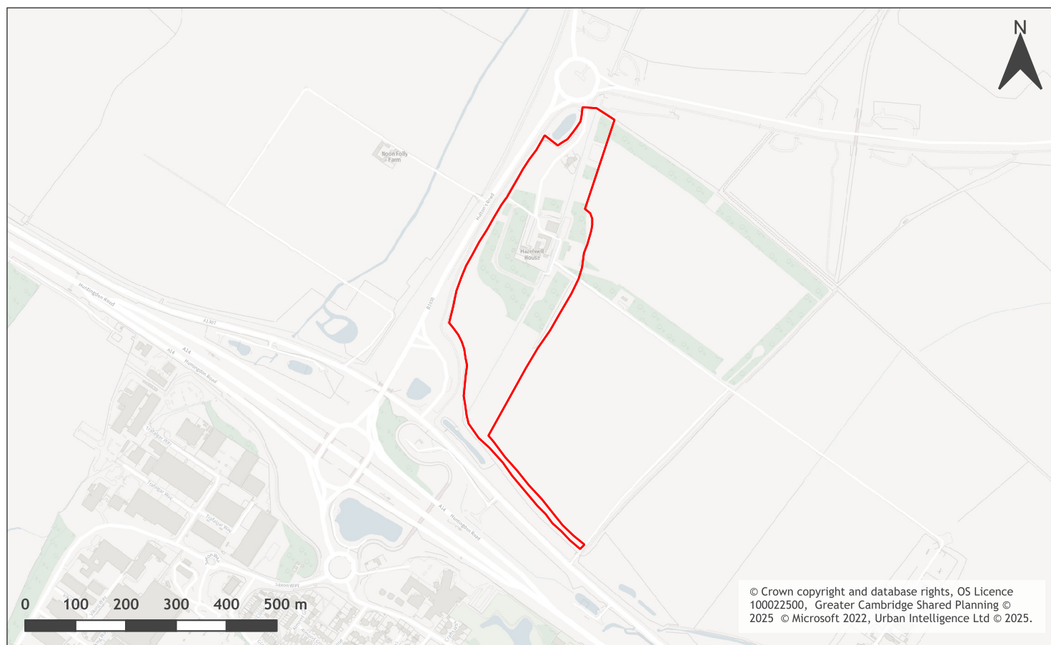
A map of Land at Hazlewell Farm, Lolworth