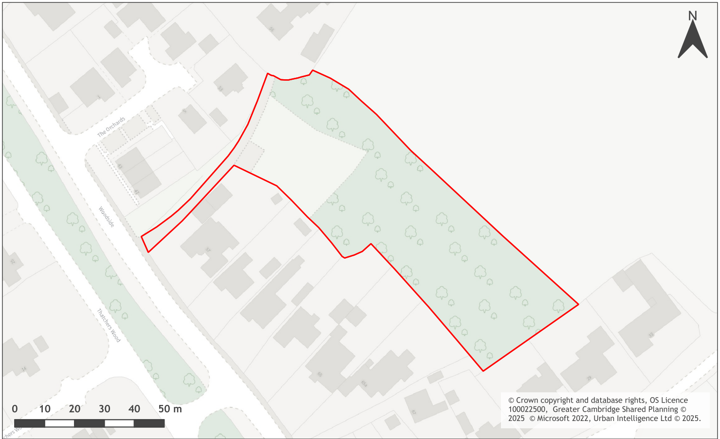
A map of Land north east of Woodside, Longstanton