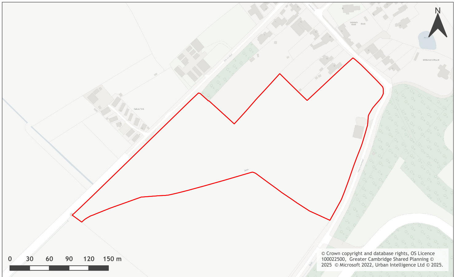
A map of Land to the south west of St Michaels, Longstanton