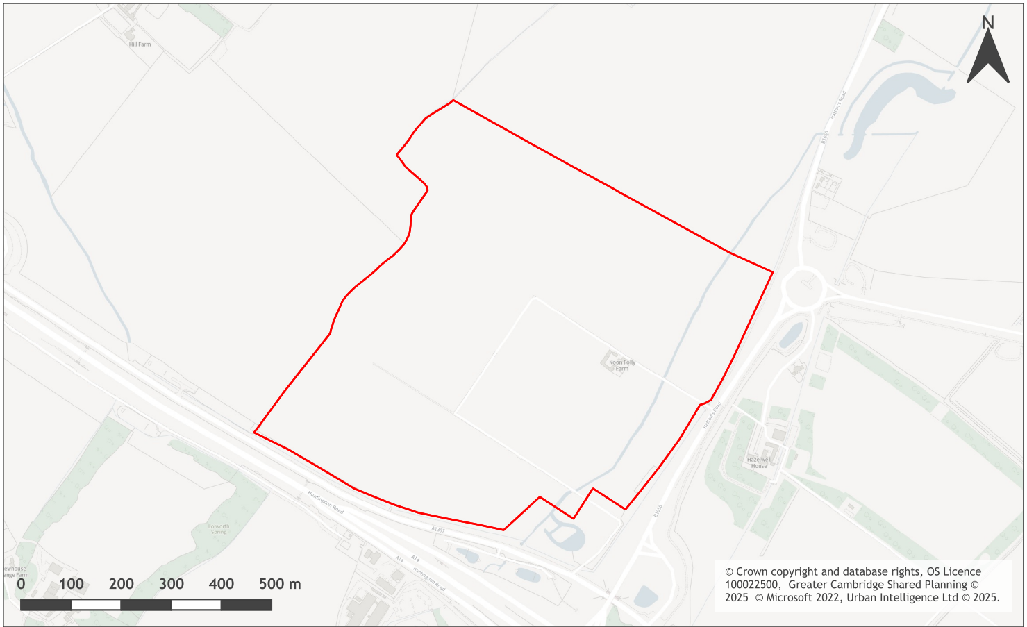
A map of Land north of A14, Bar Hill