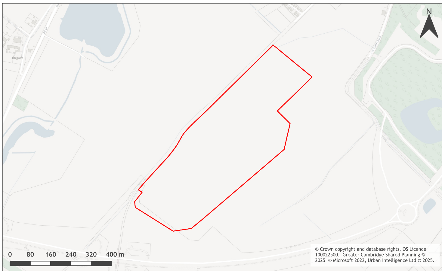
A map of Land to the east of Wilson's Lane, Longstanton