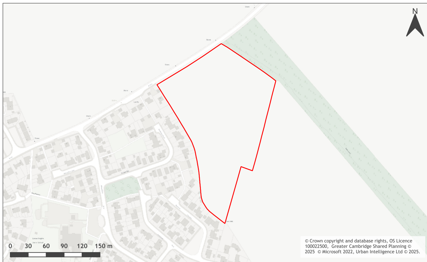
A map of Land off Balsham Road, Linton