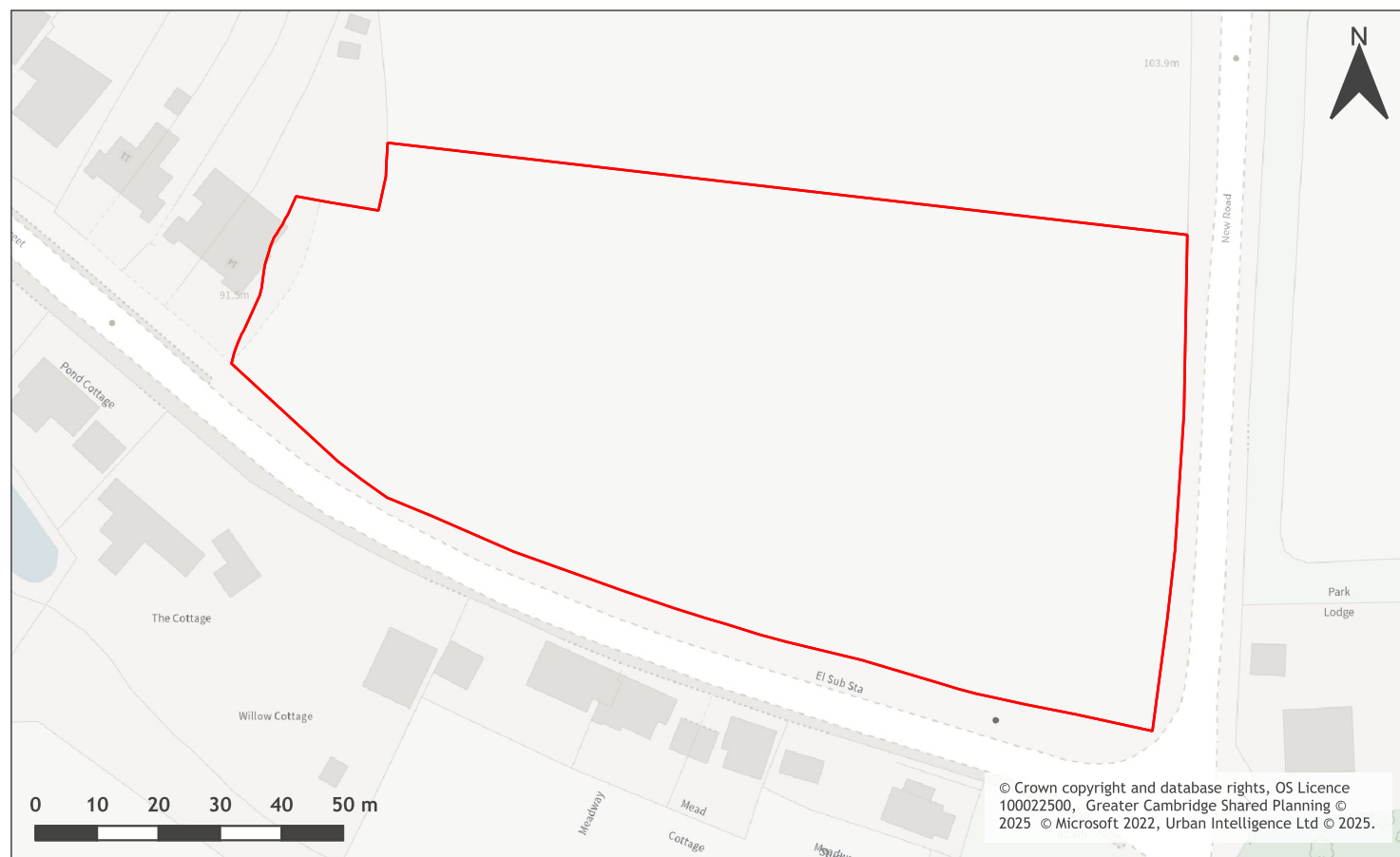
A map of Land to the north of Main Street, Shudy Camps