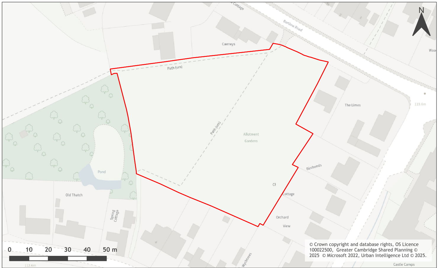
A map of Land south of Bartlow Rd, Castle Camps