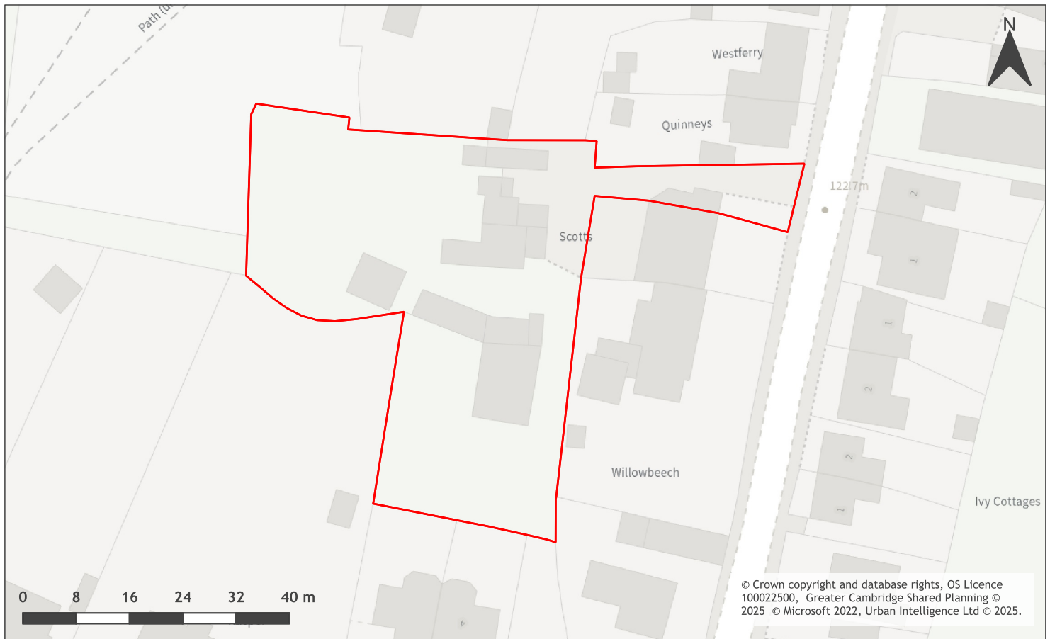
A map of Scotts, High Street, Castle Camps