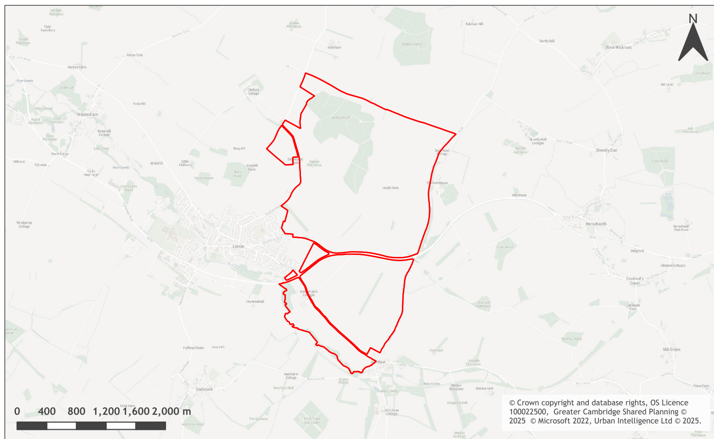
A map of Land to the east of Linton