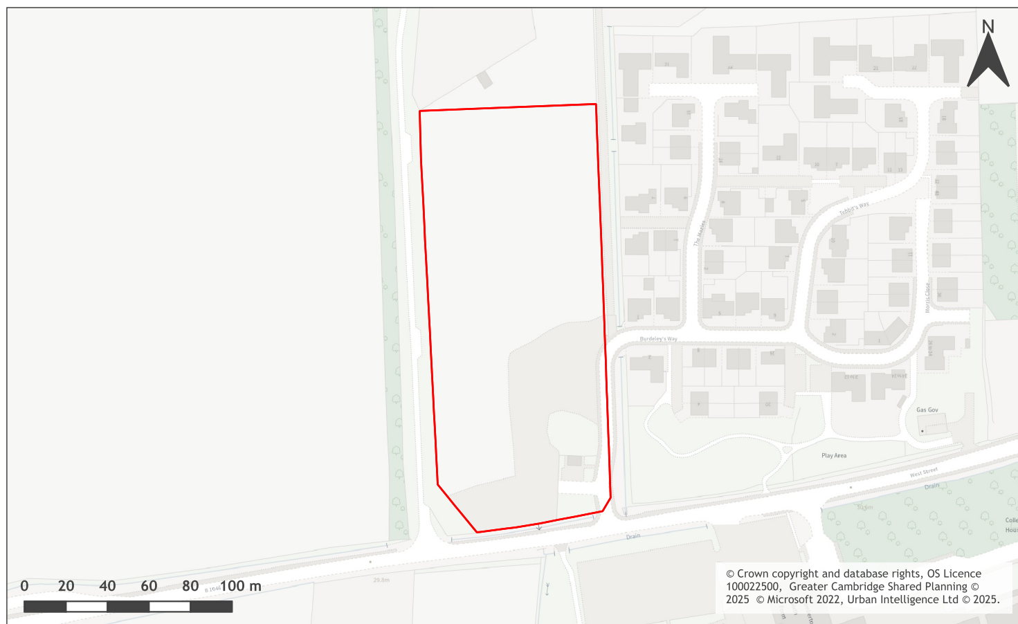
A map of Land at Bennell Farm (west), West Street, Comberton