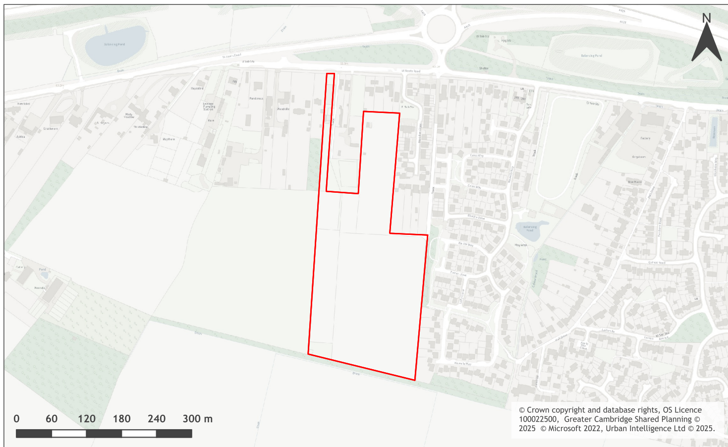
A map of Land west of Howells Way, Old St Neots Road, Hardwick