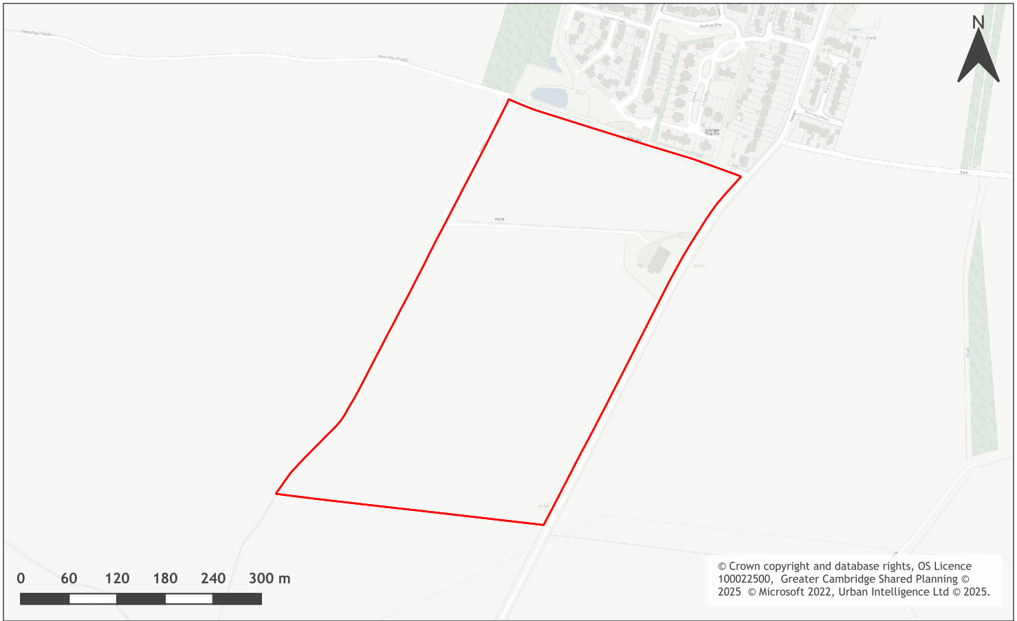
A map of Land at Toft Road, Hardwick