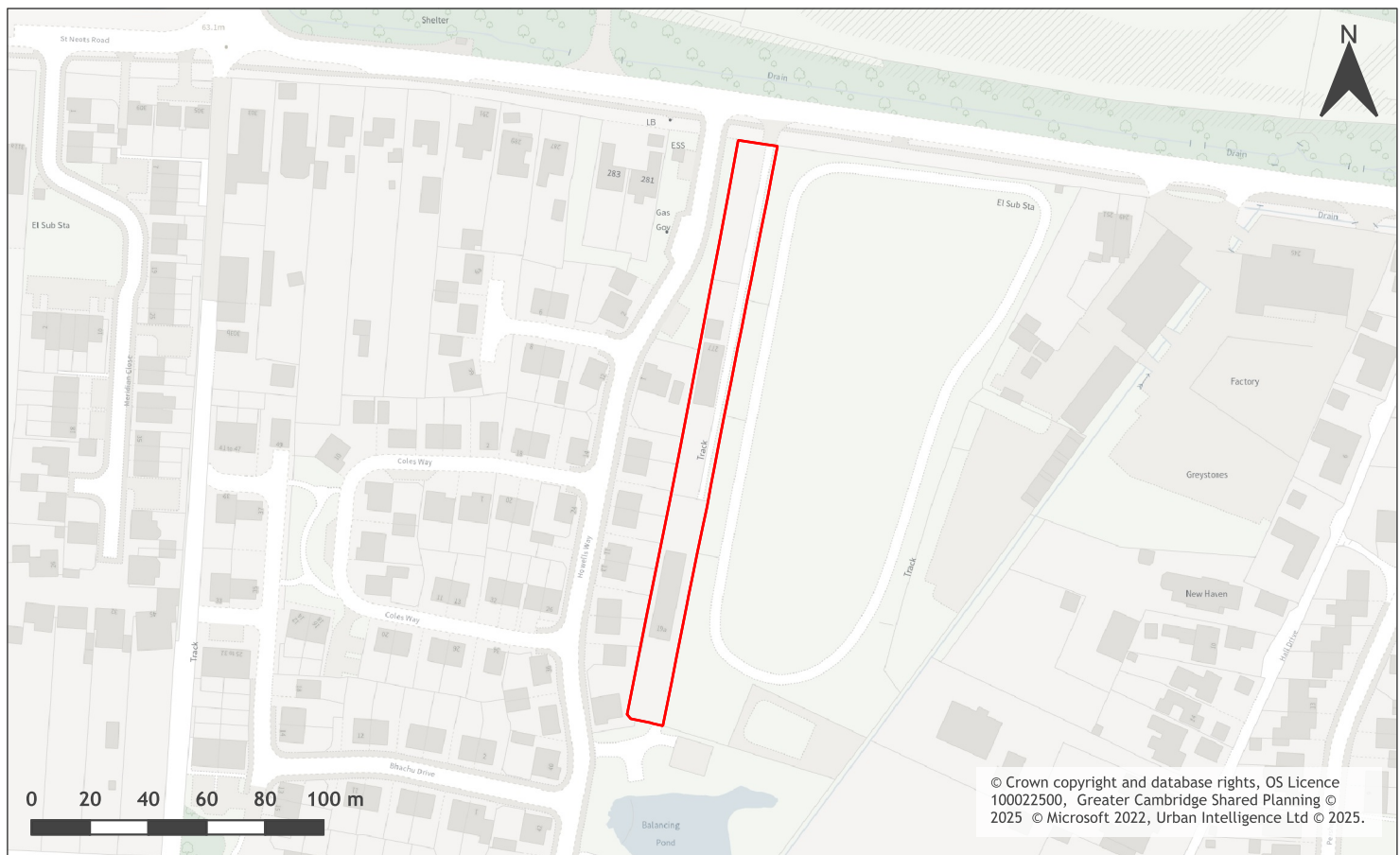
A map of 277 St Neots Road, Hardwick