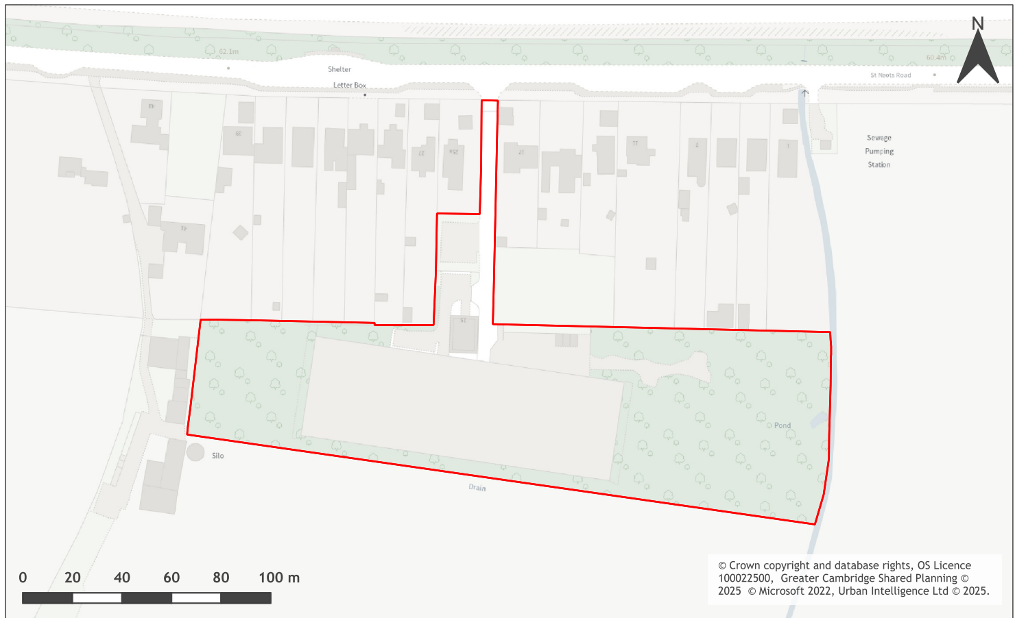
A map of 25 St Neots Road, Hardwick