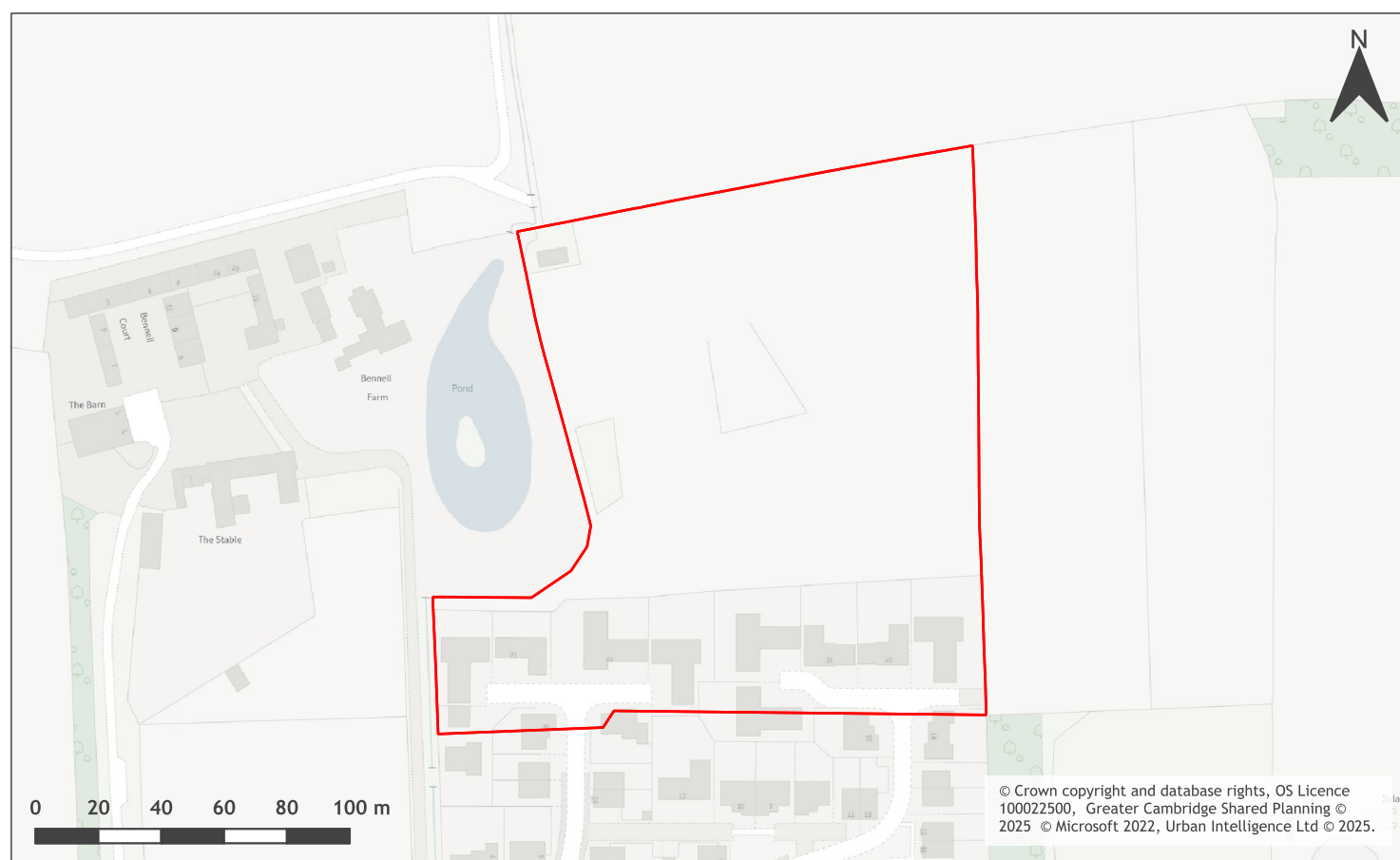
A map of Land at Bennell Farm (north), West Street, Comberton