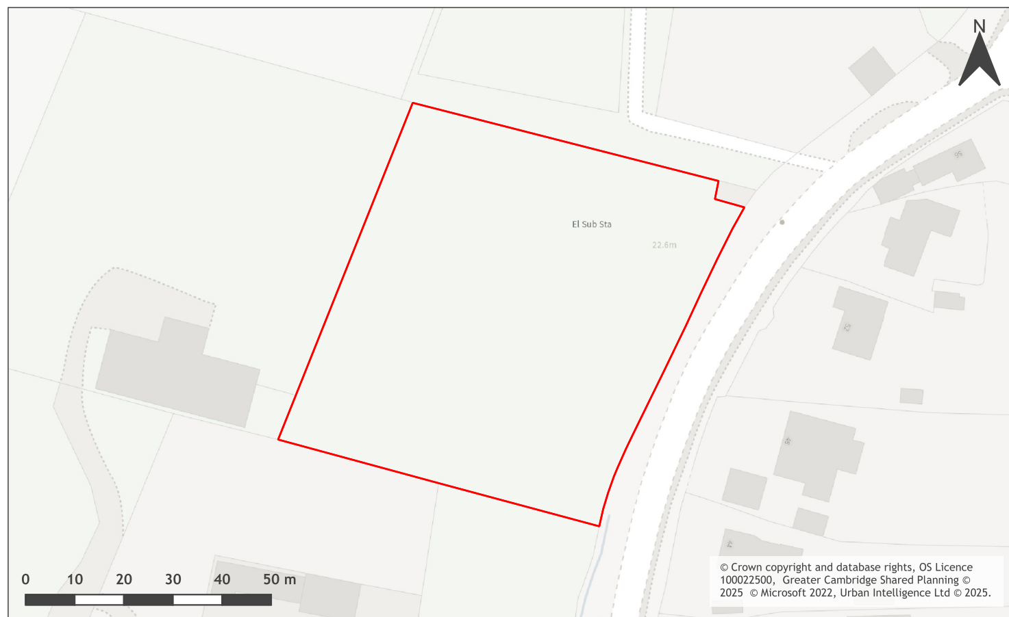
A map of Land west of Church Street, Haslingfield