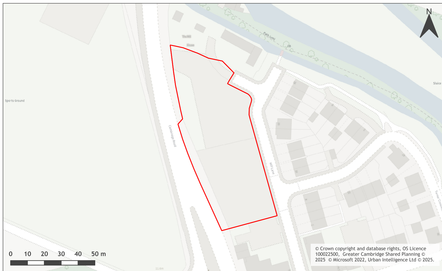
A map of Bayer CropScience Site, Hauxton