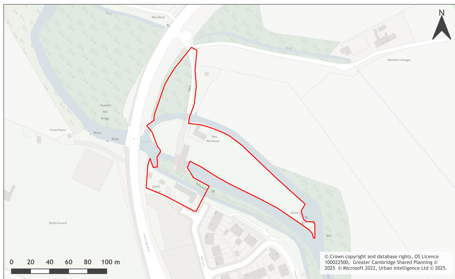
A map of Hauxton House, o2h SciTech Park, Cambridge