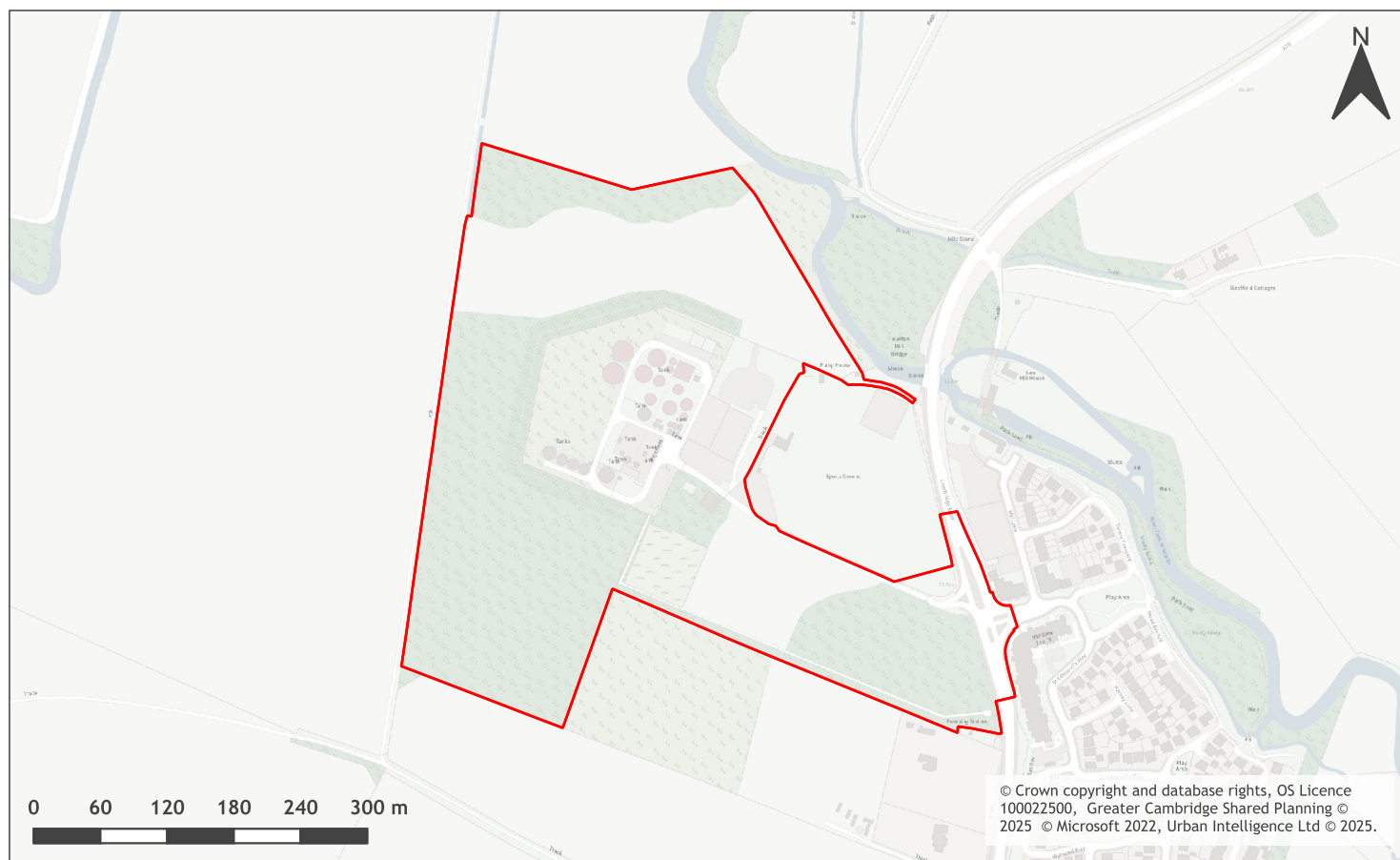
A map of Former WWTW Hauxton