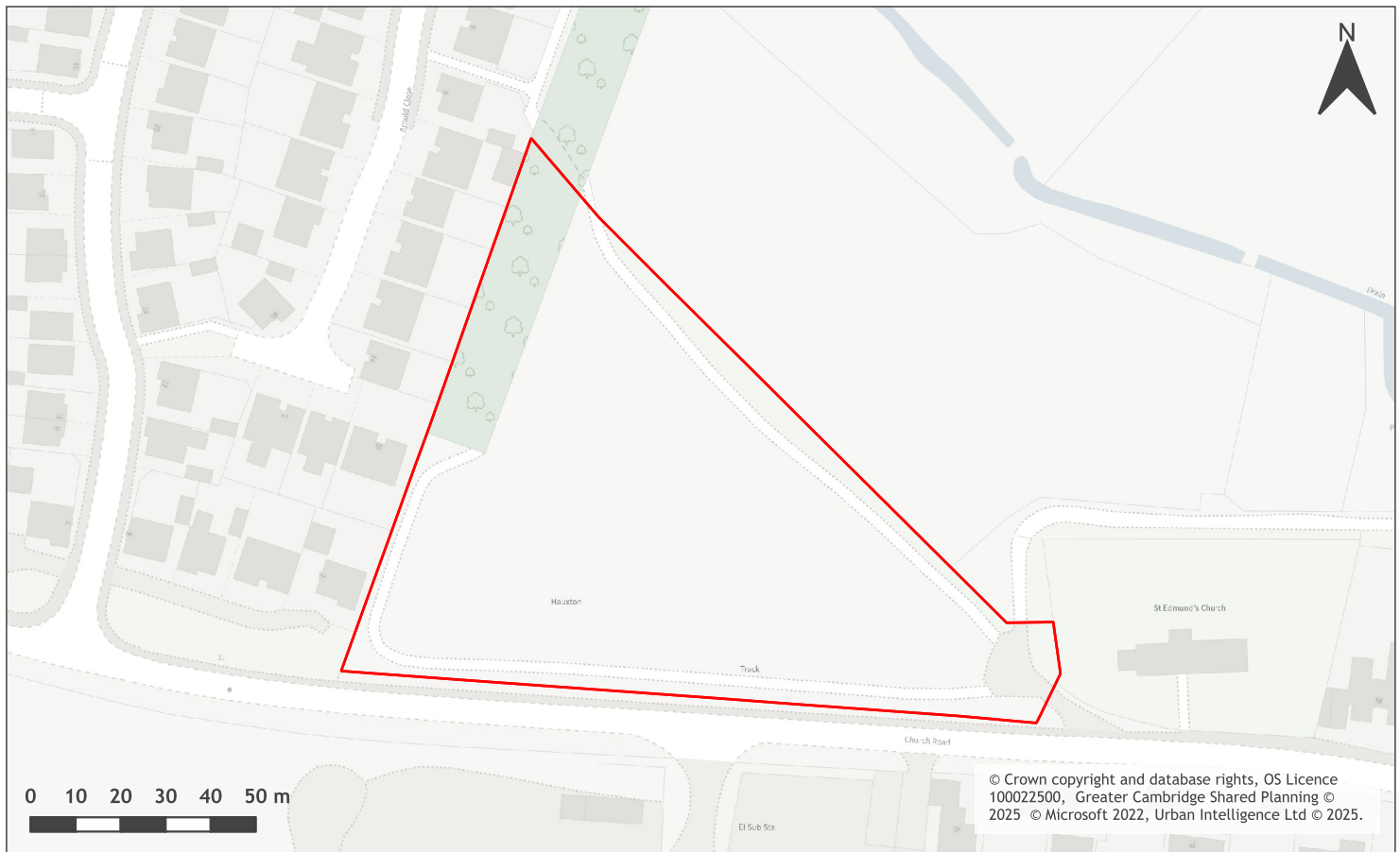
A map of Land north of Church Road, Hauxton