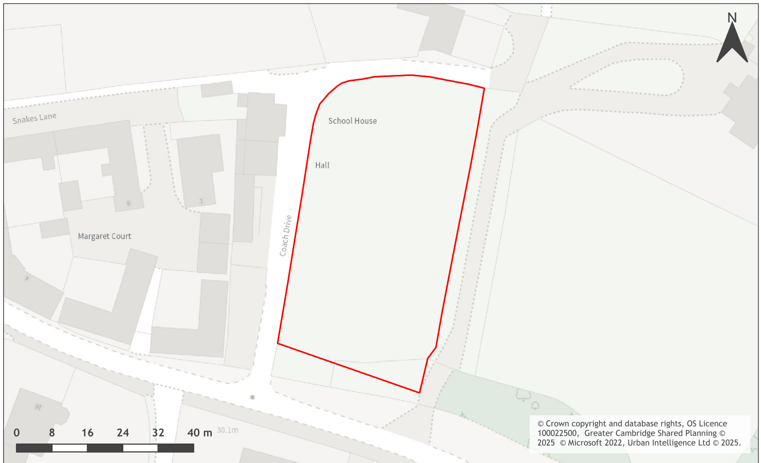
A map of Land off High Street, Harlton