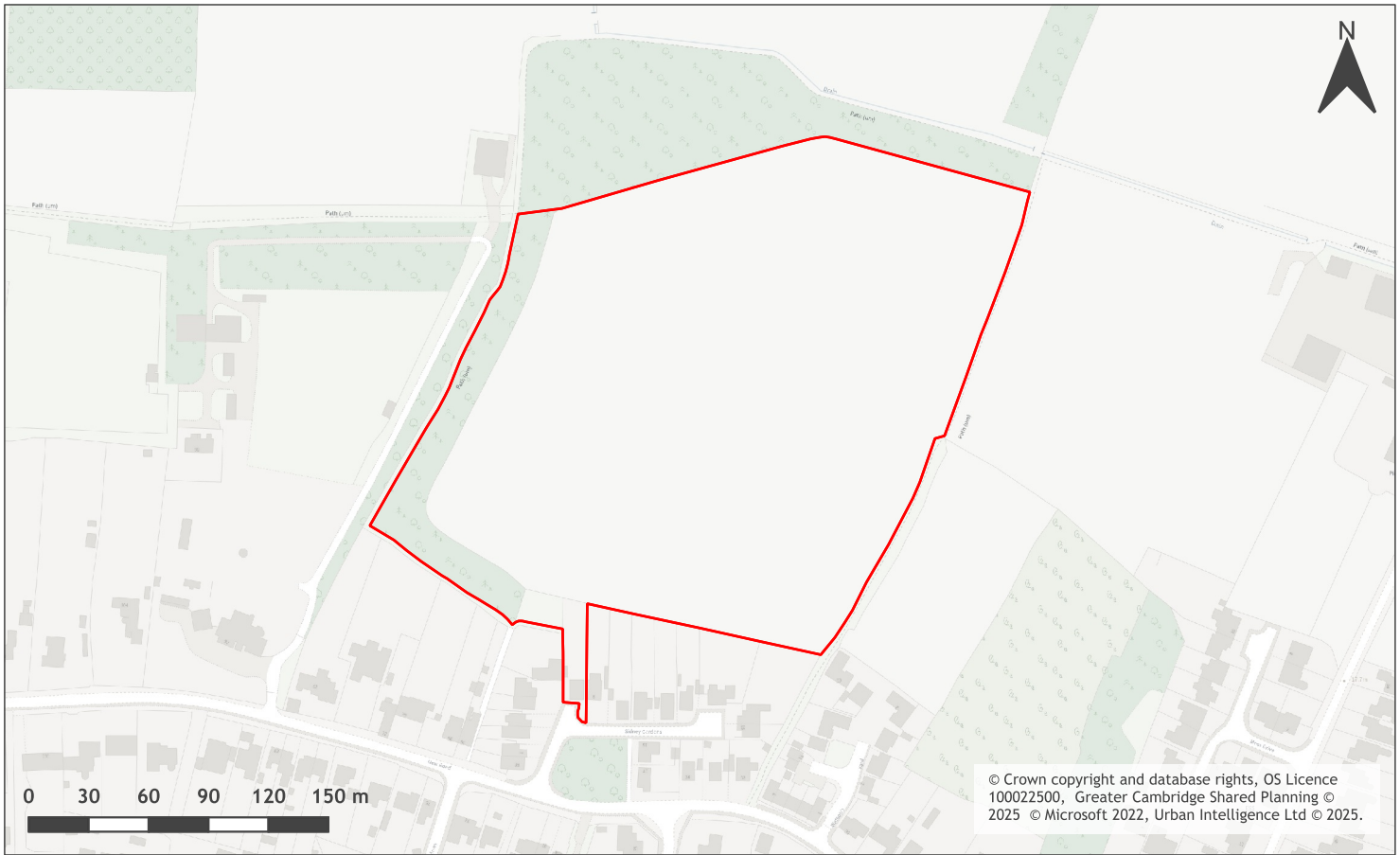
A map of Land north of Sidney Gardens, Haslingfield