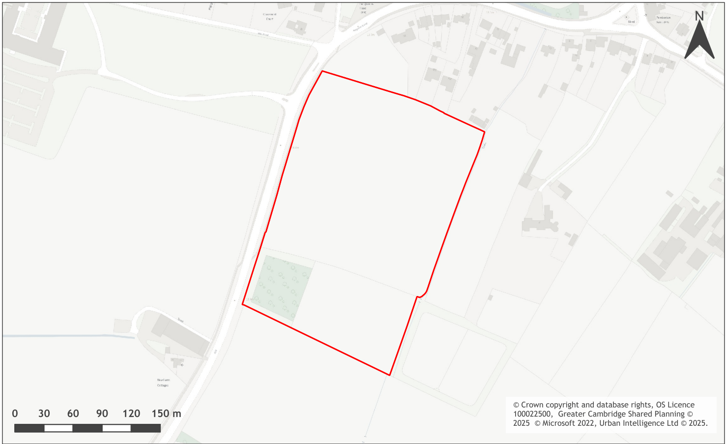
A map of Land at Royston Road, Harston