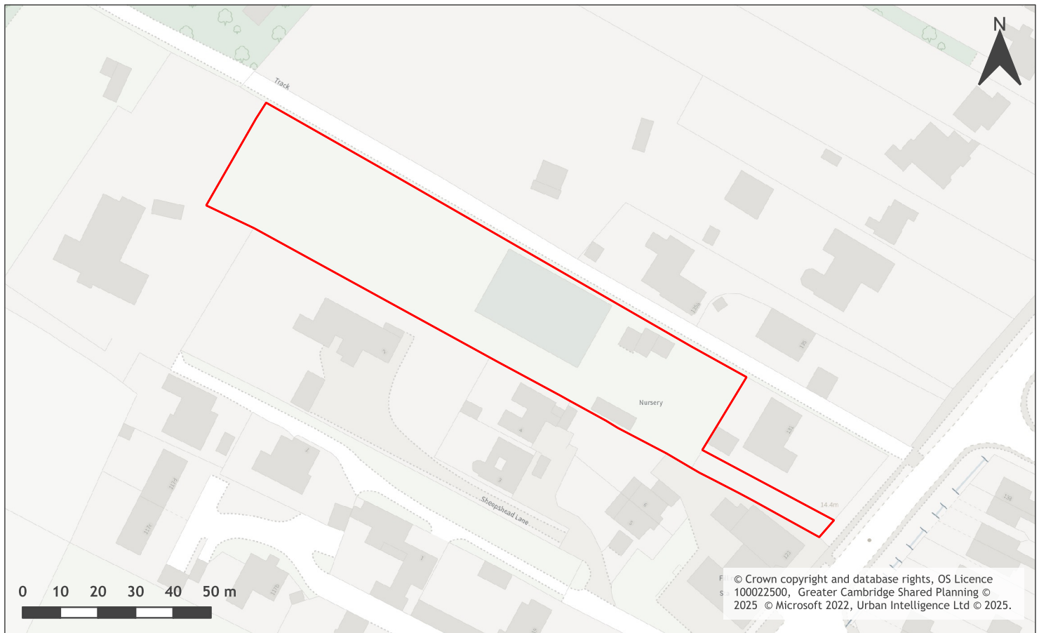
A map of 131 High Street, Harston