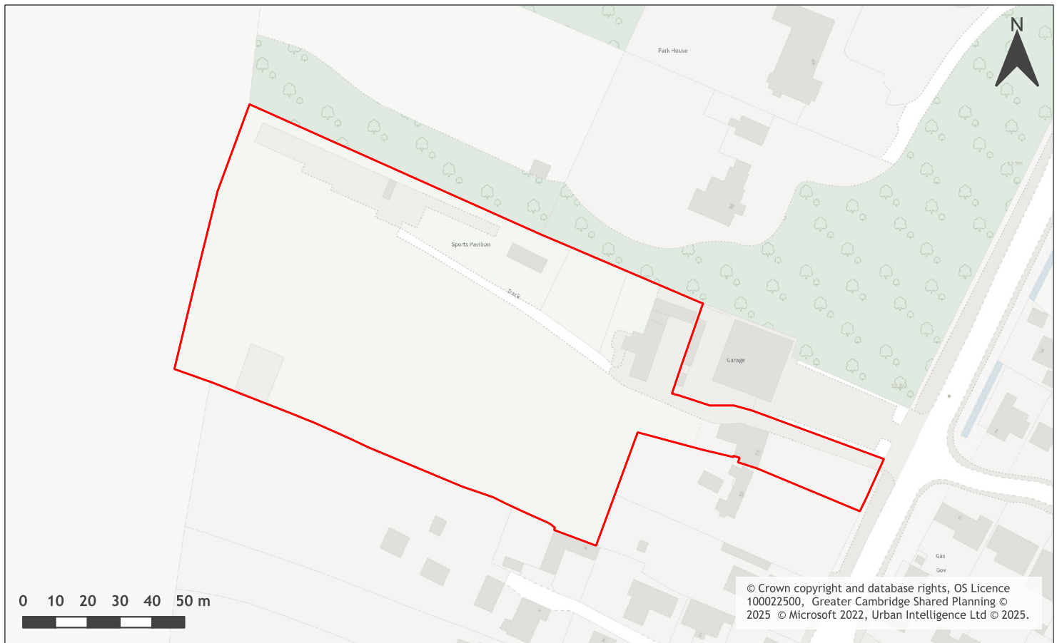
A map of Land off High Street, Harston