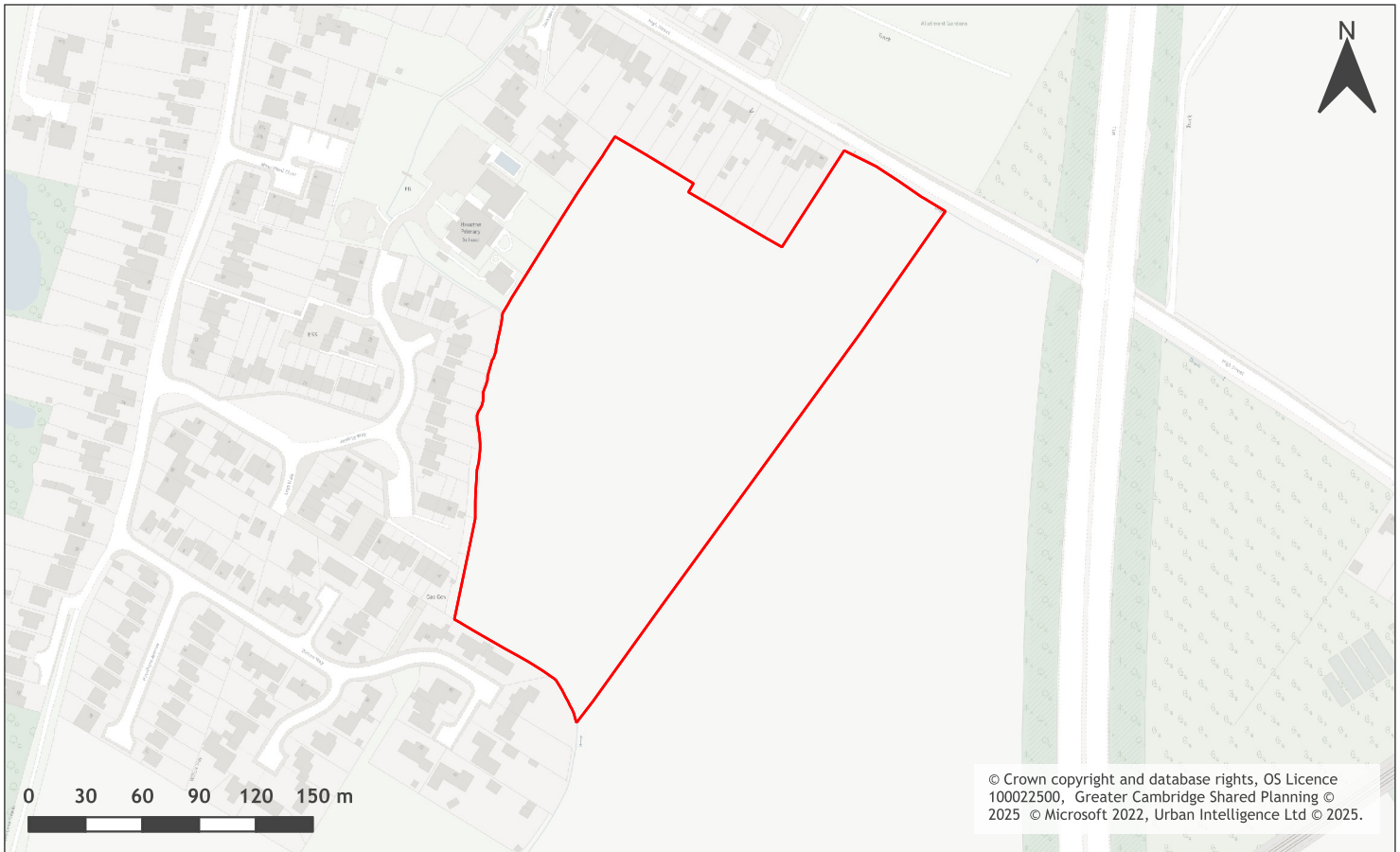
A map of Land south of High Street and west of M11, Hauxton