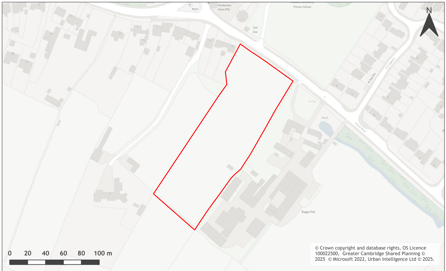
A map of Land south of Station Road, Harston