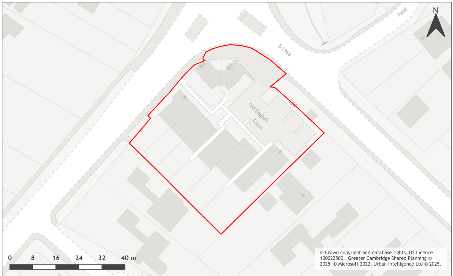
A map of 180 High Street, Harston