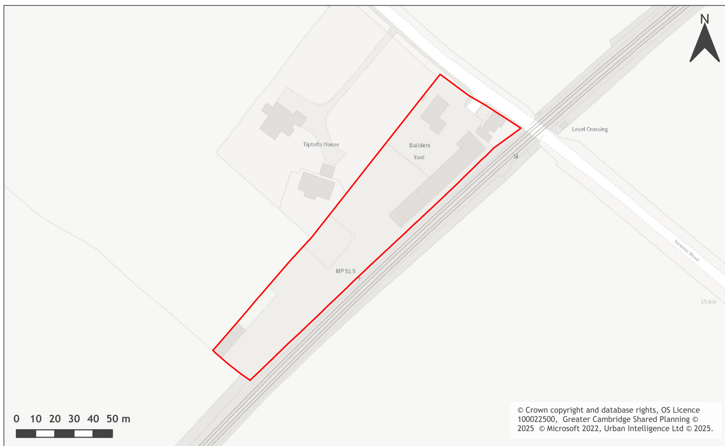
A map of SIG Roofing site, Station Road, Harston