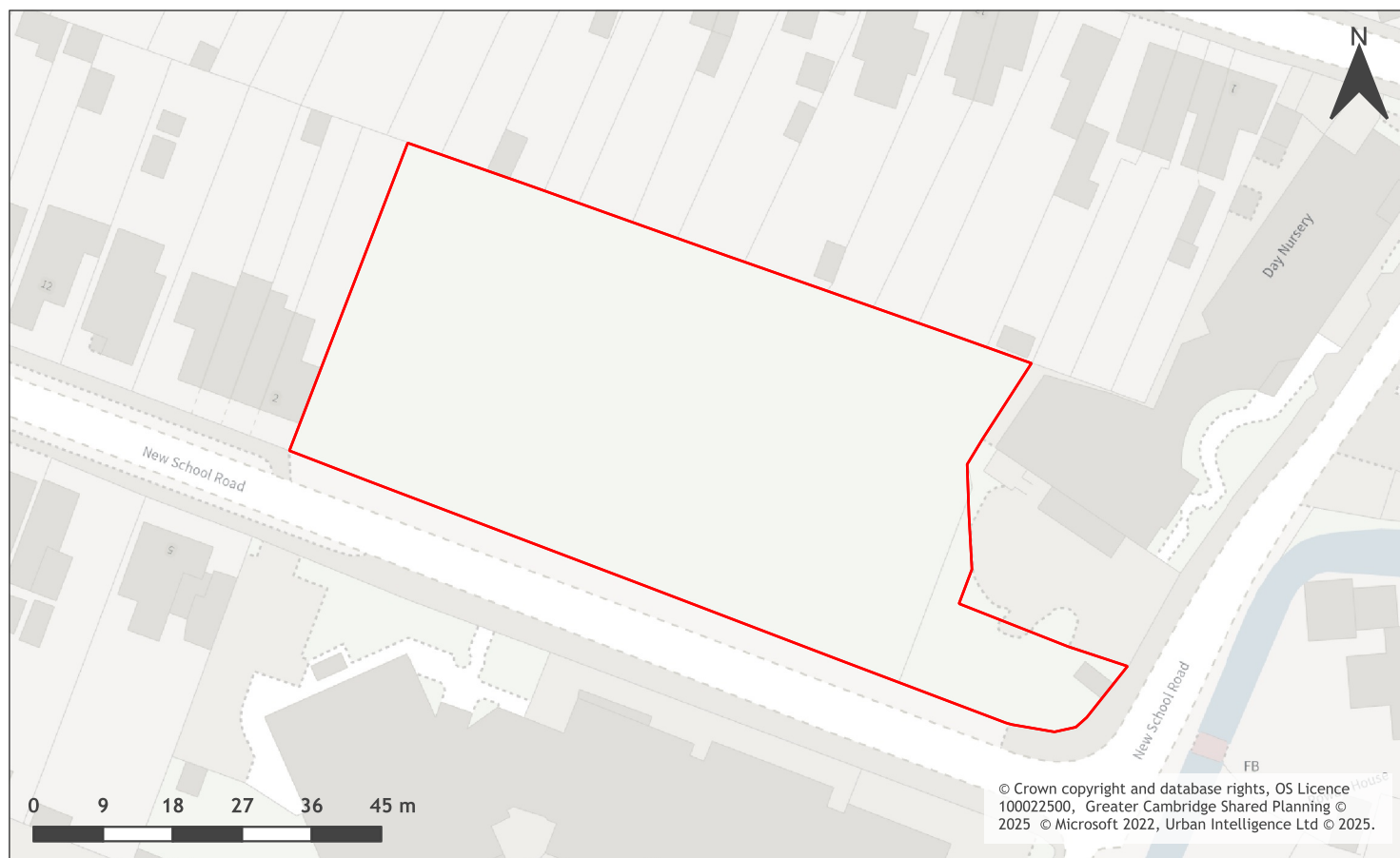
A map of Histon Infant School Playing field, New School Road, Histon