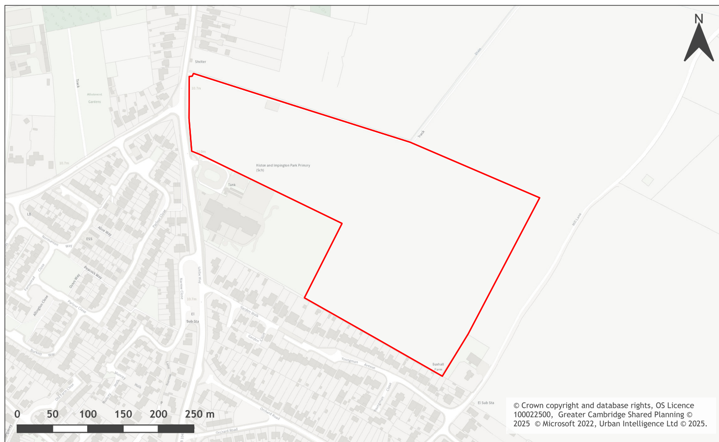
A map of Land east of Glebe Way, Histon