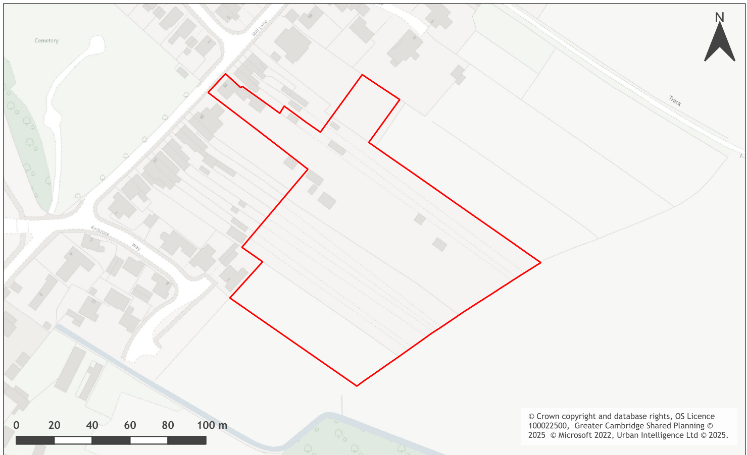
A map of Land off Mill Lane, Impington