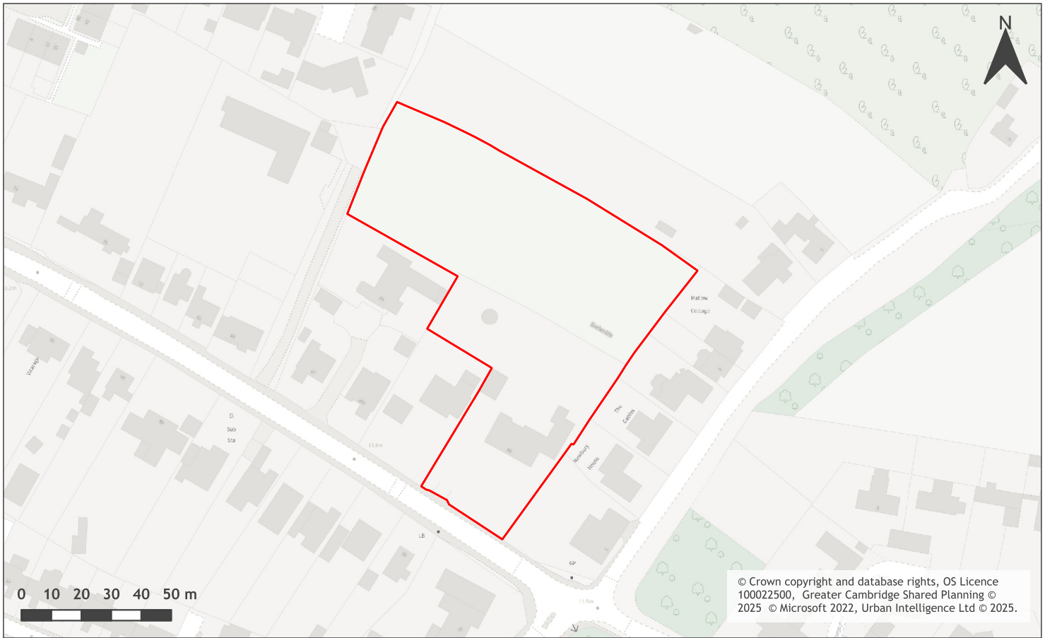
A map of 93 Impington Lane, Impington