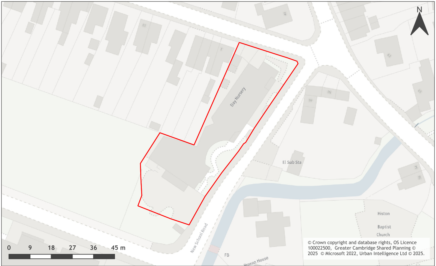
A map of Histon Early Years Centre, New School Rd, Histon