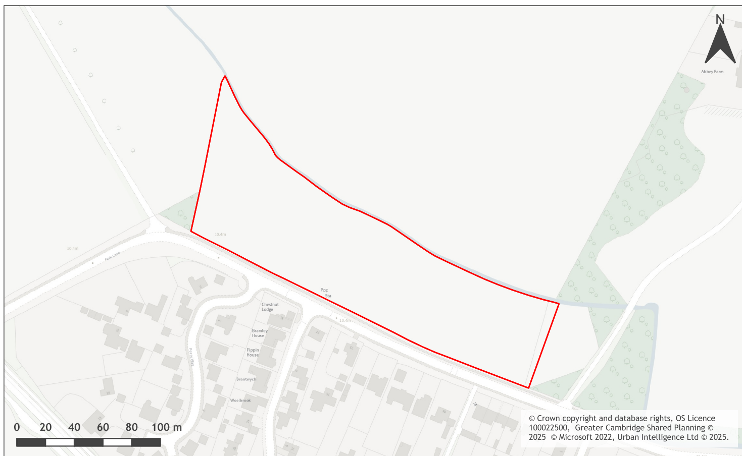
A map of Land to the north of Park Lane, Histon