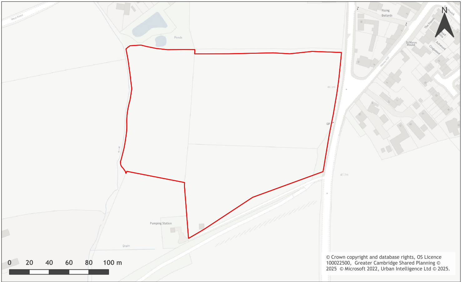
A map of Land to the west of Mill Street, Gamlingay