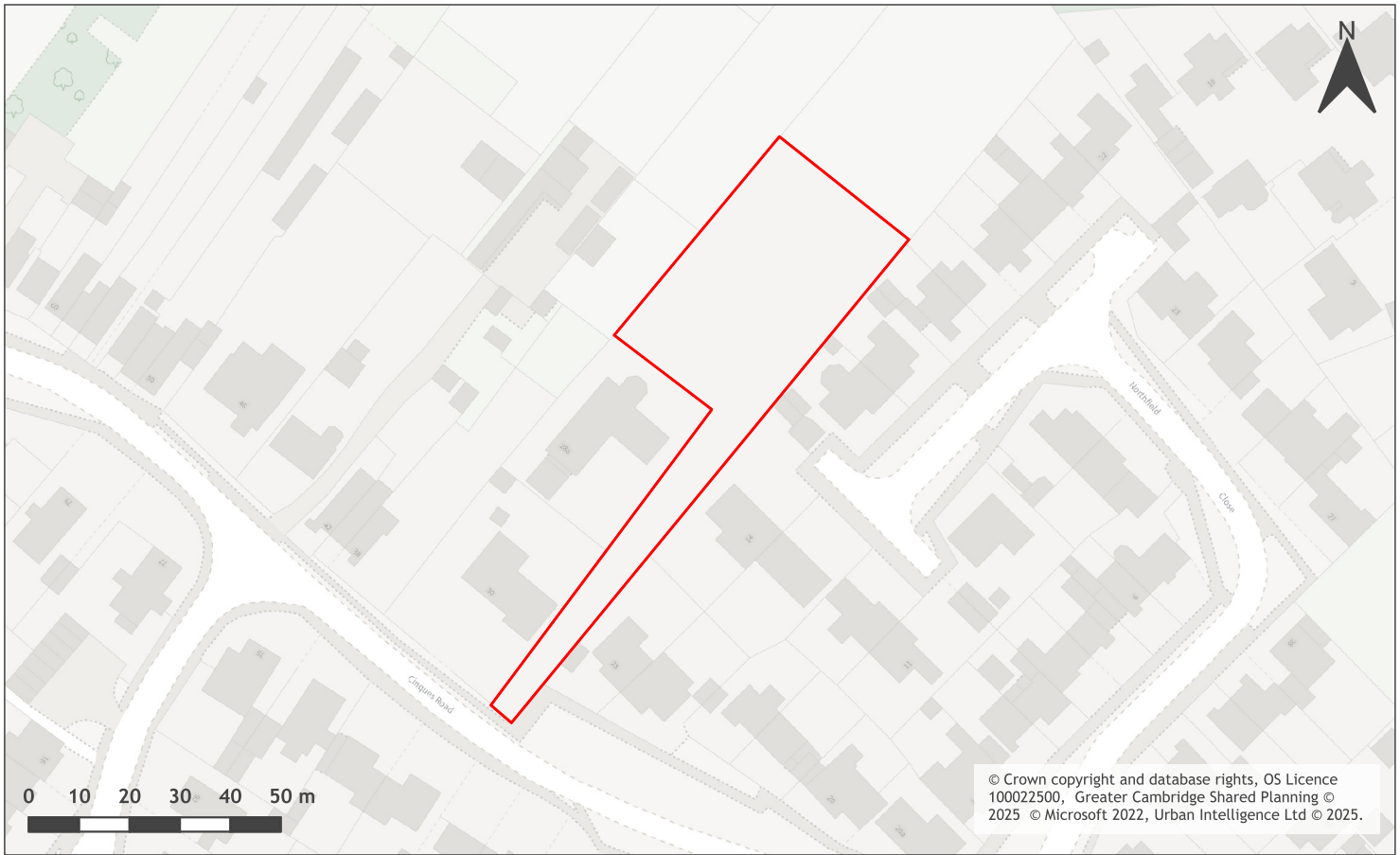
A map of Land to the Rear of 28a Cinques Road, Gamlingay