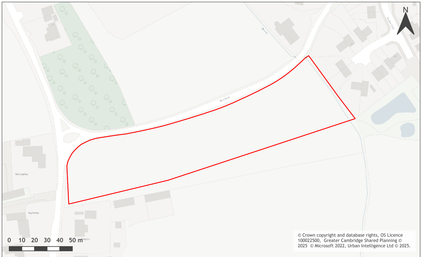
A map of Land to the south of West Road, Gamlingay