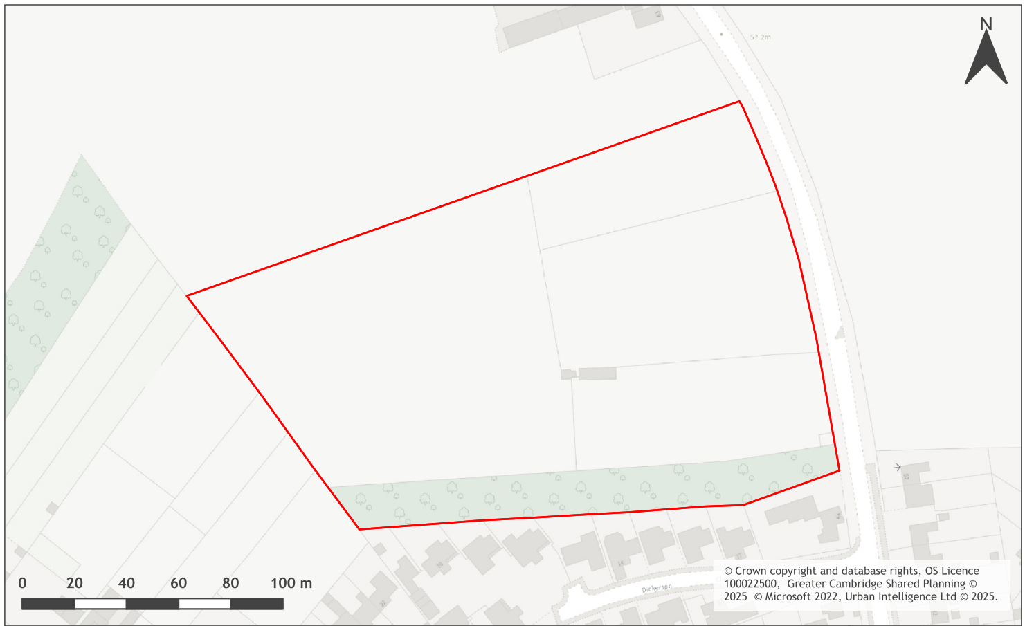
A map of Land at Waresley Road, Gamlingay