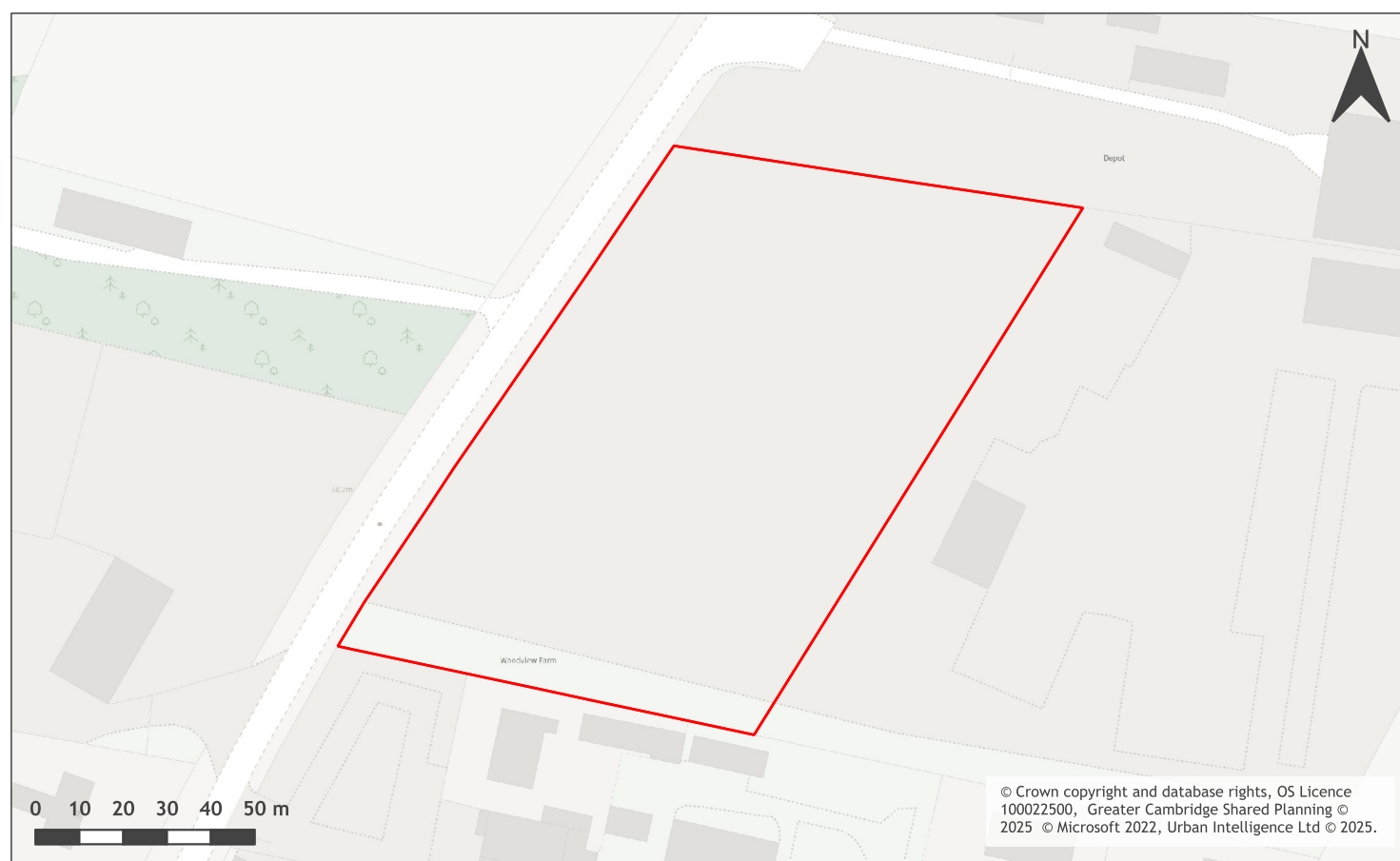
A map of Land at Potton Road, Gamlingay