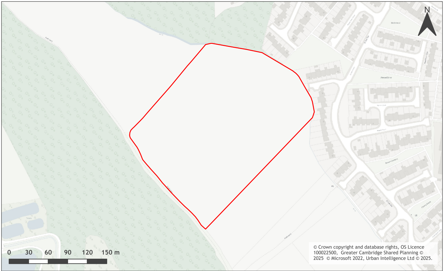
A map of Land adjacent Green Acres, Gamlingay