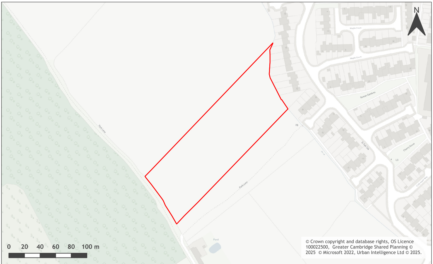
A map of Land north east side of Park Lane, Gamlingay