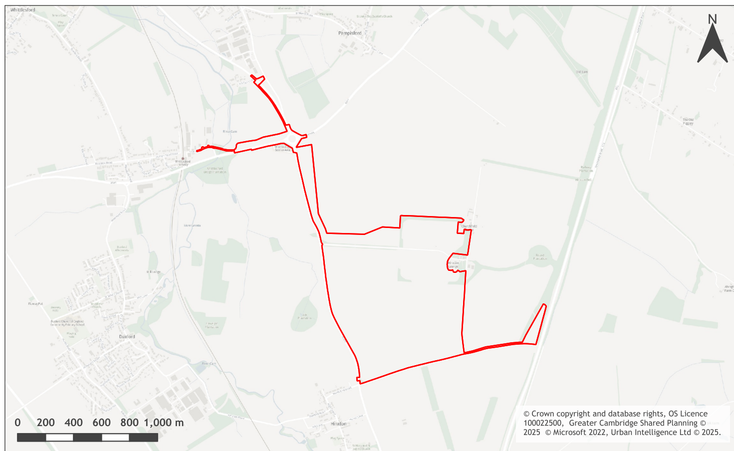
A map of Land to east of A1301, Hinxton and north of A505, near Whittlesford