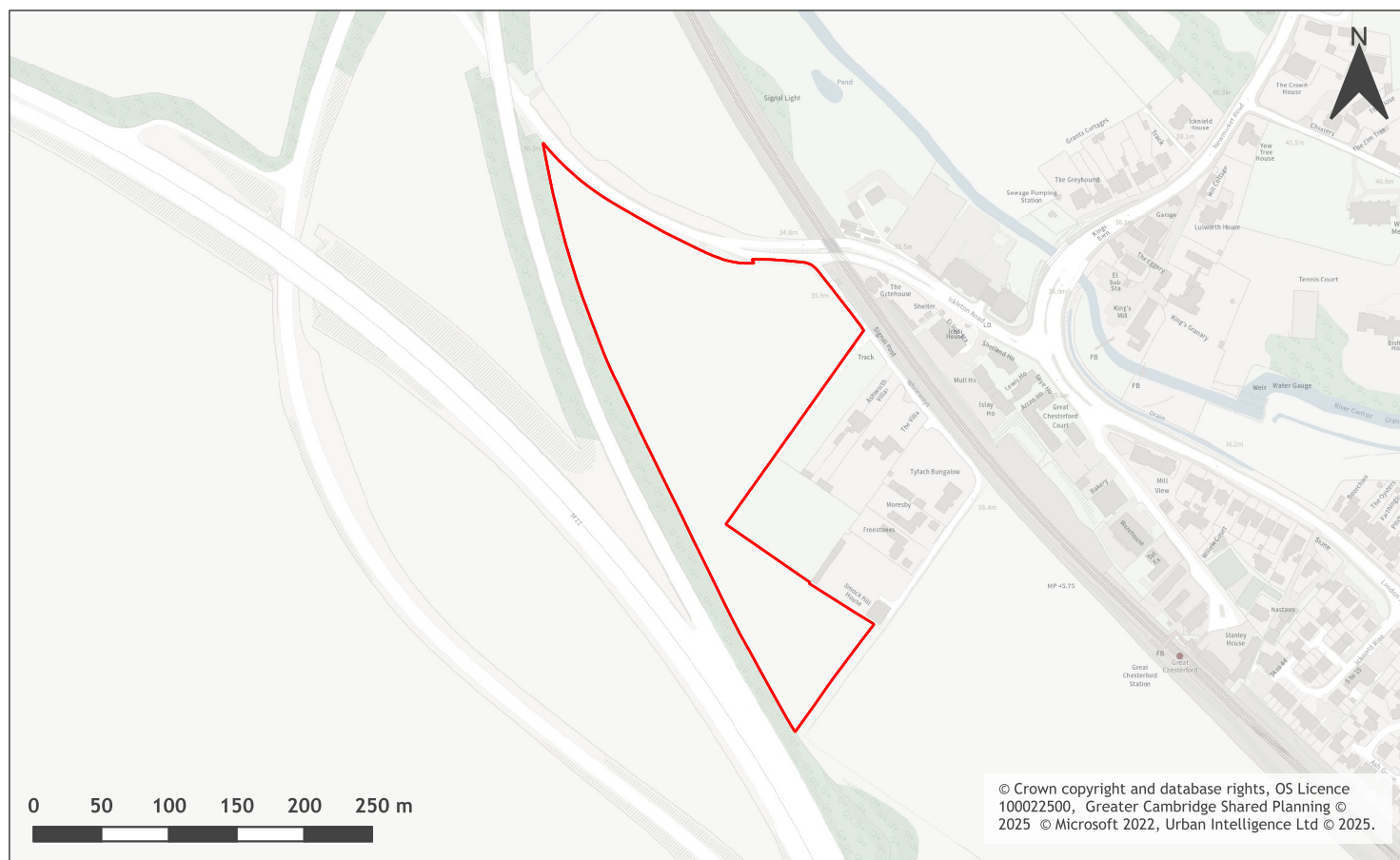
A map of Land south of Ickleton Road, Great Chesterford