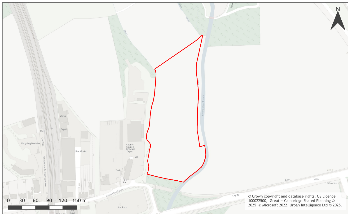
A map of Land east of Whittlesford Highways Depot