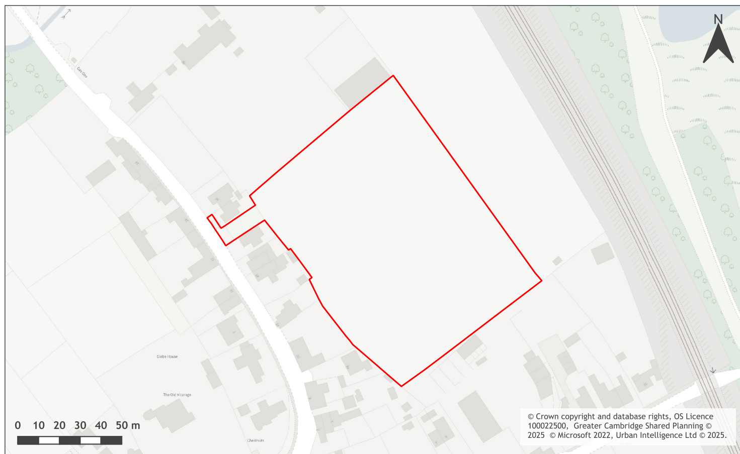
A map of Land to the rear of No. 24 Brookhampton Street, Ickleton