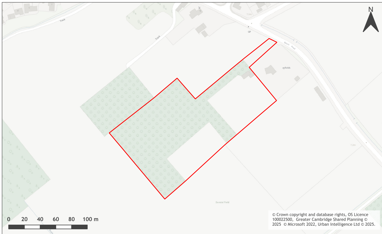
A map of Land at Beach Road, Cottenham