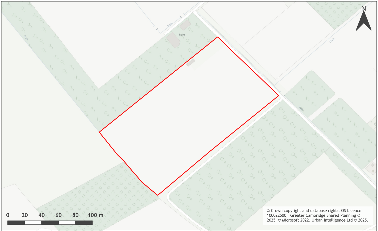
A map of Land to the south west Short Drove, Cottenham