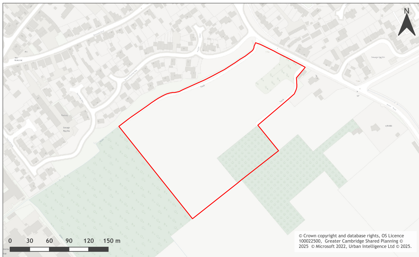
A map of Land west of Beach Road, Cottenham