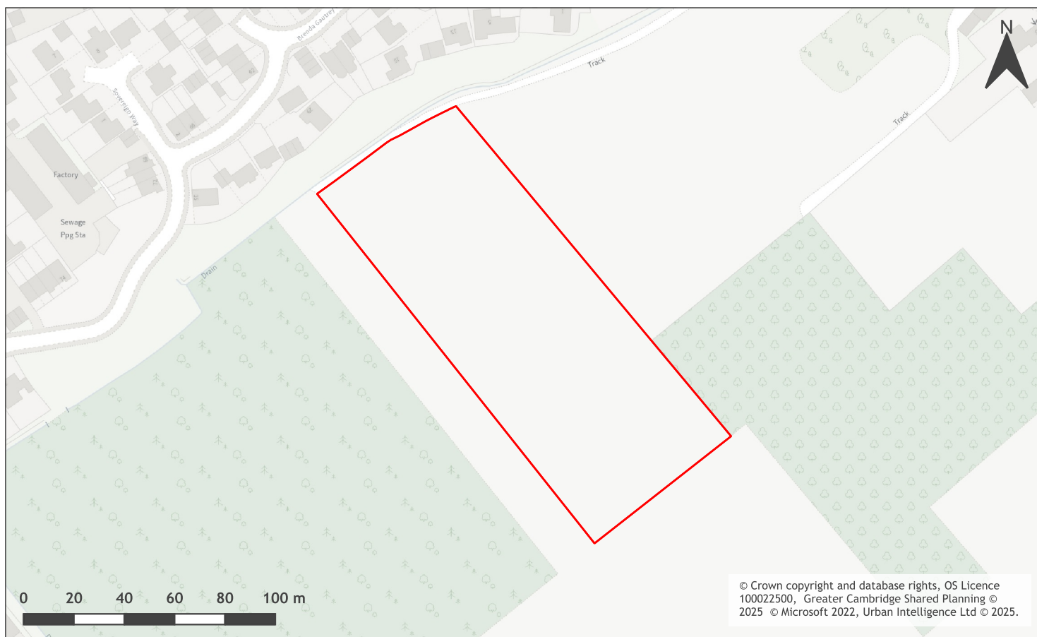
A map of Land off Beach Road, Cottenham