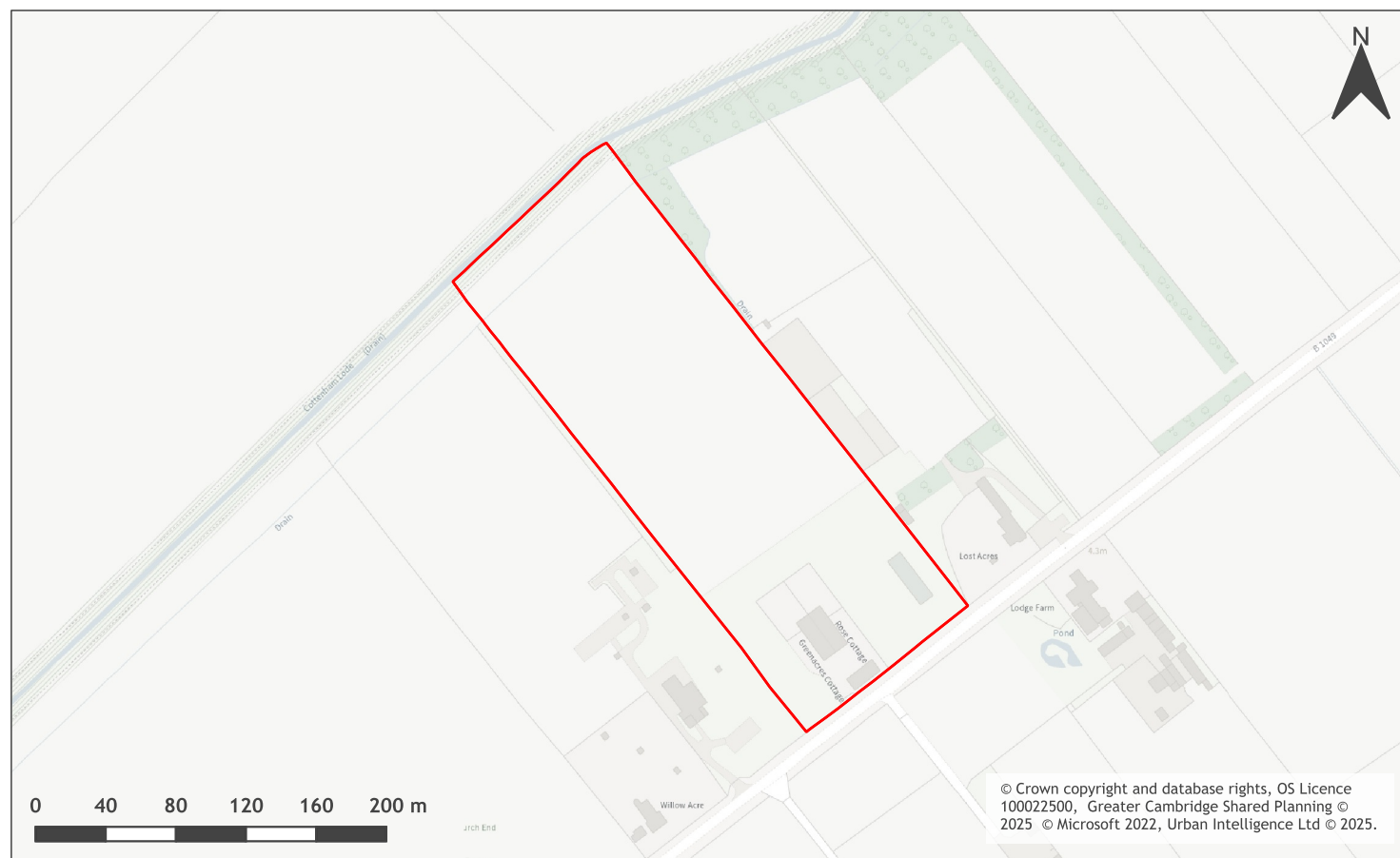
A map of Haelan Feld Farm, Twenty Pence Road, Cottenham