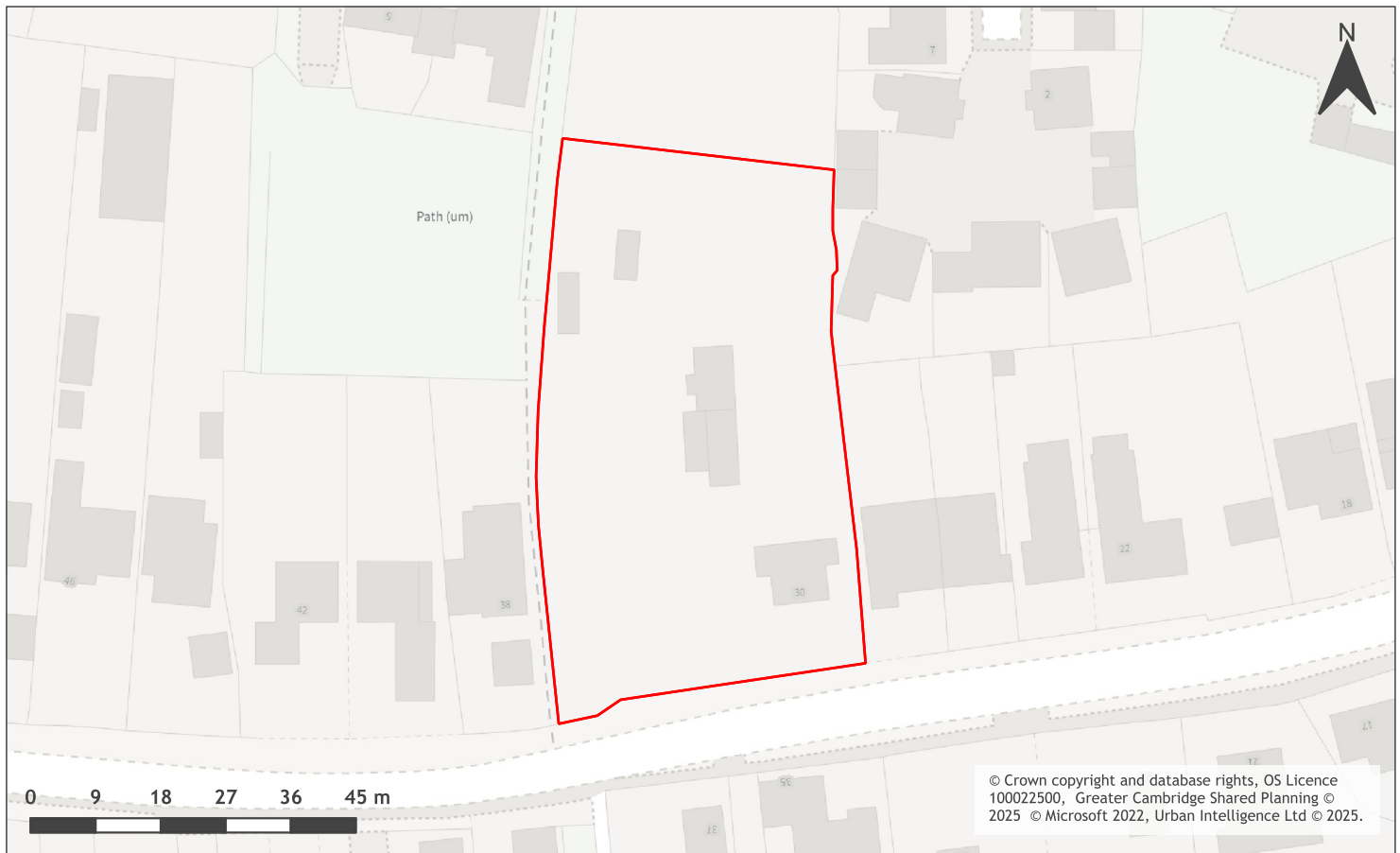
A map of 30 King Street, Rampton