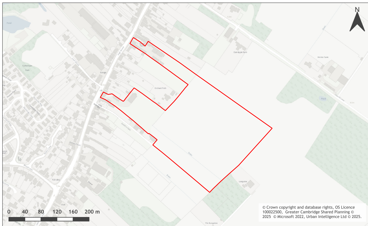
A map of Land to the rear of High Street, Cottenham