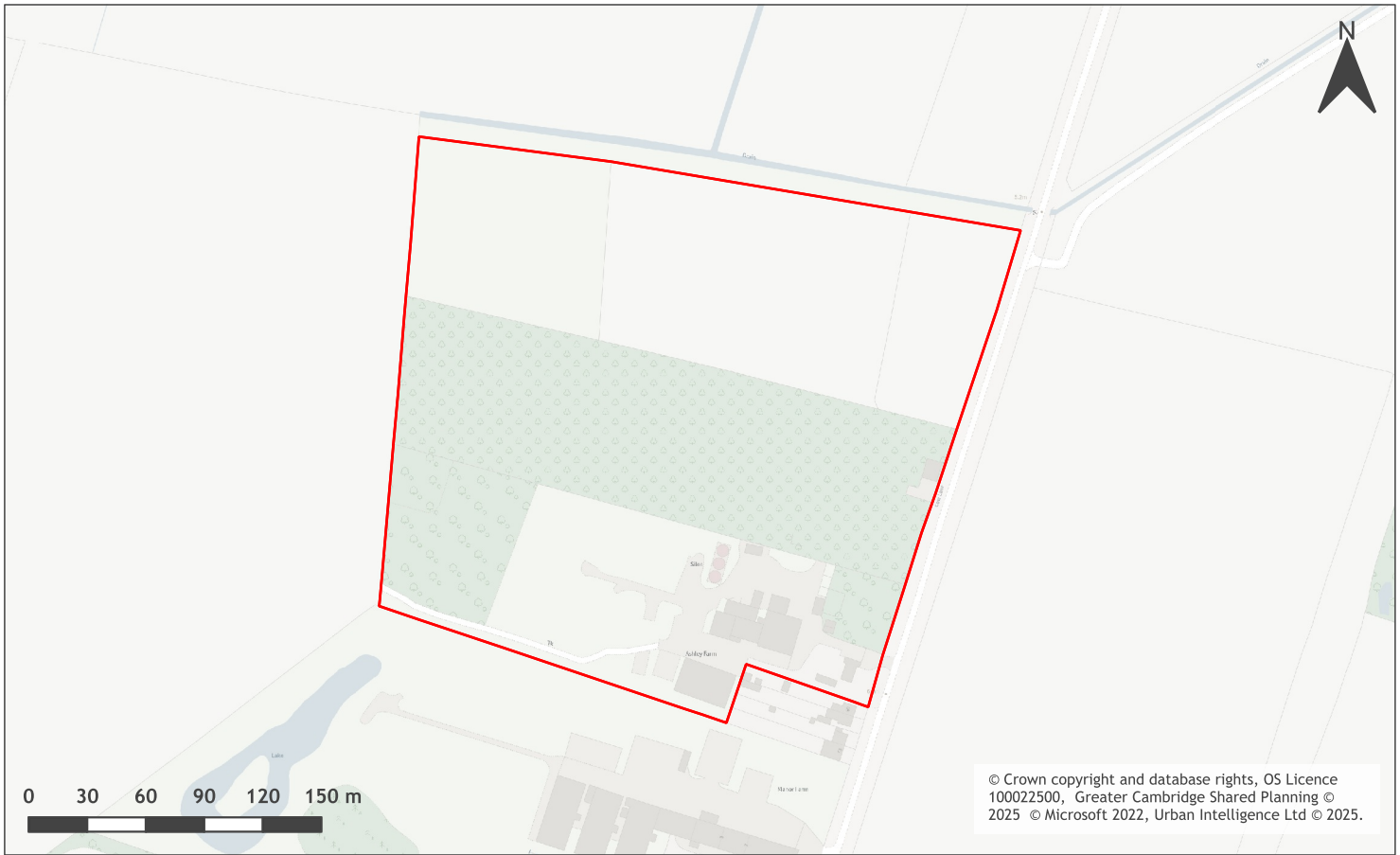
A map of Land at Ashley Farm, west of Cow Lane, Rampton