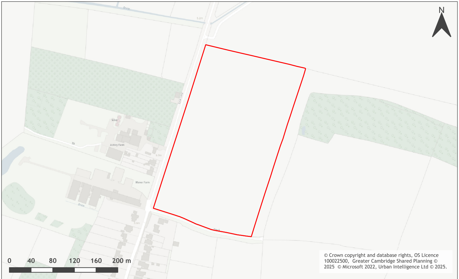
A map of Land at Ashley Farm, east of Cow Lane, Rampton