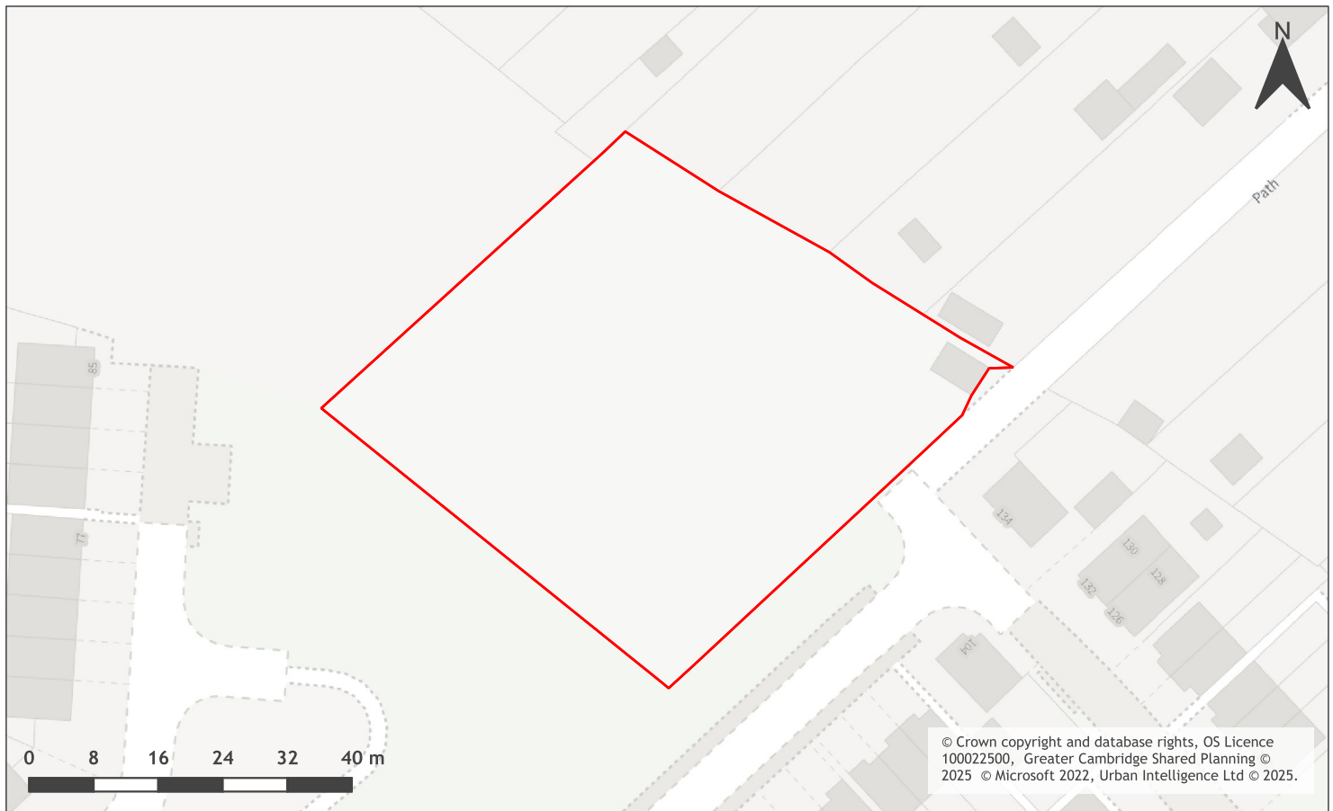
A map of Land to rear of 89 Rampton Road, Cottenham