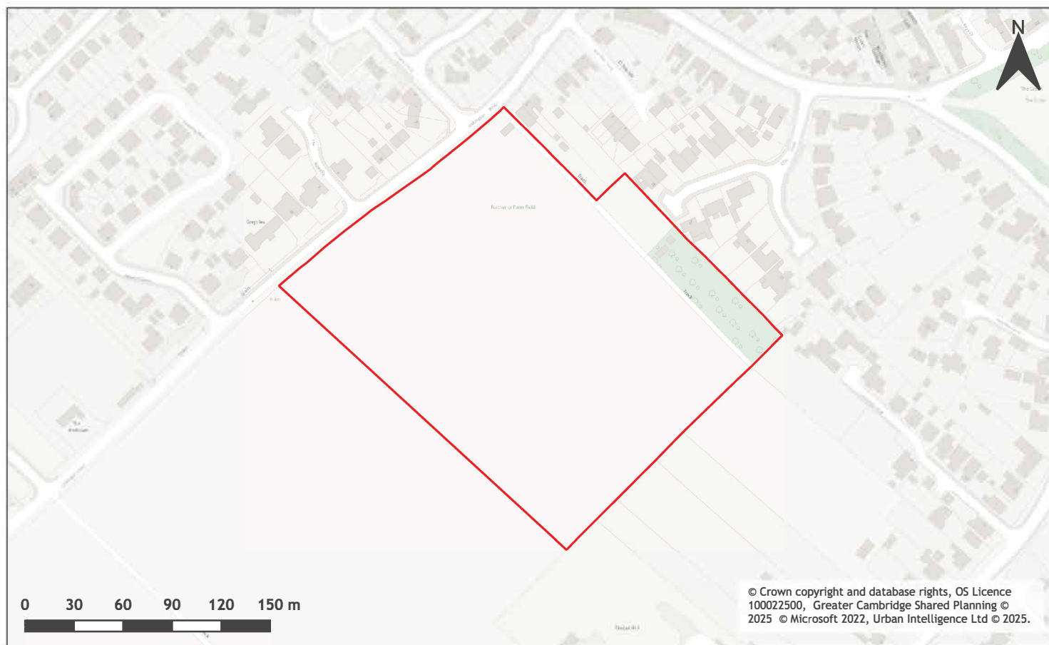
A map of Land to the south of Oakington Road Cottenham