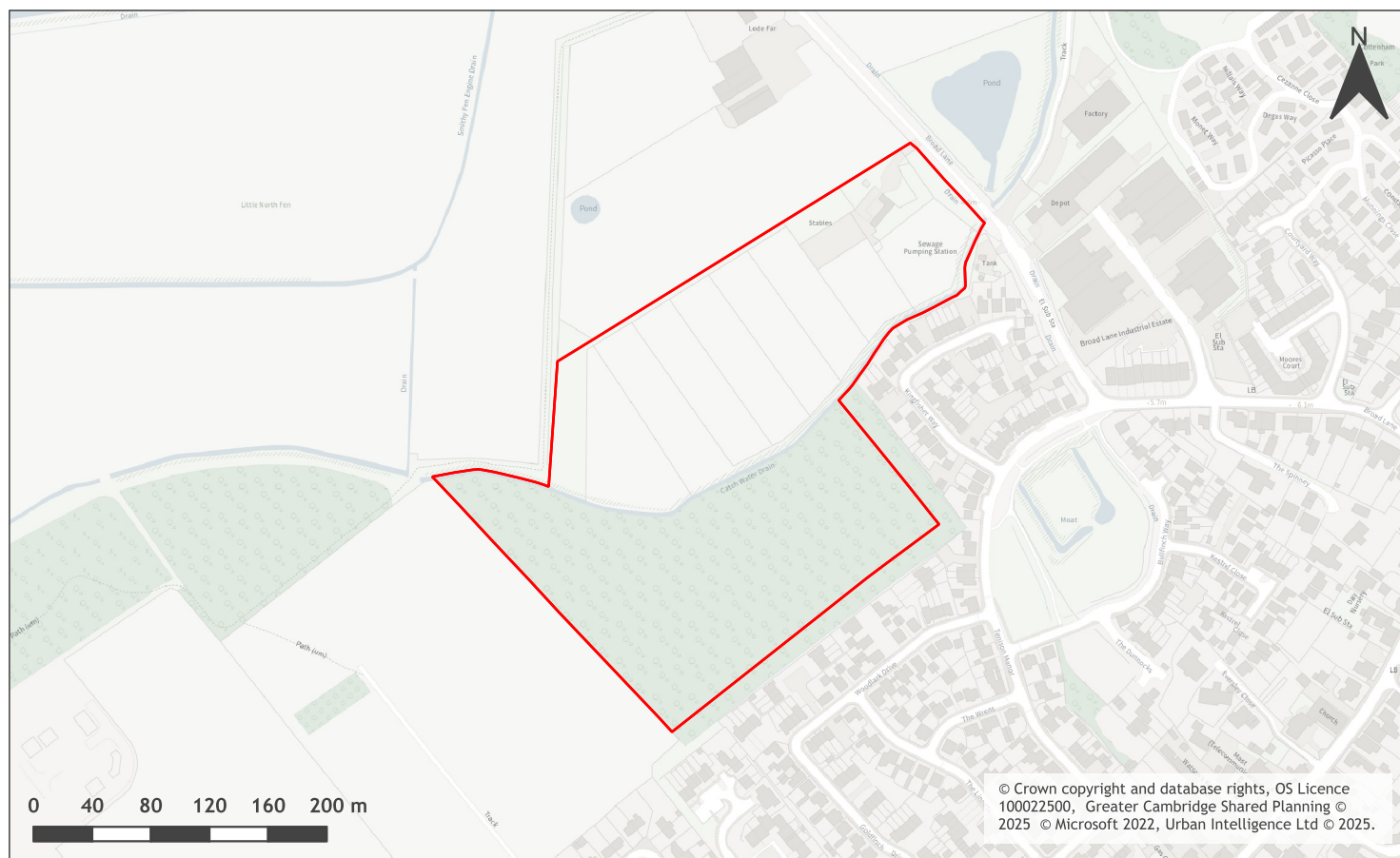
A map of Land north of Cottenham, Cottenham