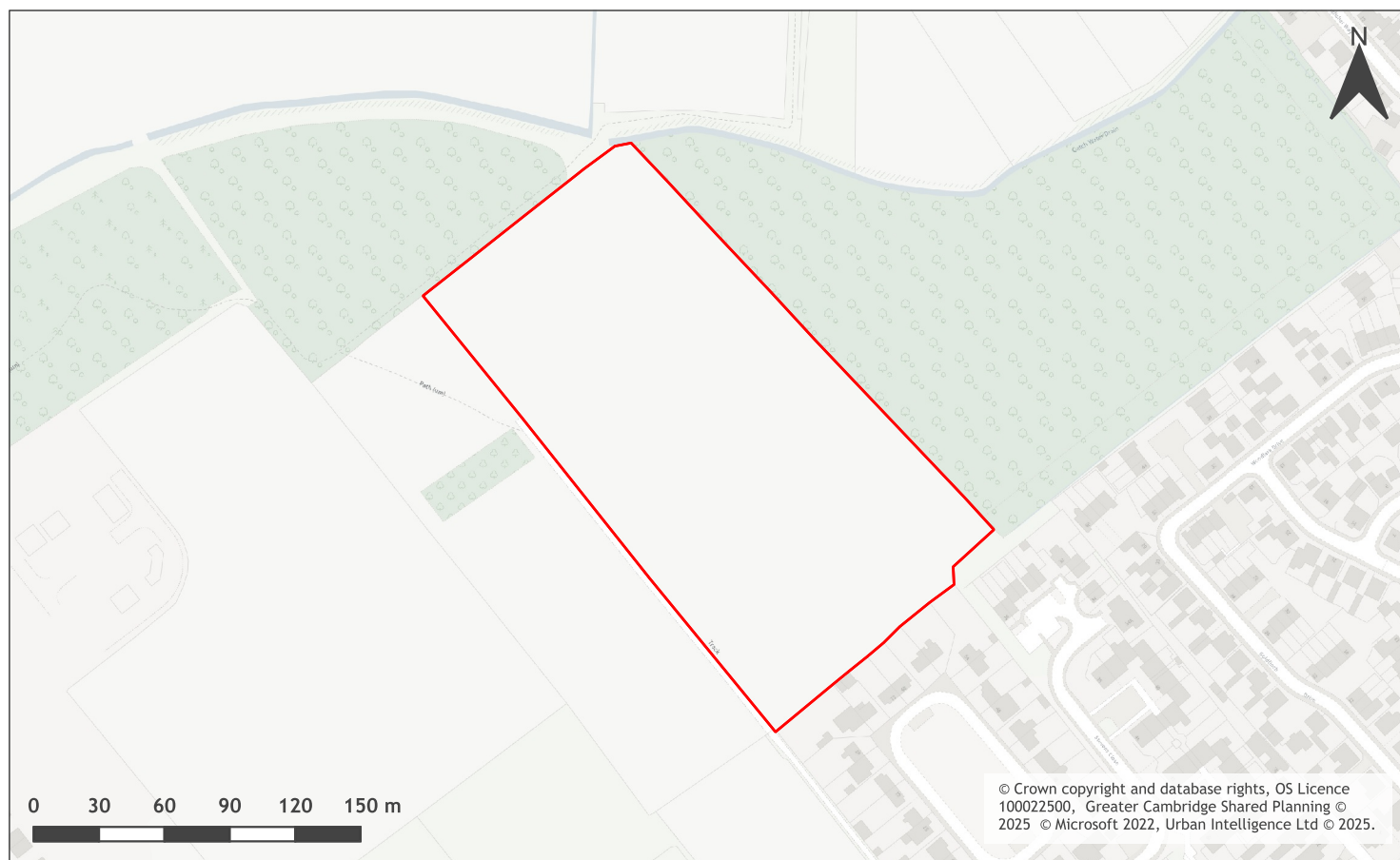
A map of Land at Two Mill Field, Cottenham