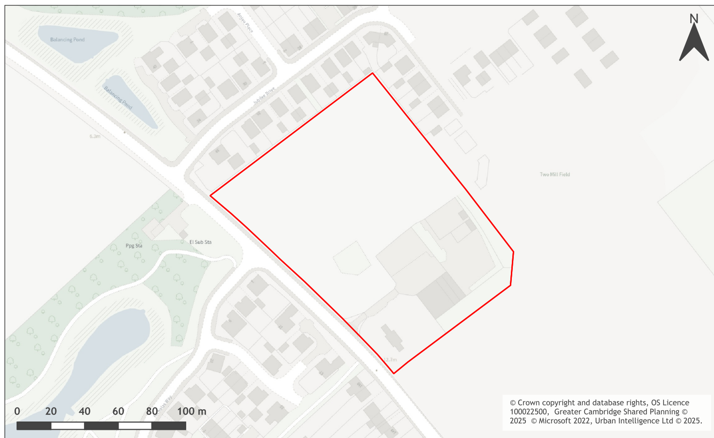
A map of Ramphill Farm, Rampton Road, Cottenham