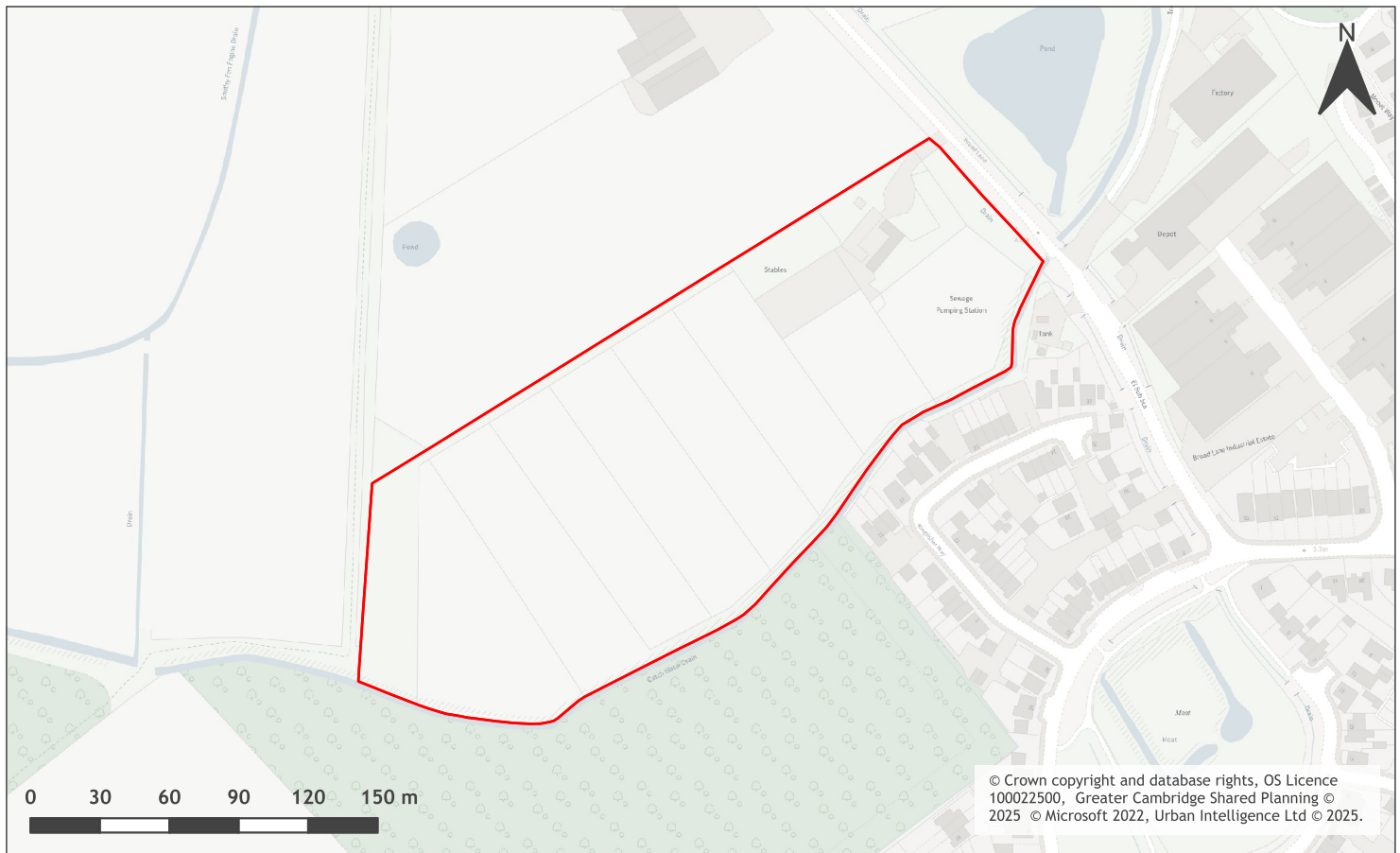
A map of Land off Kingfisher Way, Cottenham