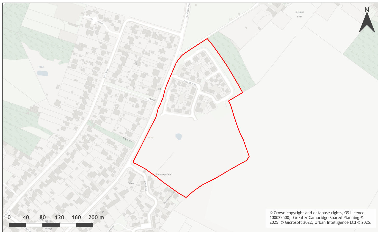
A map of Land at Highfields (phase 2), Caldecote