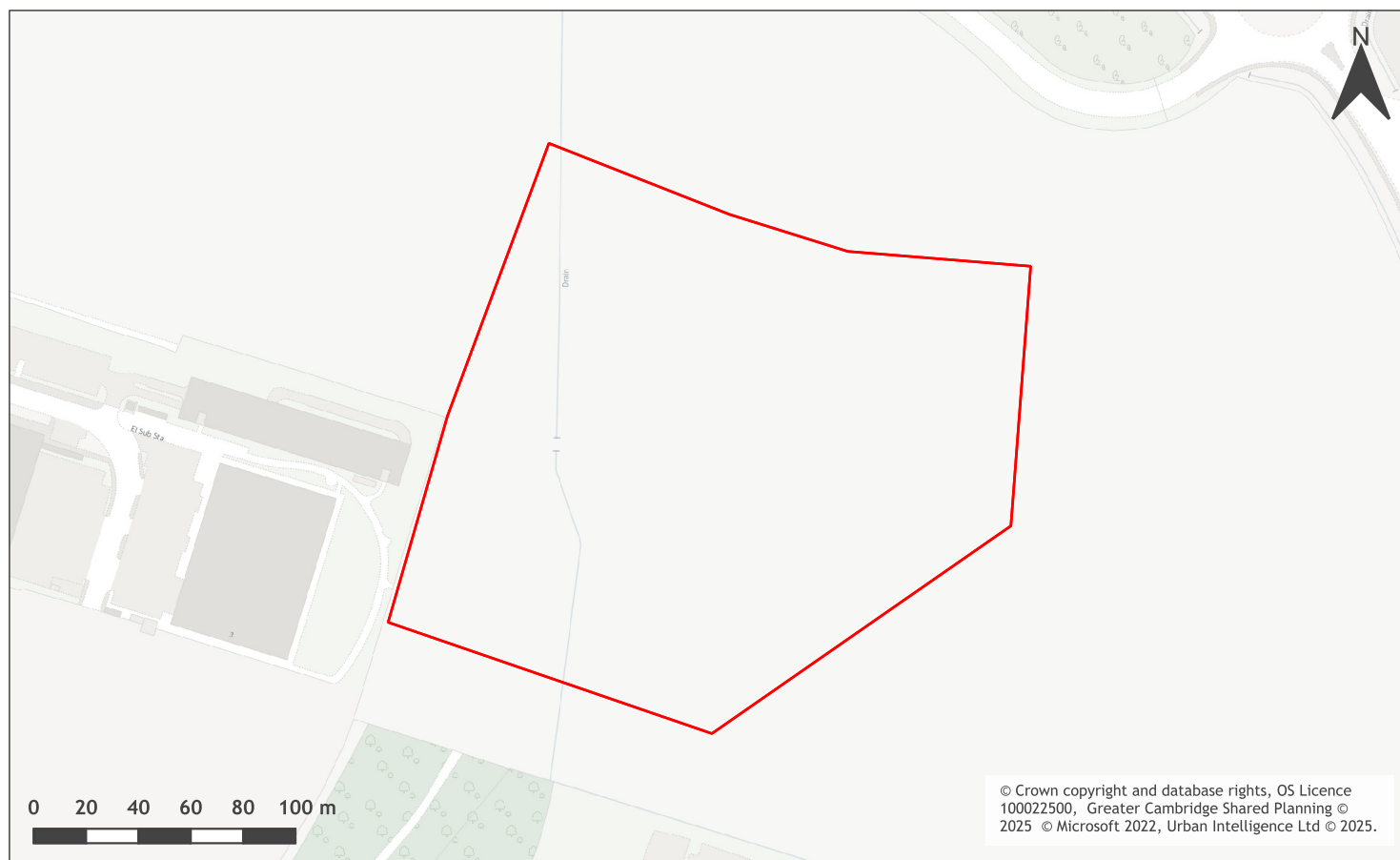
A map of Land at Bourn Airfield, south of Wellington Way, Bourn