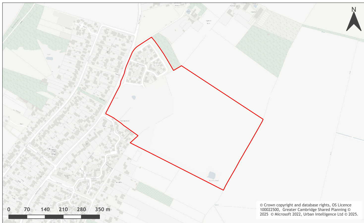
A map of Land at Highfields (phase 3), Caldecote