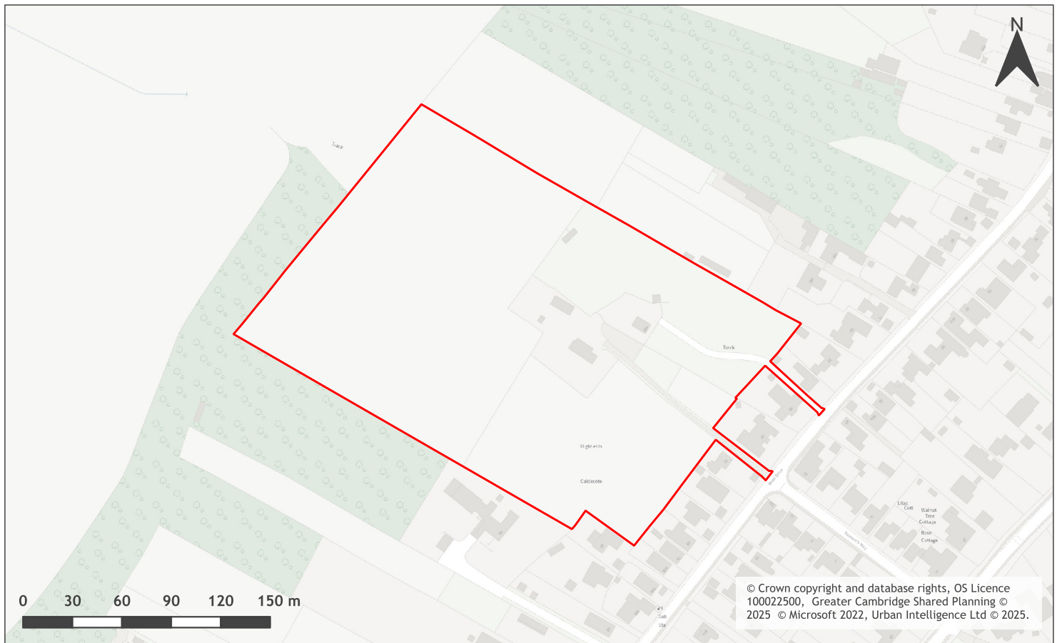
A map of Land rear of 62-84 West Drive, Caldecote