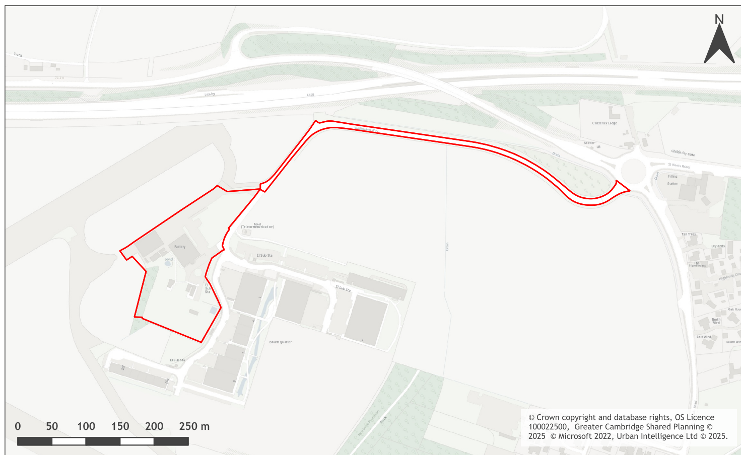
A map of DB Group (Holdings) Ltd, Wellington Way, Bourn