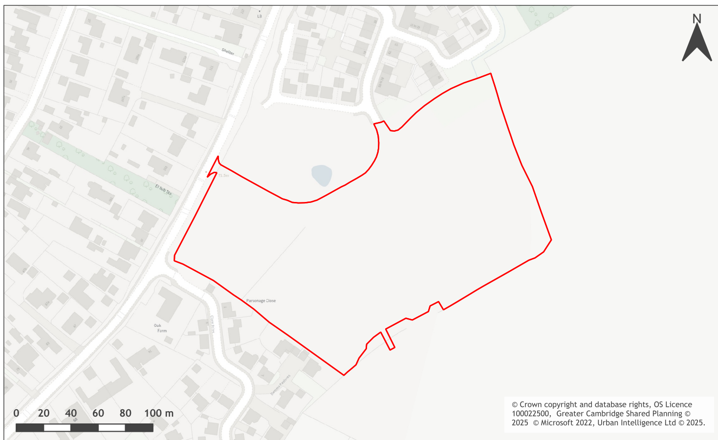
A map of Land at Highfields (phase 3), Caldecote