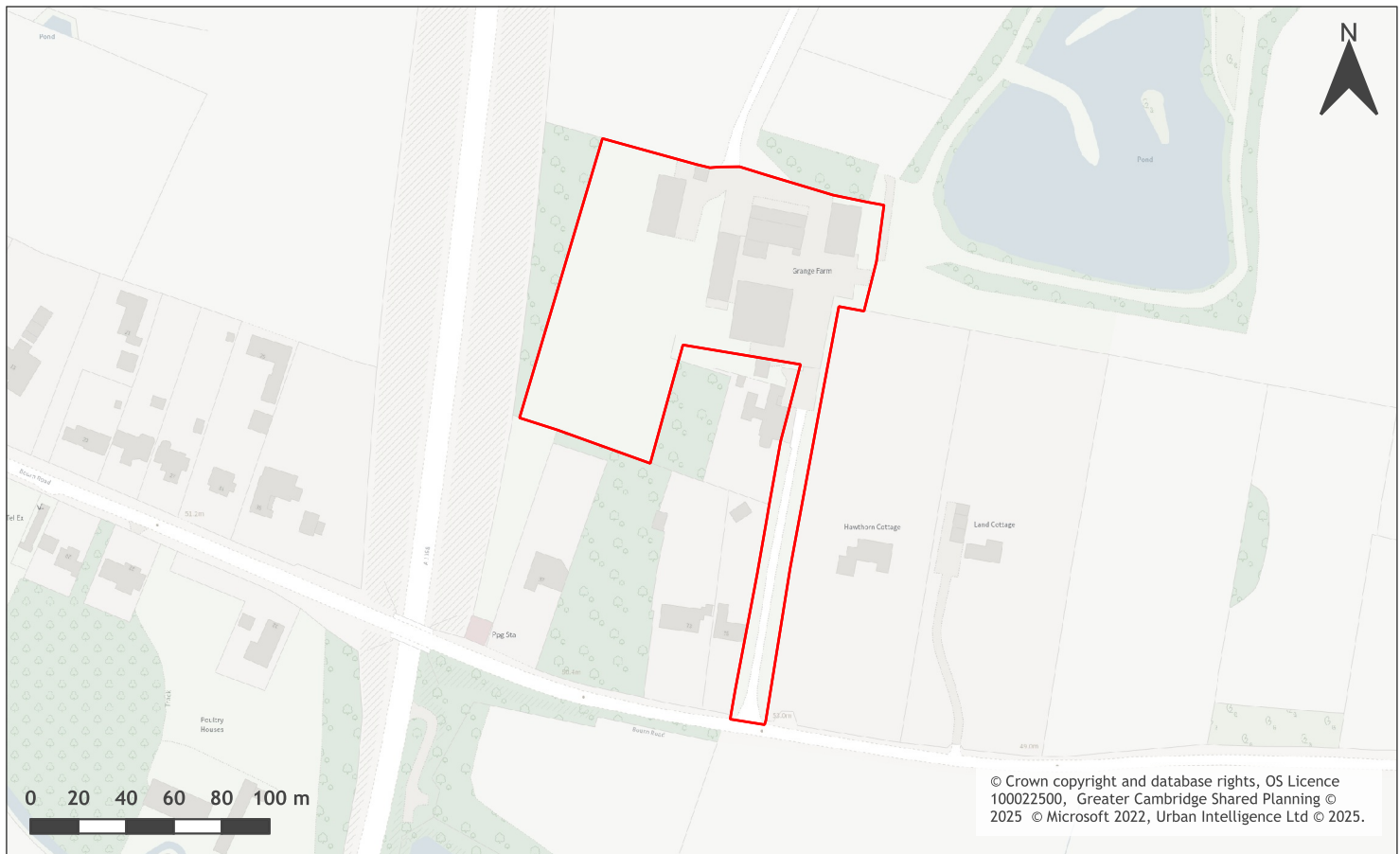
A map of Grange Farm, Bourn Road, Caxton