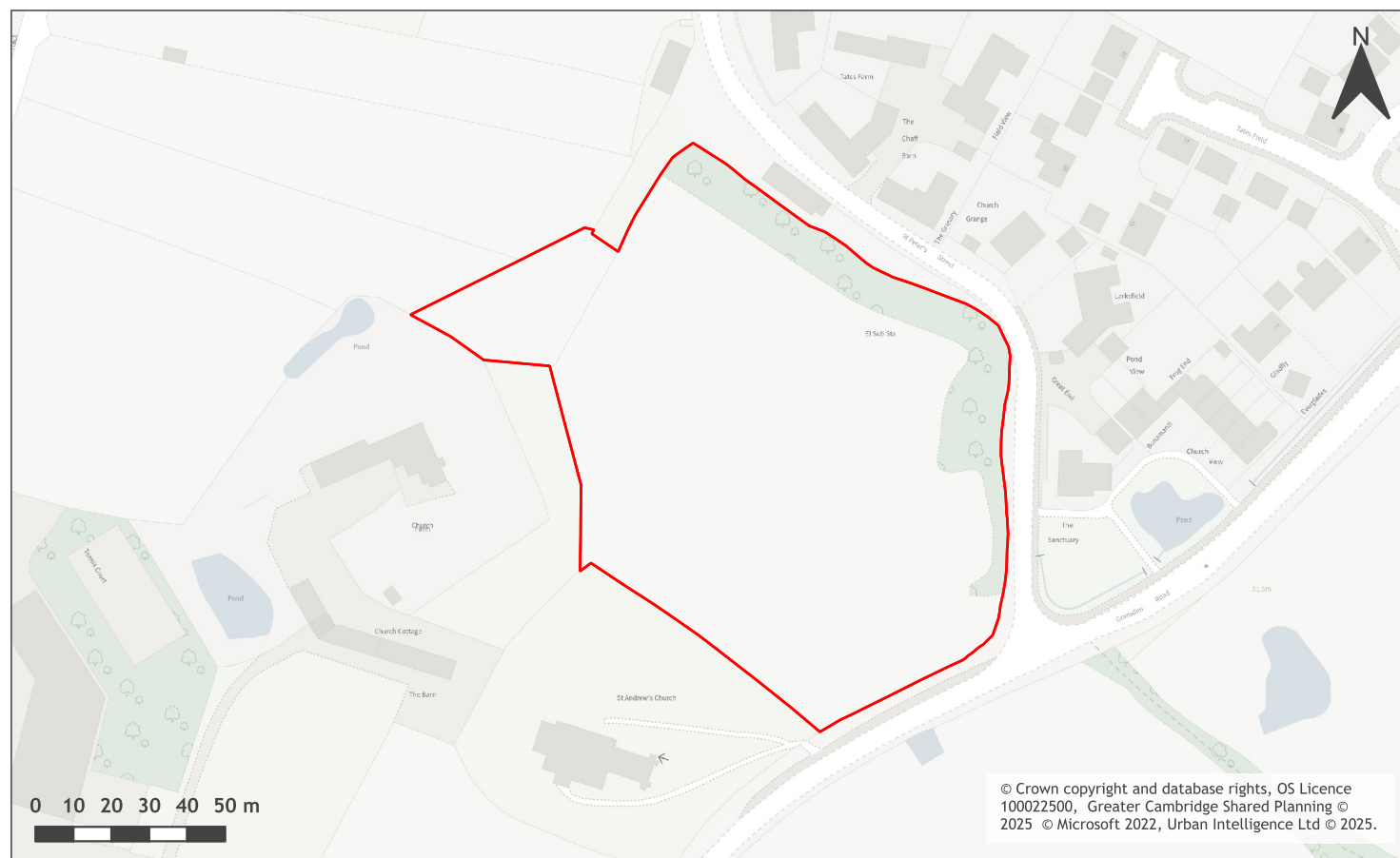
A map of Land at St Peters Street, Caxton