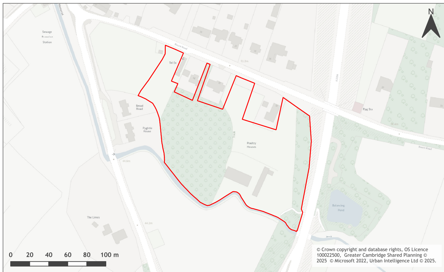
A map of Land at 20 Bourn Road, Caxton