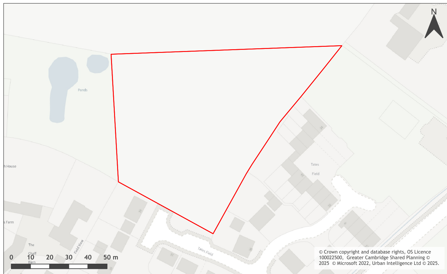
A map of Land off Bates Field, Caxton