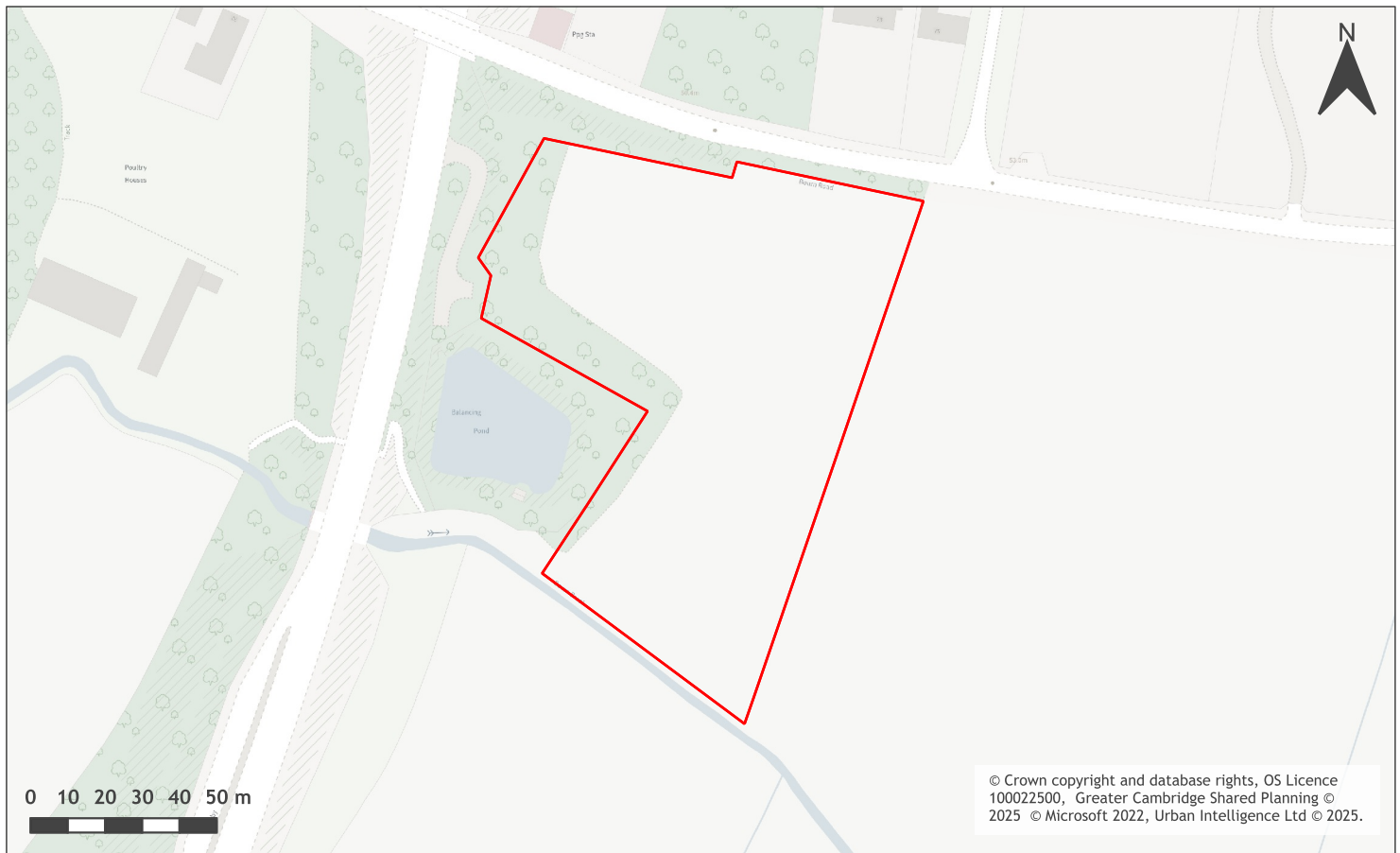
A map of Land south of Bourn Road, Caxton