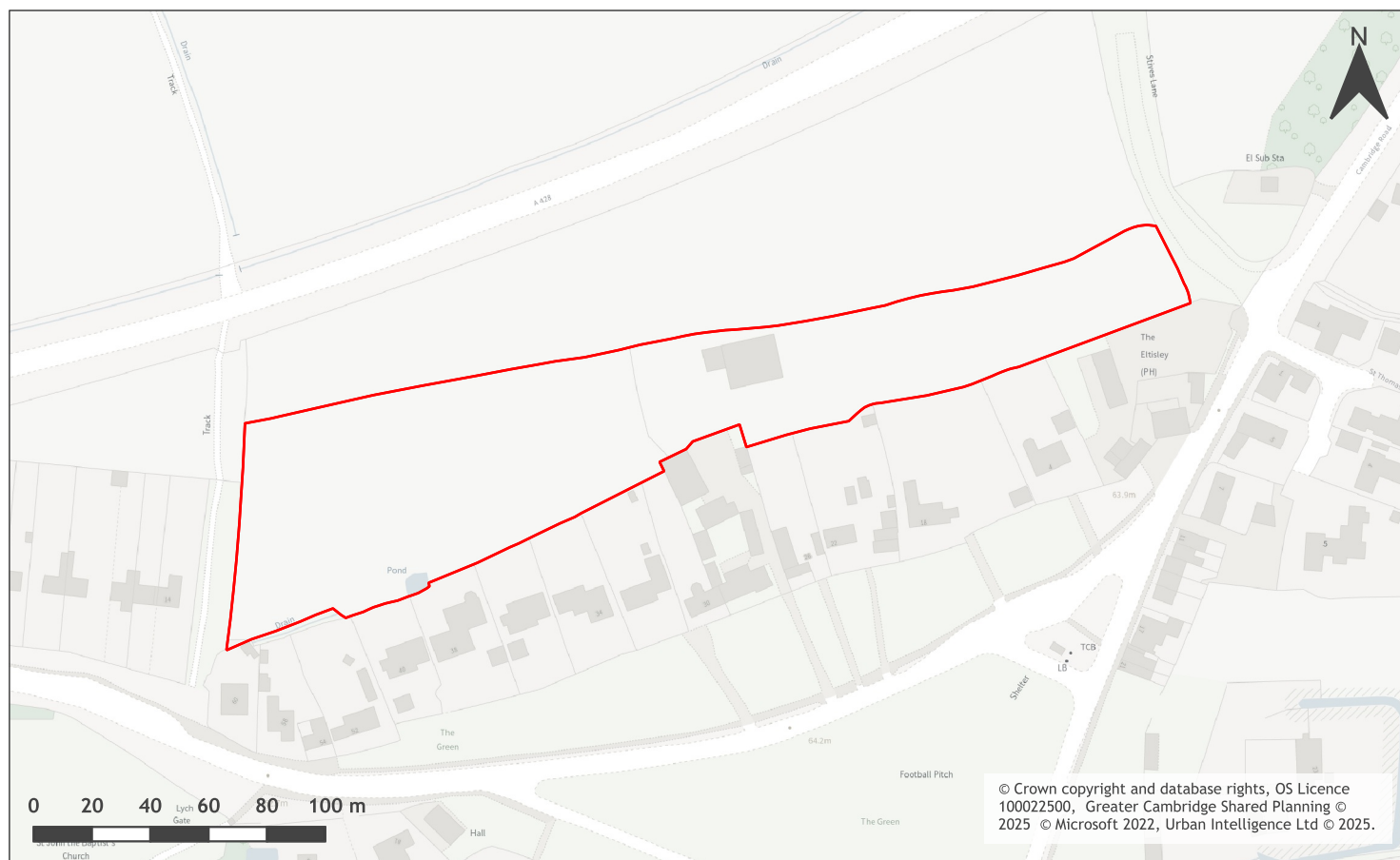
A map of 28 The Green, Eltisley