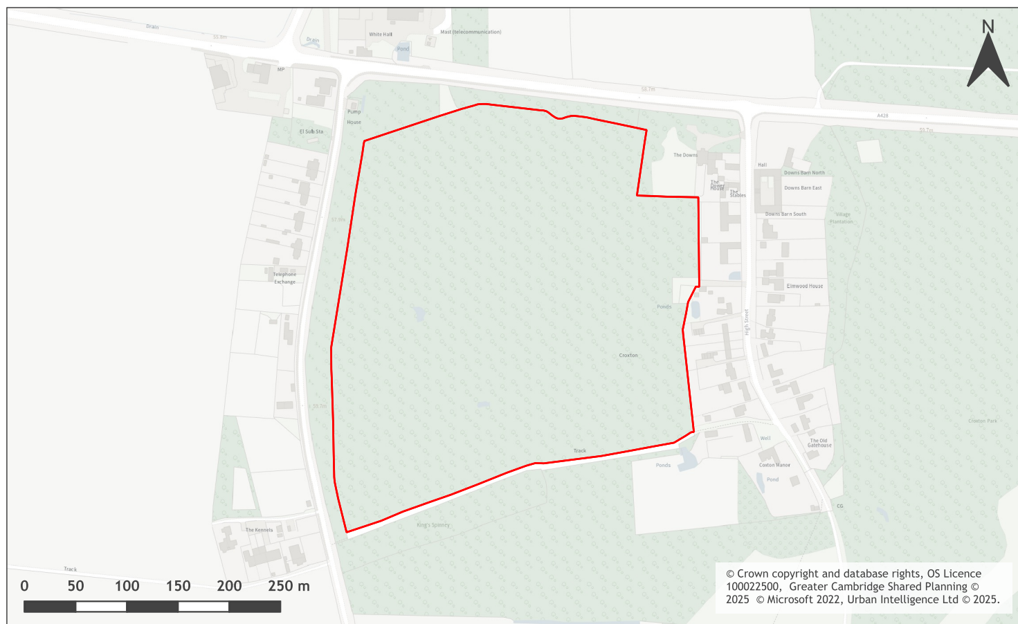
A map of Land south of A428, Croxton