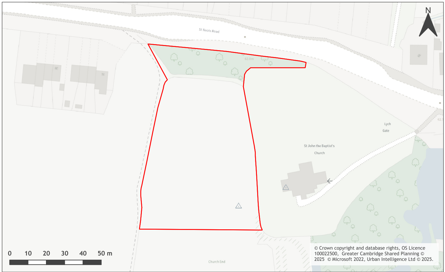
A map of Land south of St Neots Road, Eltisley