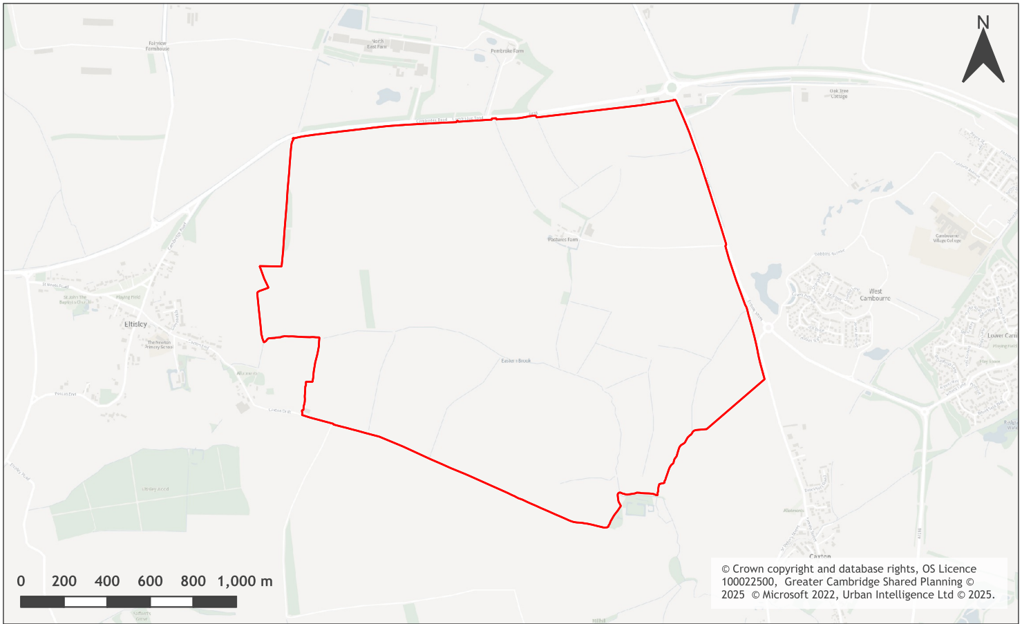
A map of Land south of A428 and west of the A1198, Caxton