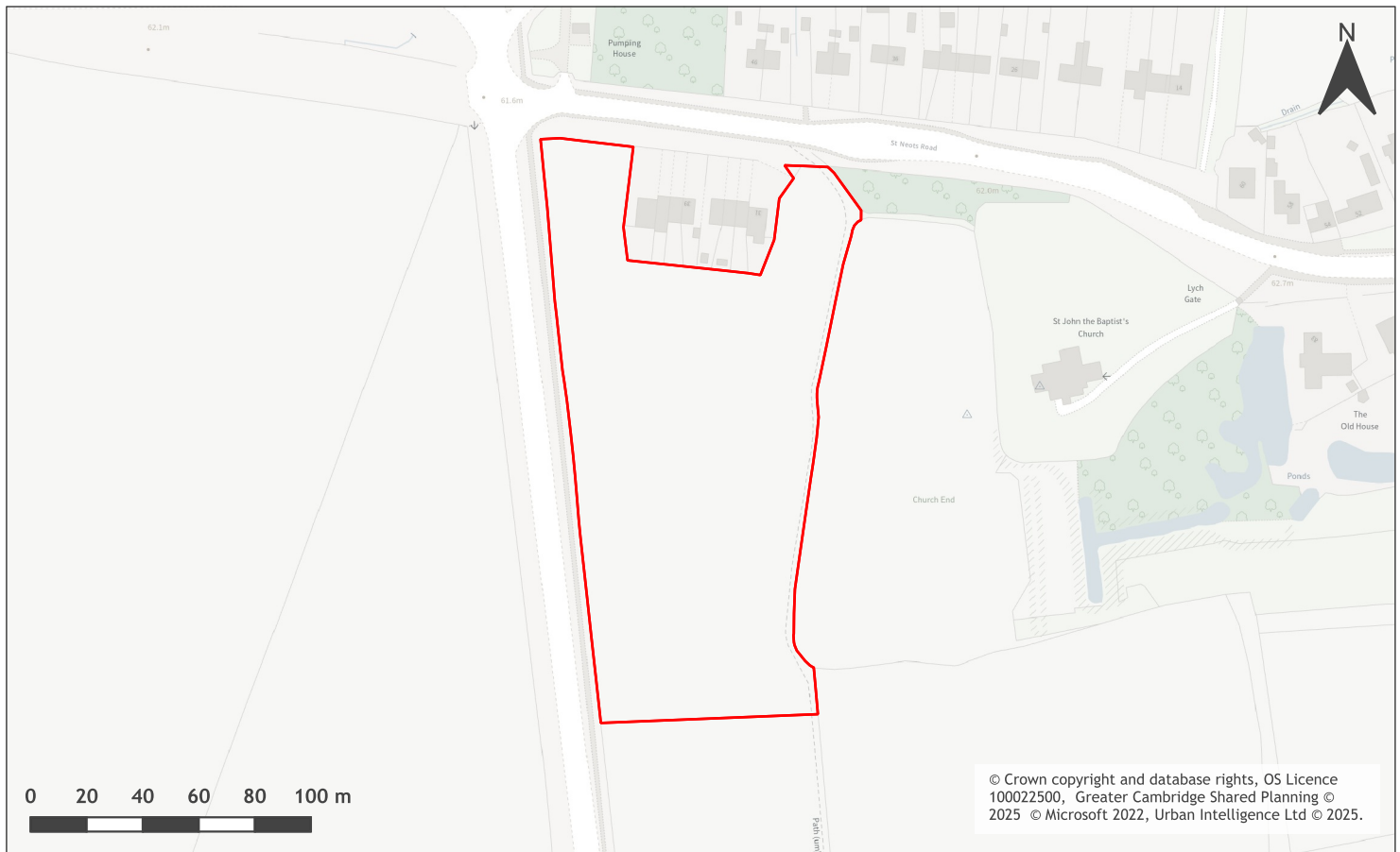
A map of Land south of St Neots Road, Eltisley