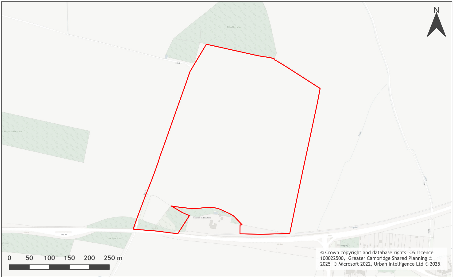
A map of Land north of Croxton Rectory, off A428, Eltisley