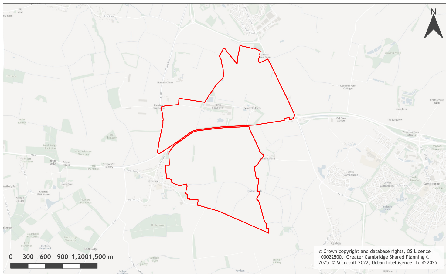
A map of Land north and south of Cambridge Rd, Eltisley