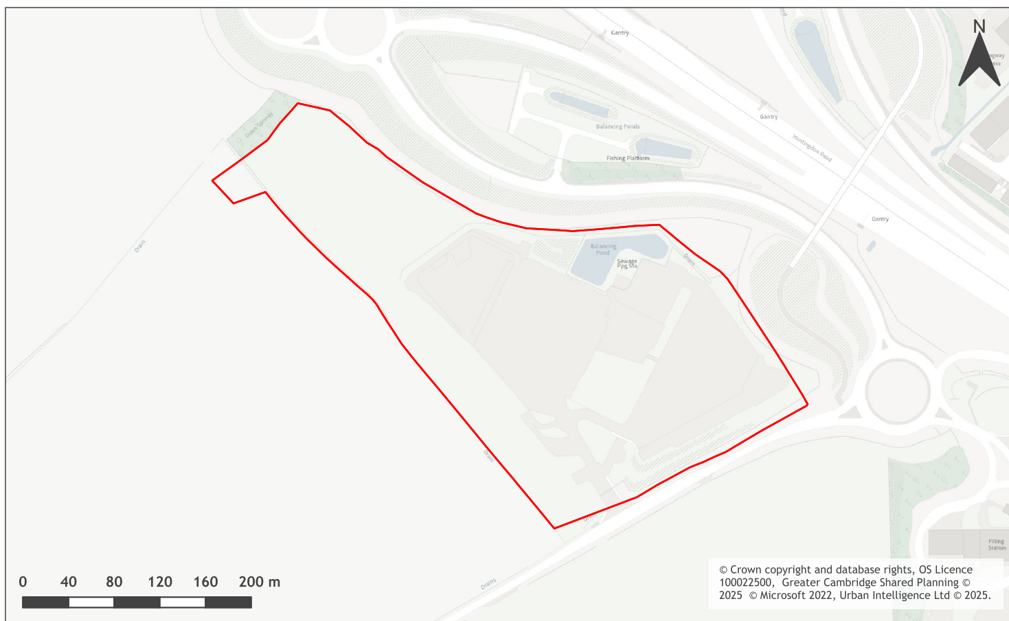
A map of Temporary site compound, Land at Boxworth Road, Swavesey