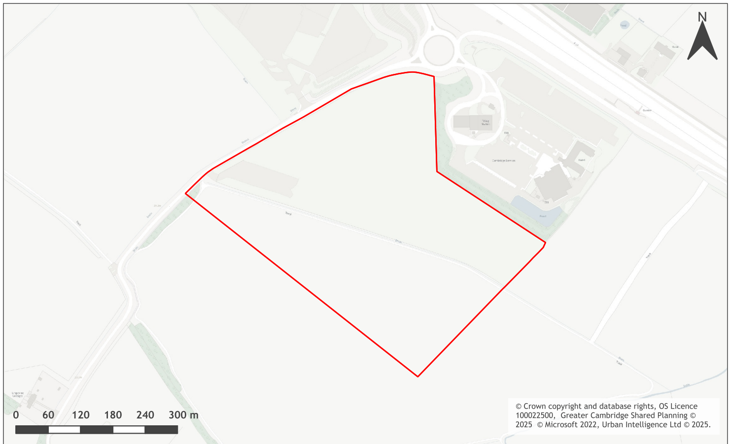
A map of Land to the south of the A14 Services