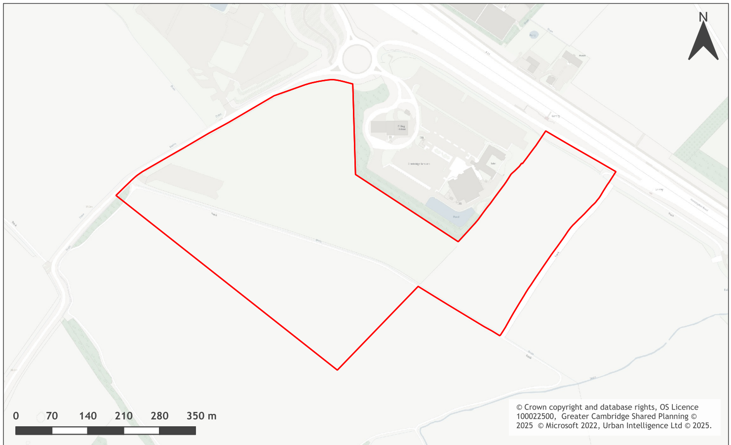
A map of Land to the south of the A14 Services, Boxworth