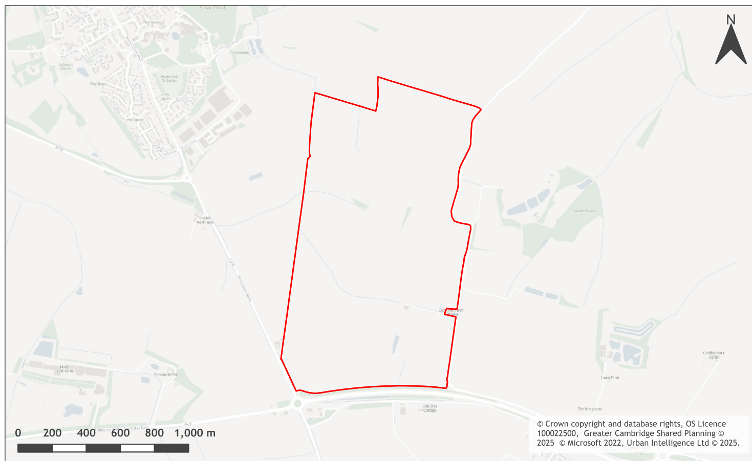
A map of Land at Crow Green, north-east of Caxton Gibbet