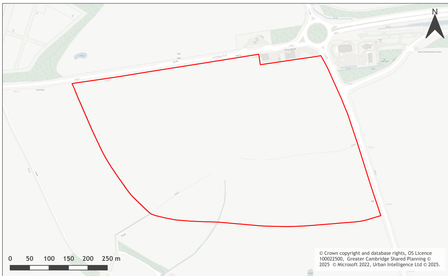
A map of Land south west of Caxton Gibbet