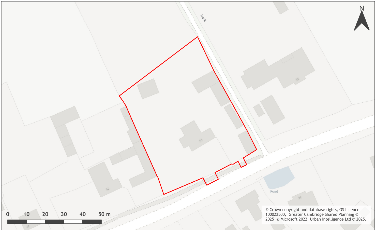
A map of Martins Farm, 53, Boxworth Road, Elsworth