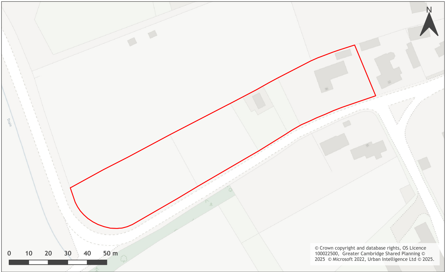
A map of 36 Smith Street, Elsworth