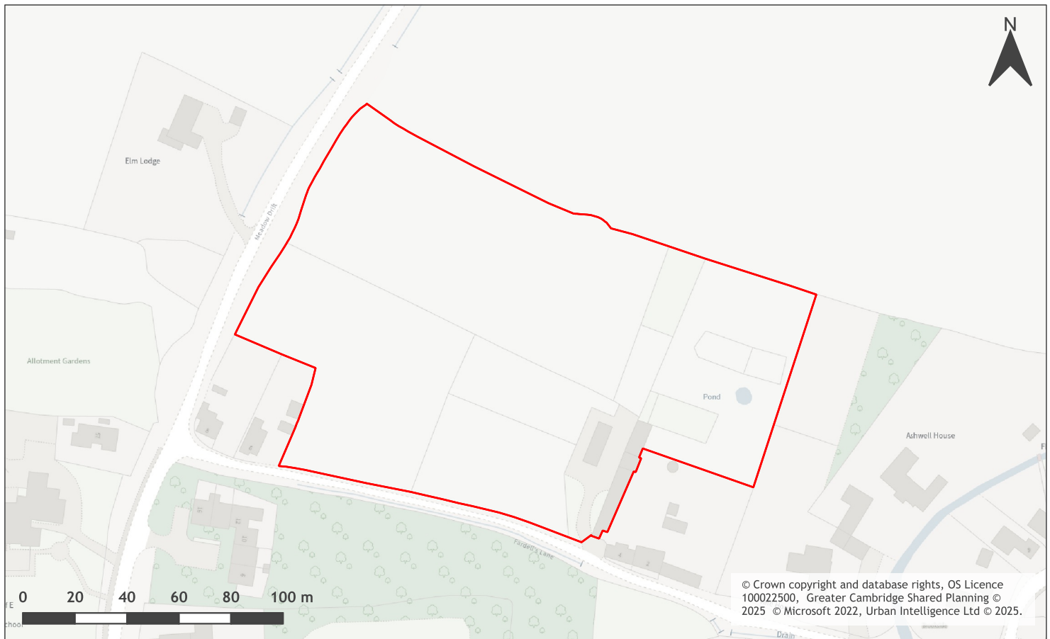
A map of Fardells Lane, Elsworth