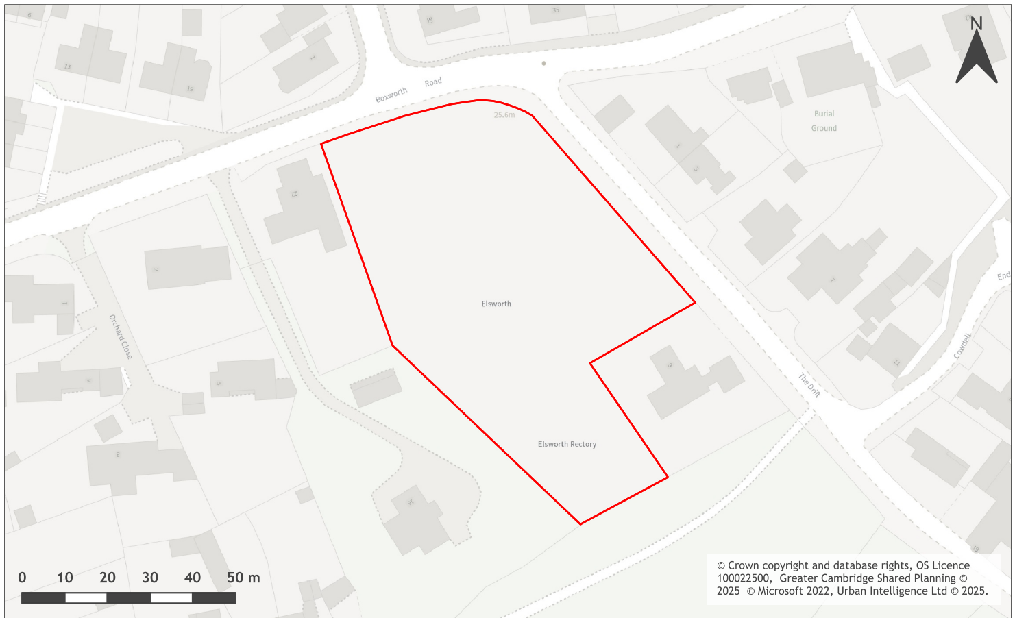
A map of Land off Boxworth Road, west of The Drift, Elsworth