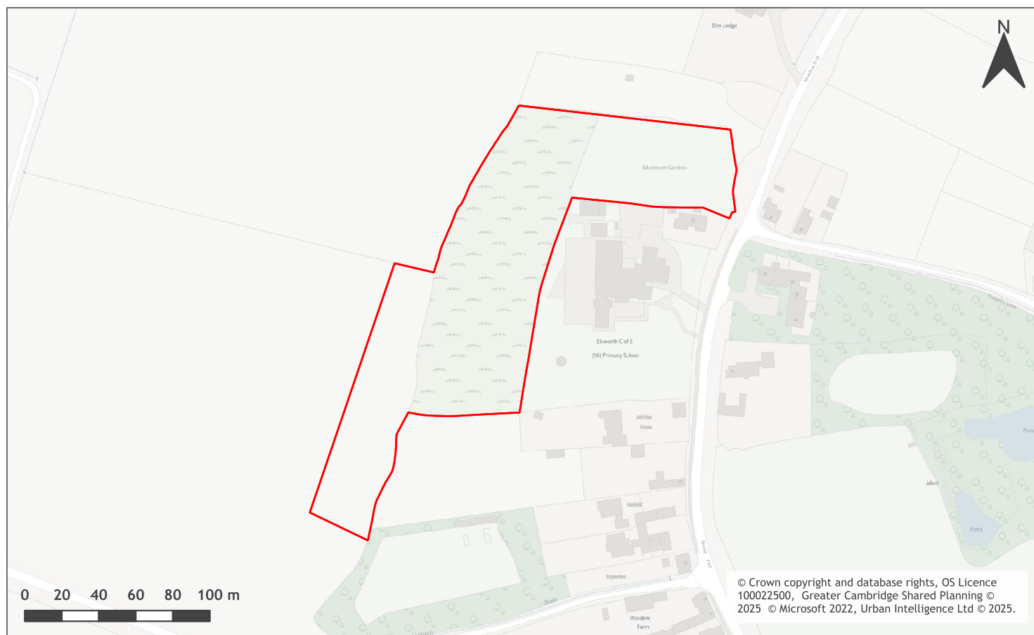
A map of Land at Meadow Drift, Elsworth