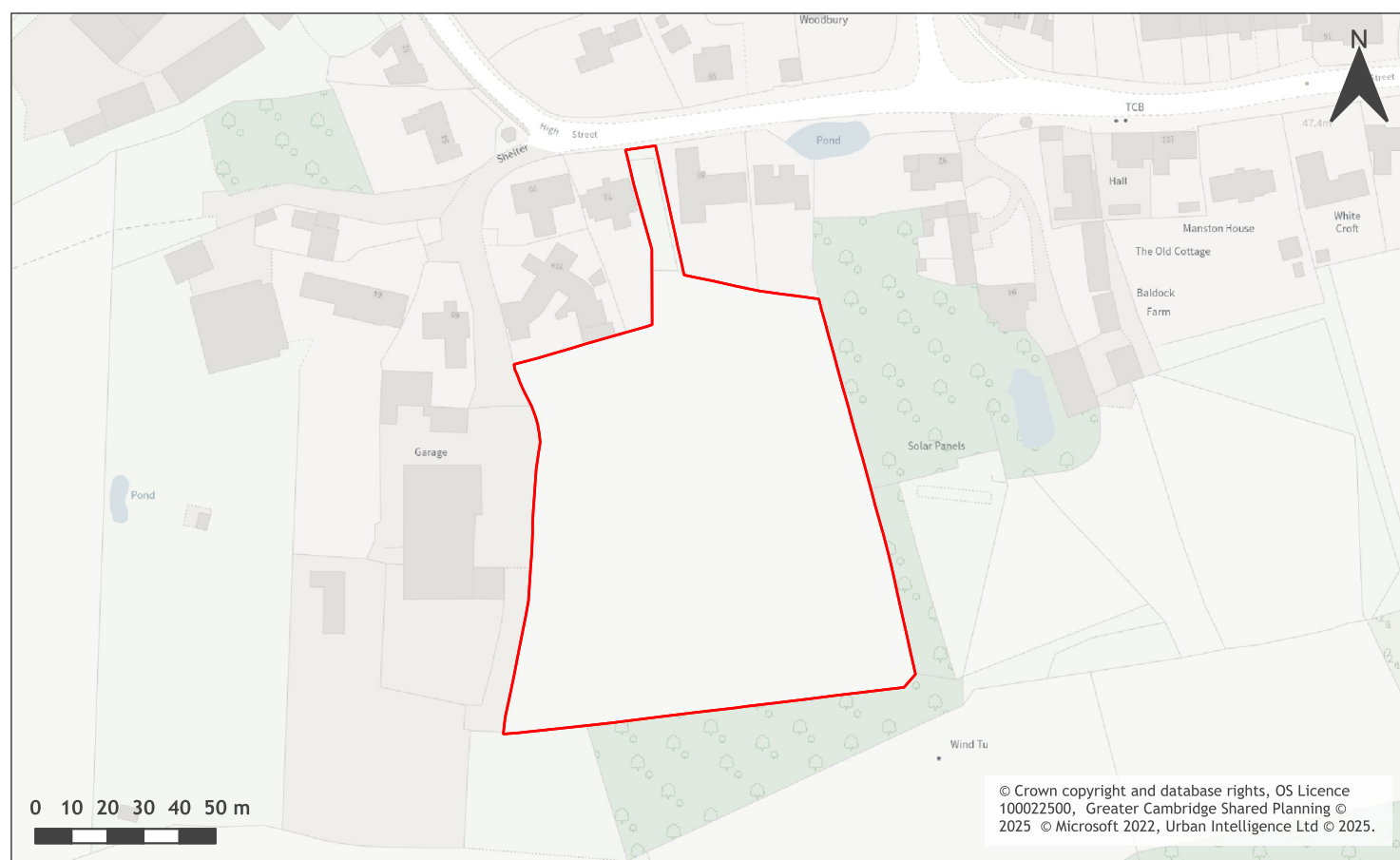
A map of Land south of High Street, (R,O 72), Graveley