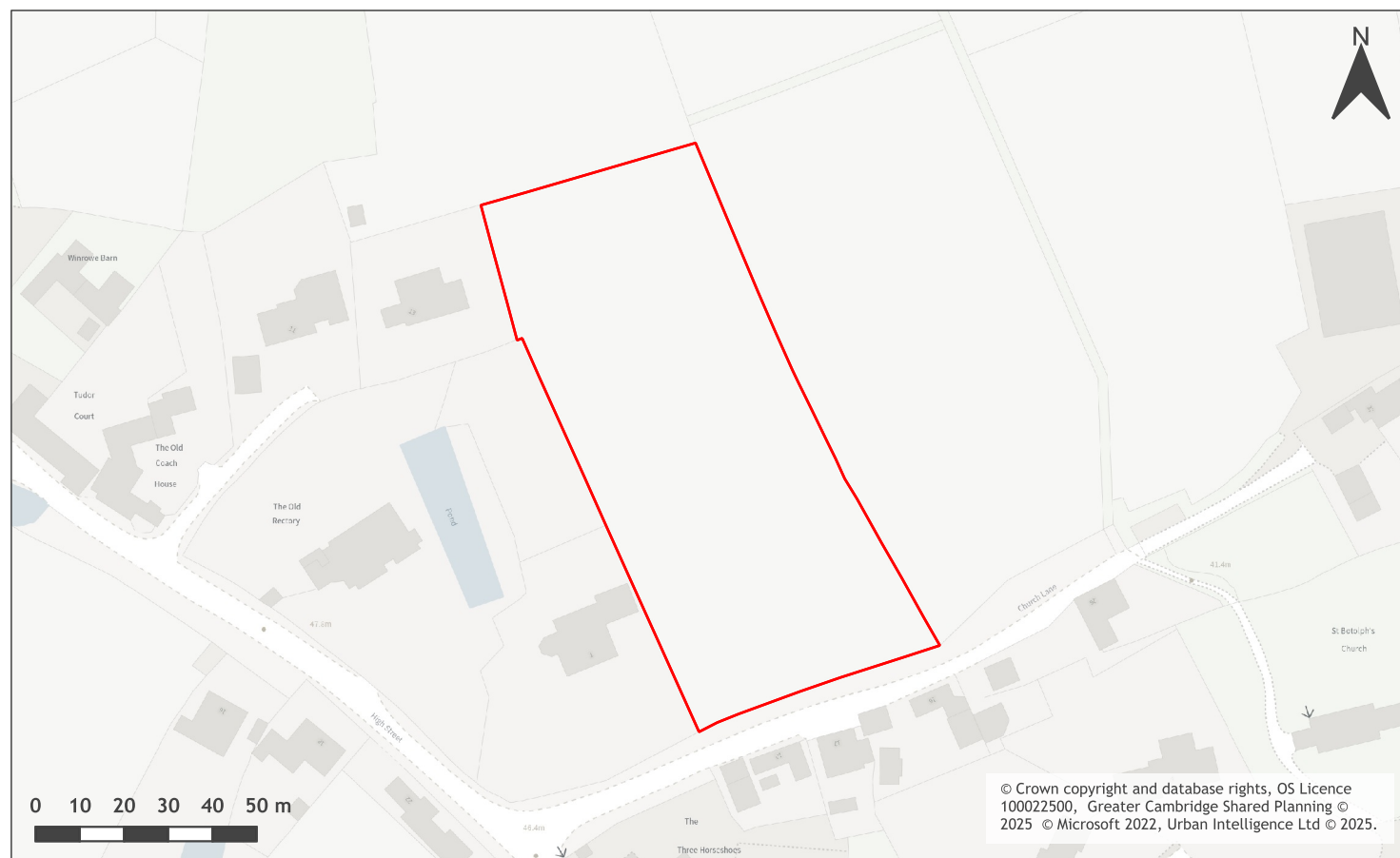
A map of Land off Church Lane, Gravely