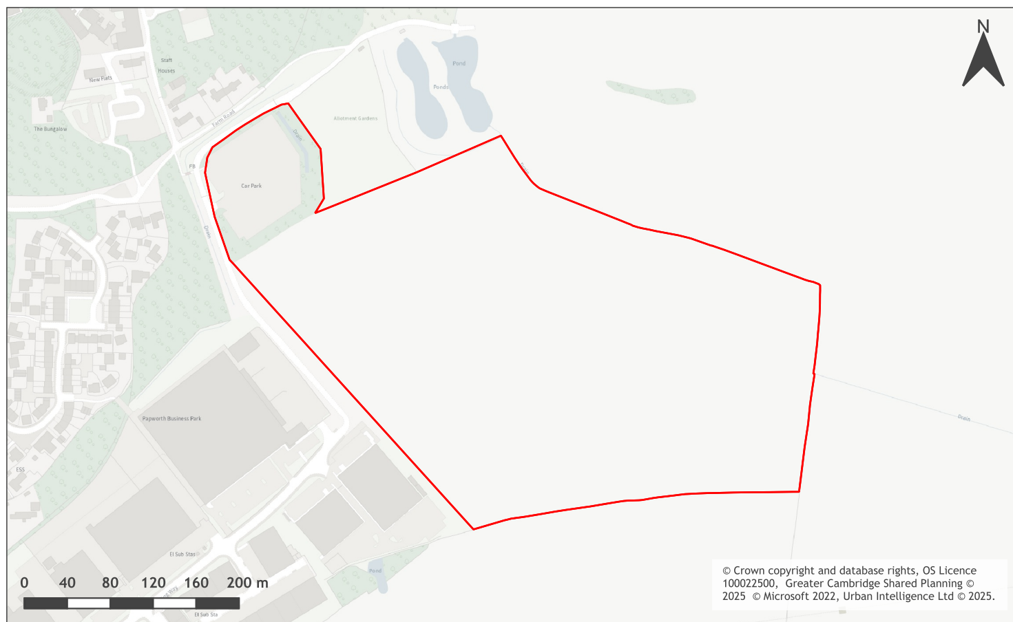
A map of Land to the west of Stirling Way, Papworth Everard (Parcel C)