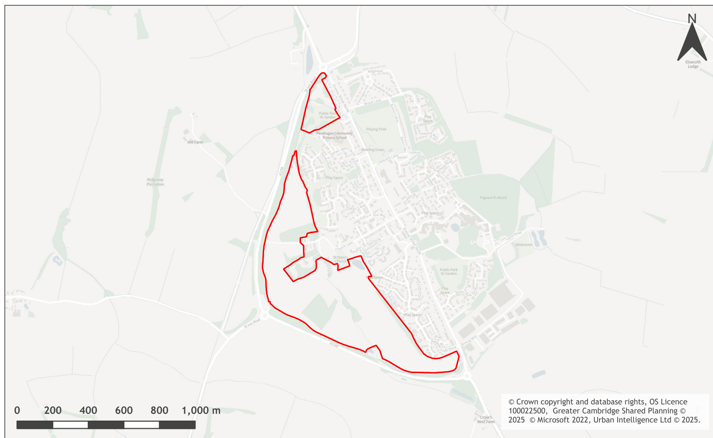
A map of Land to the west of Papworth Everard (Parcels A and B)