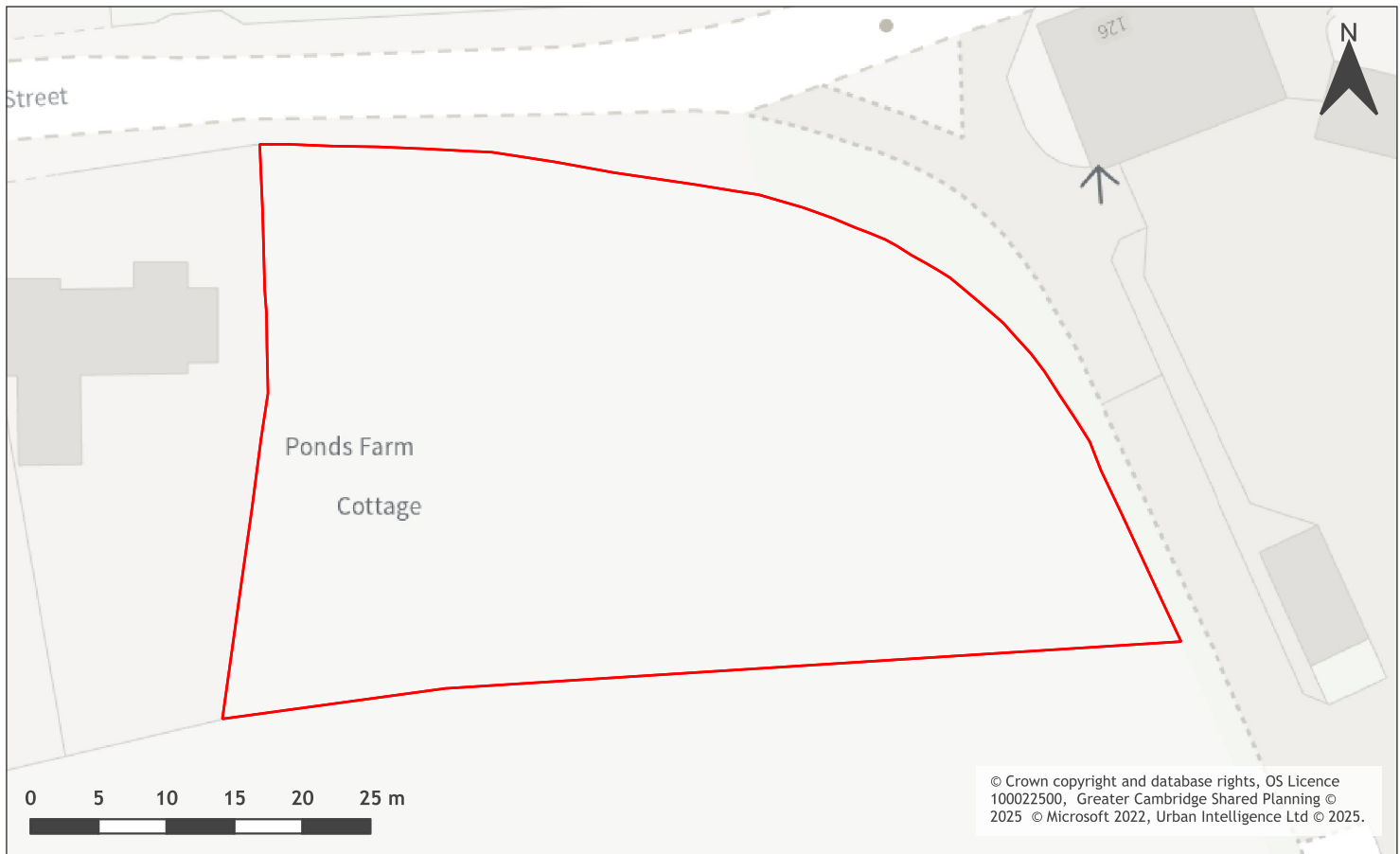
A map of Land adjacent Ponds Farm Cottage, High Street, Graveley