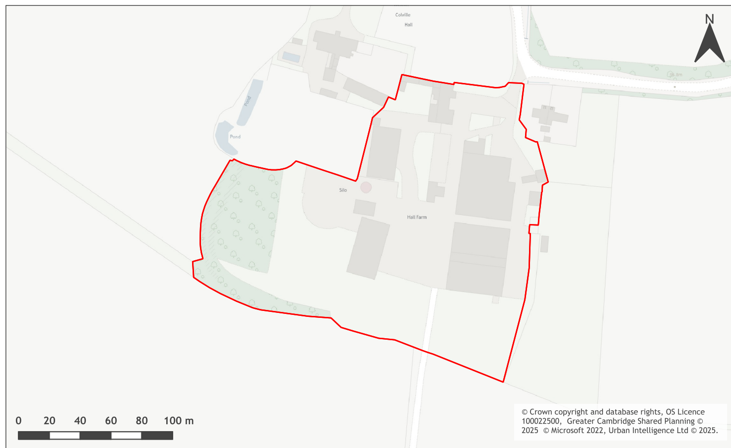
A map of Hall Farm, West Wratting Estate