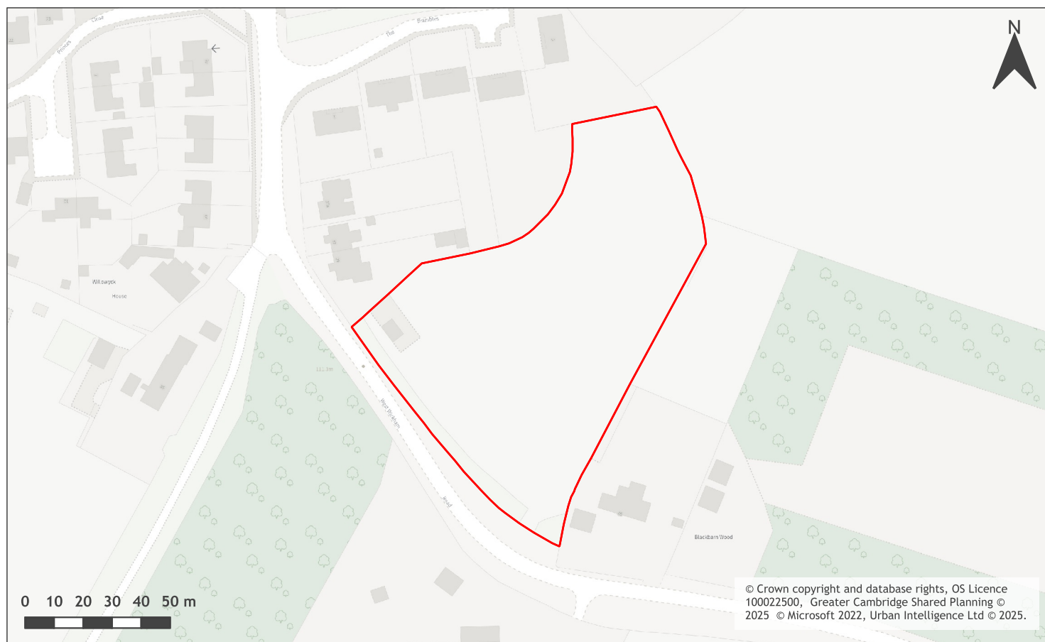
A map of Land north of West Wickham Road, Balsham