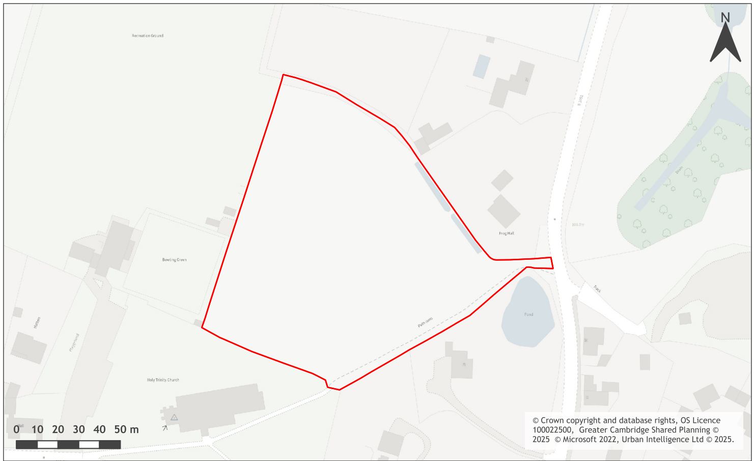
A map of Land west of Wratting Road, Balsham