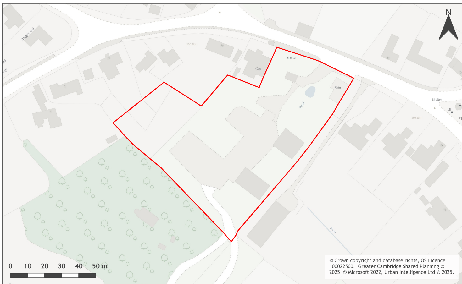
A map of The Lamb Yard, 73 High Street, West Wratting