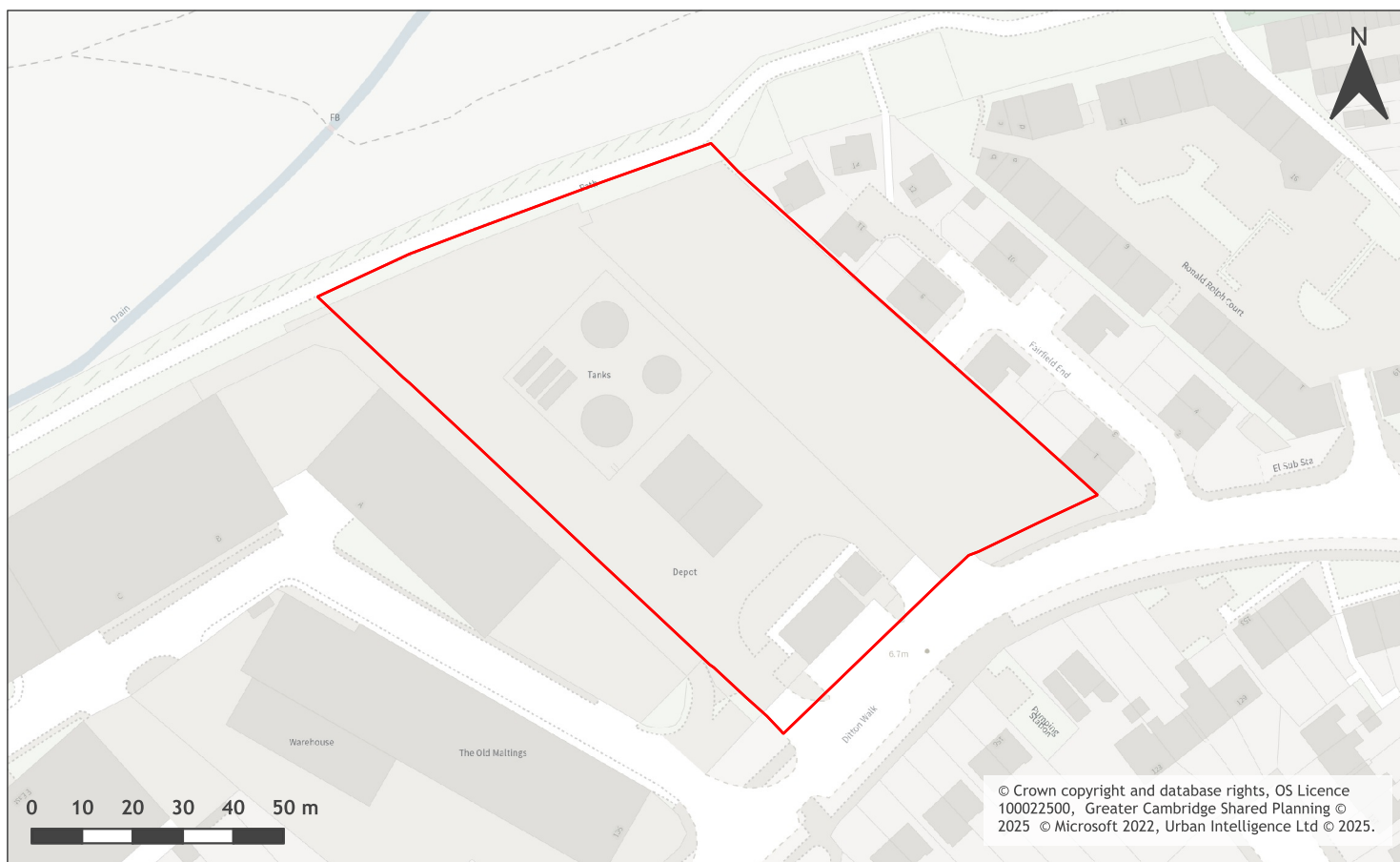
A map of Camfields Resource Centre & Oil Depot (Policy 27 - R5), 137-139 Ditton Walk