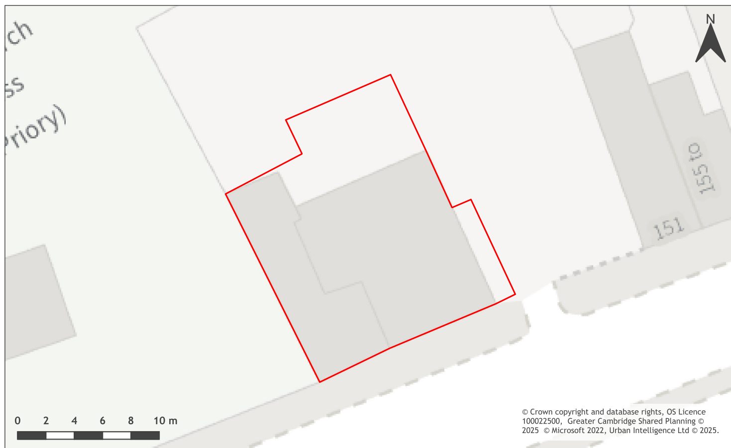
A map of Logic House 143 Newmarket Road Cambridge