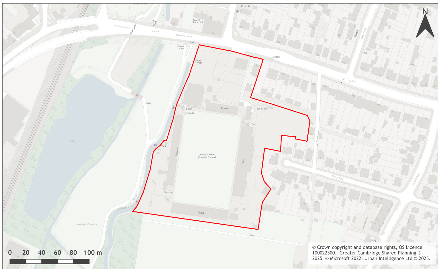
A map of Abbey Stadium, Newmarket Road, Cambridge