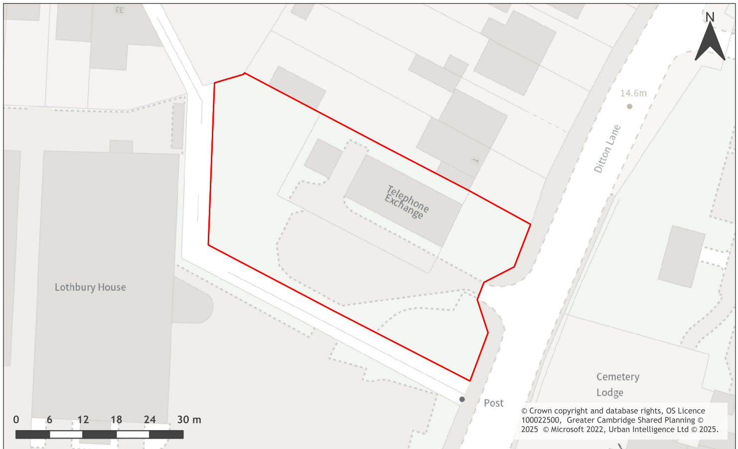
A map of Telephone Exchange south of 1 Ditton Lane